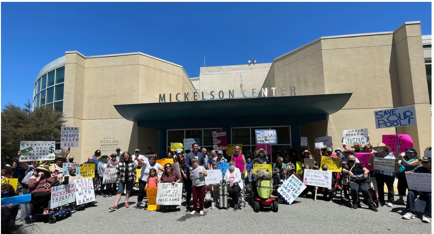
July 24, 2022 rally in front of the Mickelson Center

San Mateo County Central Labor Council Peninsula Health Care District Board of Directors Sequoia Healthcare District Board of Directors San Mateo County Commission on Disabilities Peninsula Special Interest Lions Club Charities, Inc. Cotchett, Pitre & McCarthy, LLP The Legal Aid Society of San Mateo Raging Grannies