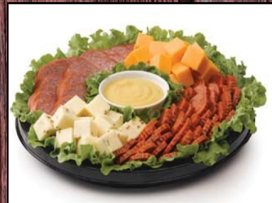
Assorted Meat & Cheese Smoked ring bologna, ham, turkey, Pepper Jack cheese, white cheddar cheese and dipping mustard.