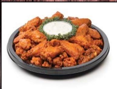
Chicken Wings Our own hickory smoked chicken wings with our BBQ Sauces on the side.