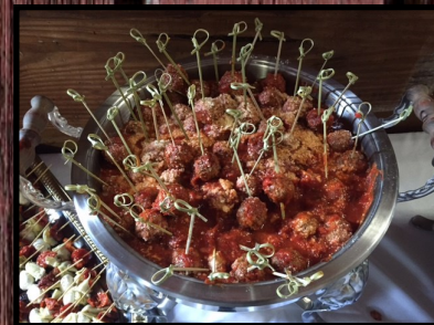
Meat Balls & Marinara Homemade meat balls made with ground beef and parmesan cheese with Marinara sauce. Served on a skewer.