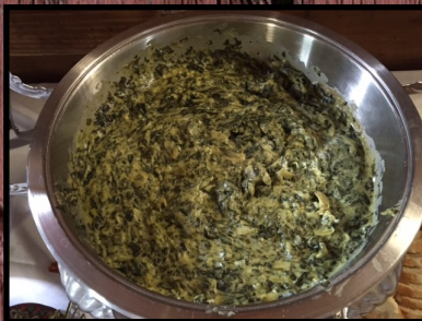
Spinach Artichoke Dip & Flat Bread Spinach, artichoke hearts, sour cream, mayo, parmesan cheese. Served with Toasted Tandoori Nan Flat Bread.