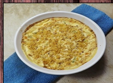
Hot Cajun Crab Dip & Flat Bread Crab meat, mayo, onion, garlic, cayenne pepper & cream cheese. Served with Toasted Tandoori Nan Flat Bread.