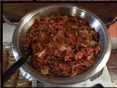
Bruschetta & Baguette Tomatoes, basil, garlic and extra-virgin olive oil. Served with Baguette.

Pick any combination of the items below.