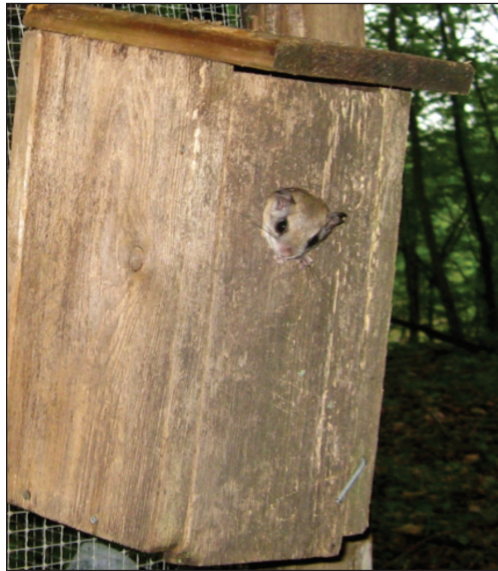
A shy, large-eyed flying squirrel peeks out of a bluebird box on a farm near Centreville.

I have a love hate relationship with squirrels. On the one hand, I can't help admiring their skill in getting around any device that the Audubon Society can dream up. On the other hand, they do eat my birdseed. Squirrel baffles? My resident squirrels simply hang onto the edge with their hind feet and help themselves. A feeder surrounded by a cage? One tried to chew his way through the top and when that didn't work, he simply hung upside down on the cage and swung the feeder faster and faster until the seed spilled on the ground. I also gave up planting tulips in my garden after he and his pals dug up all the bulbs and ate them.