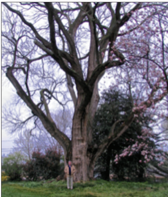
Osage Orange (Madura Pomifera) – MD State Champion; 101' tall, 258" circumference. Private property, Centreville