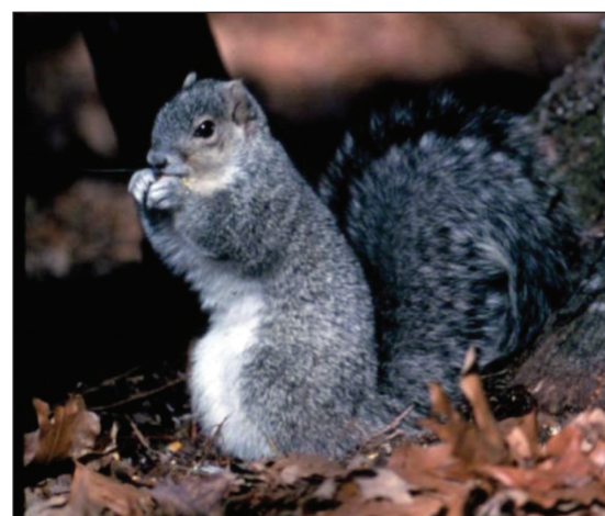
The endangered Delmarva Fox Squirrel

The most famous member of our squirrel tribe, however, is the Delmarva fox squirrel. A subspecies of the eastern fox squirrel, Scurius niger , another denizen of the eastern woods, it is only found here on the Peninsula. Although its gray coat and white under parts superficially resemble those of the familiar gray squirrel, the Delmarva fox squirrel is considerably larger, with a