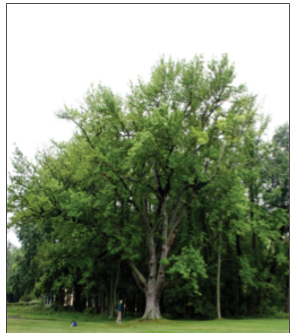
Sweet Gum (Liquidambar styraciflua); tied for 2nd place; 85' tall, 179" circumference. Prospect Bay Country Club, Grasonville