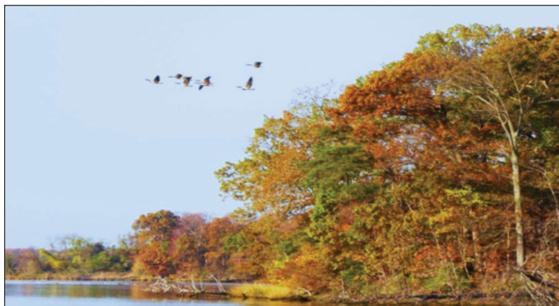
QAC – Woods, Water and Wildfowl

This is great news for Historic Stevensville and its arts and business communities, as well as for Kent Island and our County. Fulfilling the promise of the A&E designation will take time and considerable effort, but the groundwork has been laid and the possibilities are exciting. We owe our thanks to those who saw Stevensville’s potential, worked to earn this designation, and are committed to its success.