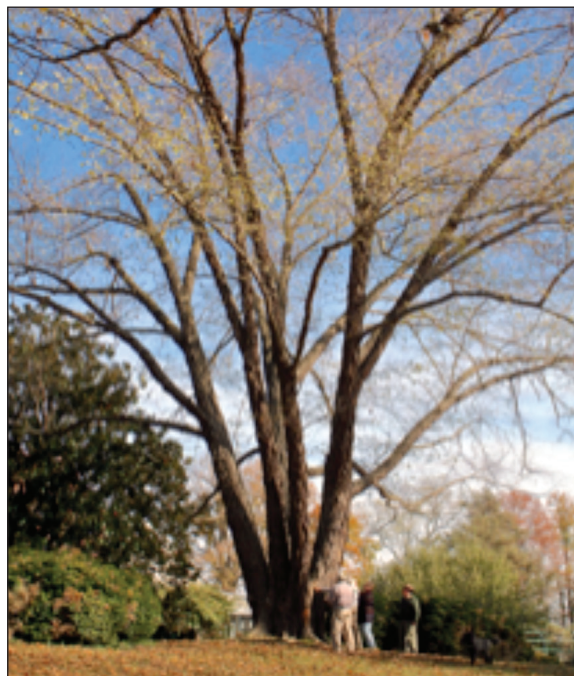
River Birch (Betula nigra) MD State Co-Champion; 88' tall, 167" circumference. Private property, Centreville