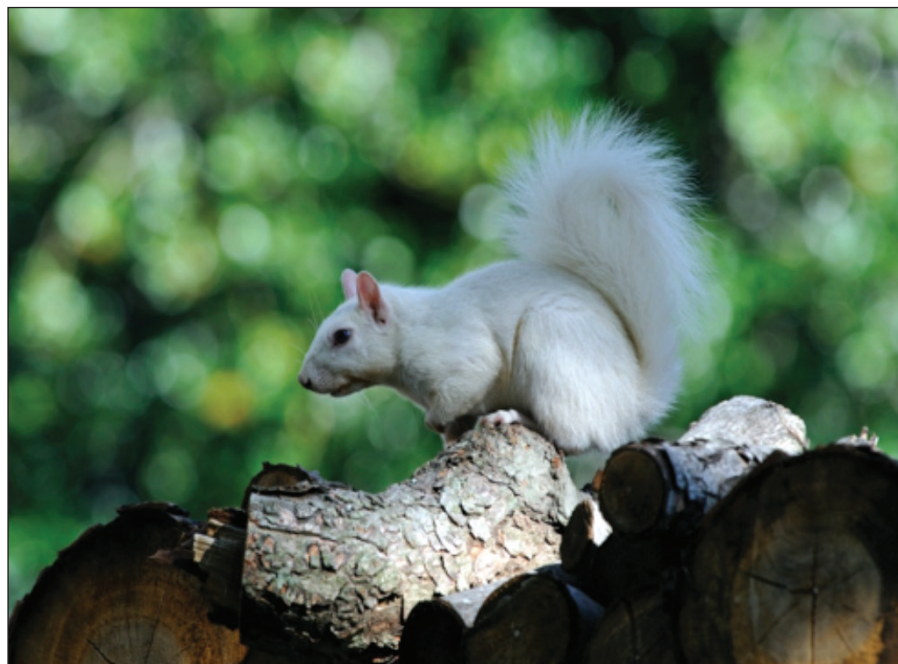
One of Queenstown's blue-eyed white squirrels

These days, it seems as if squirrels are everywhere, but it was not always so. Although early settlers to this country told of mass migrations of as many as a thousand individuals moving through the woods at once, by the early twentieth century so much of the original forest had been cut that they were actually in danger of becoming extinct. We forget that they are an arboreal species and are only found where mature deciduous trees or pines produce plentiful amounts of seeds and nuts. (Of course, we help them out by those well-stocked bird feeders.)