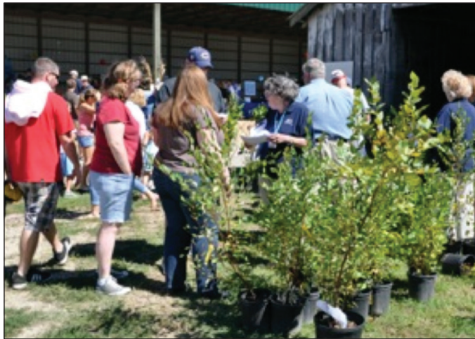
First 150 visitors at Corsica Watershed Awareness Day get a free tree!

The environmental education is provided by exhibits on rain gardens, oyster restoration, storm water management, river testing results, living shorelines, land preservation, cover crop programs, septic system upgrades, and other environmental issues. Back by popular demand will be Scales and Tales with their wildlife exhibit and the