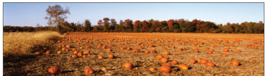
Autumn scene in Queen Anne's County