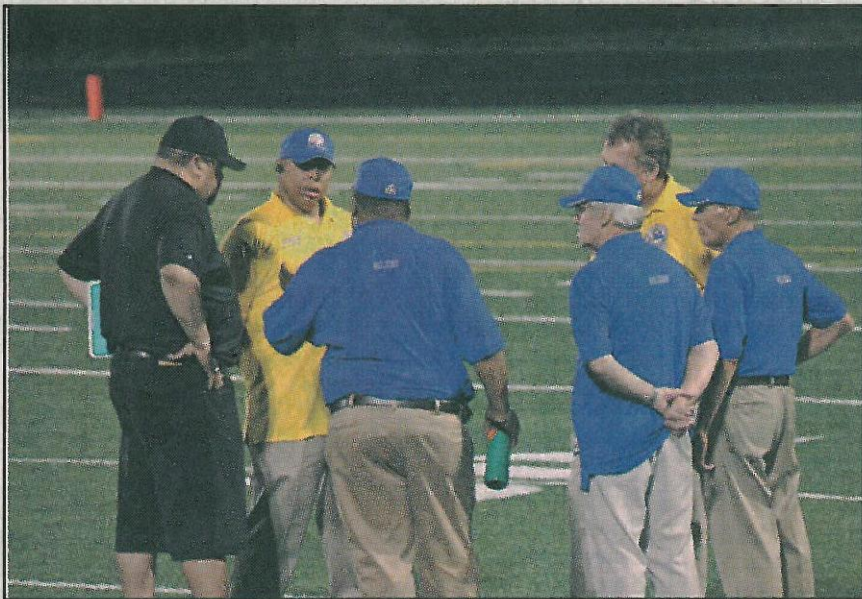
The Oilers brain trust looking for ways to solve the Gladiators defense.