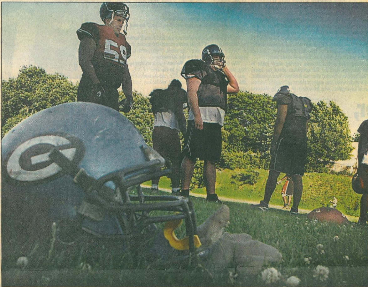
The Quincy Granite prepare for their season opener tomorrow night against the Boston Cowboys.