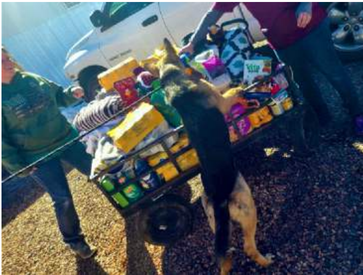
By the looks of Dusti, he is the new representative of the shelter showing his appreciation for the Blue Ridge Elementary Student Council!

As a first attempt for BRES Student Council to honor Betty White, it was a tremendous effort! Excitingly, BRES Student Council is planning to make this an annual tradition and is hoping to expand it schoolwide to reach out to other campuses. Thank you, BRES Student Council!