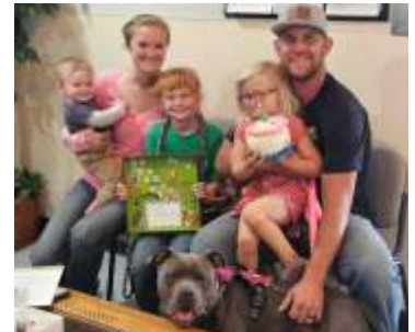
The Winters family adopting the adorable Irene. HSWM helps complete families and make more smiles.