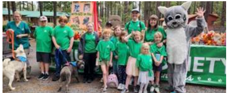
Critter Campers gather for the Fall Festival Parade with the HSWM float, Pinetop 2023