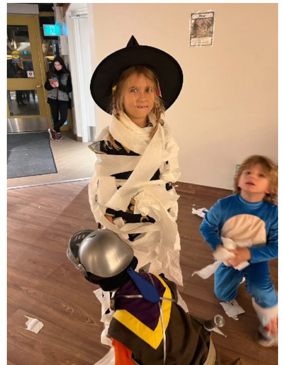
Beavers: How to put on an band-aid, personal first aid kits, Paramedic visit, canoe painting, camp prep, Halloween challenge