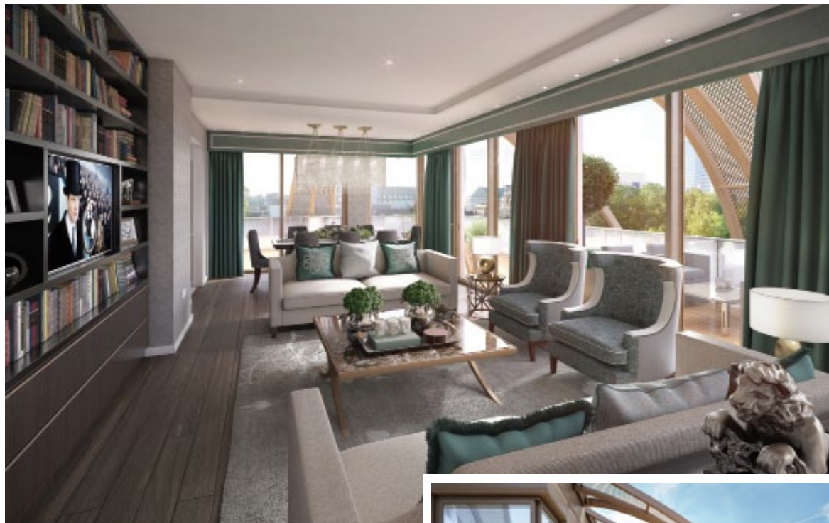
■ The main living area features the new Arteor 10IN touch-screen