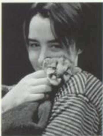
...a baby cougar!