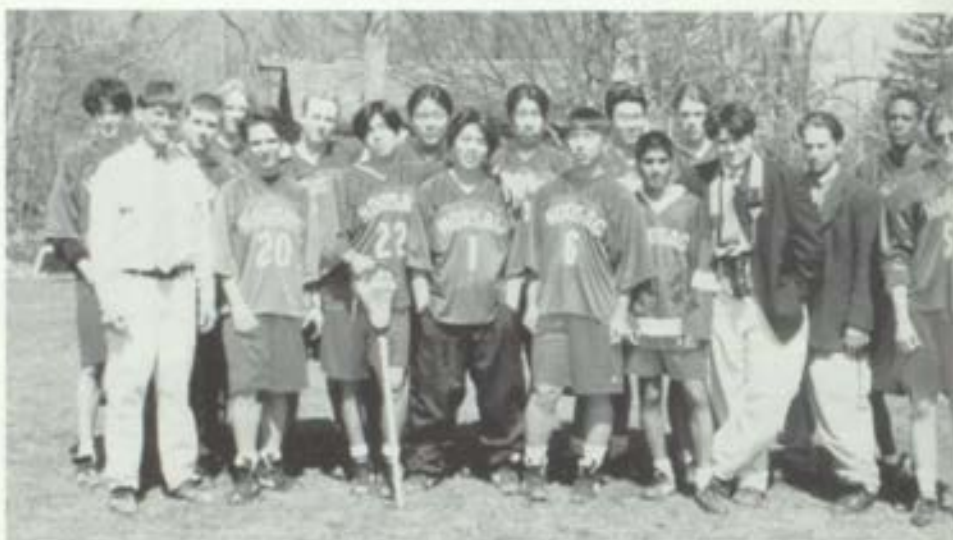
BOYS VARSITY LACROSSE