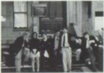
New York State Museum