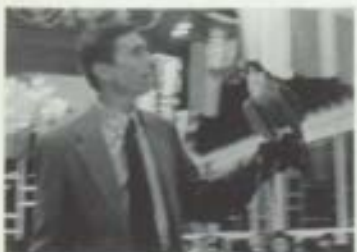
Birdman of Buskirk