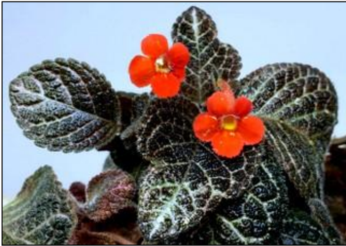
Barb's Episcia 'Longwood Gardens'