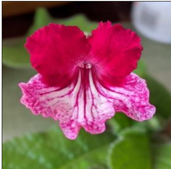
Kitty's Streptocarpus 'Ladyslipper's Red Bicolor', aka 'Dibley's AK Sassy Girl'