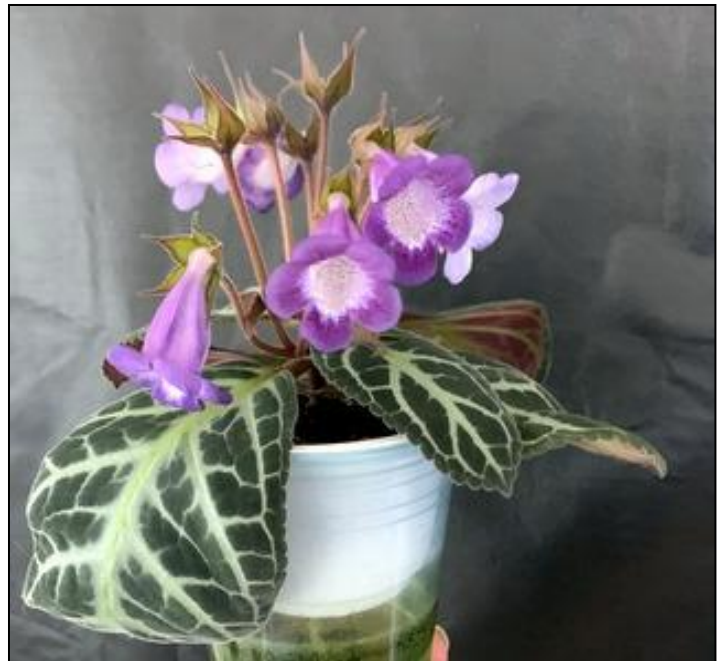
Donna's Sinningia speciosa 'Regina da Vista'. Interesting leaf veining. When buds first open they hang down and then begin to rise up so you can see inside the blooms. More blooms keep coming and coming! I did notice a light fragrance once but I shall keep checking to confirm.