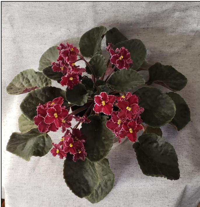
Barb's Saintpaulia 'Emergency'