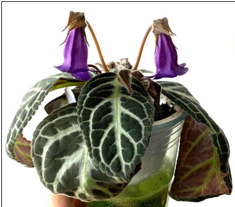
Donna's Sinningia speciosa 'Regina da Vista' from Mauro's seed at Brazil Plants. The first blooms open and hang like bells.