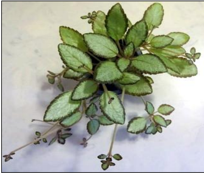
Bill's Episcia 'Silver Skies'