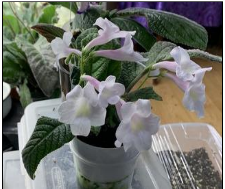
Donna's Streptocarpus 'Bristol's Goose Egg' is definitely fragrant.