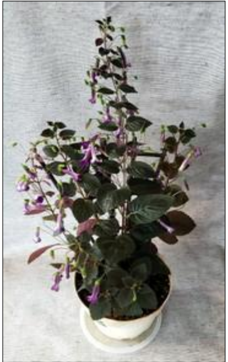
Barb's Sinningia 'Deep Purple Blooming'