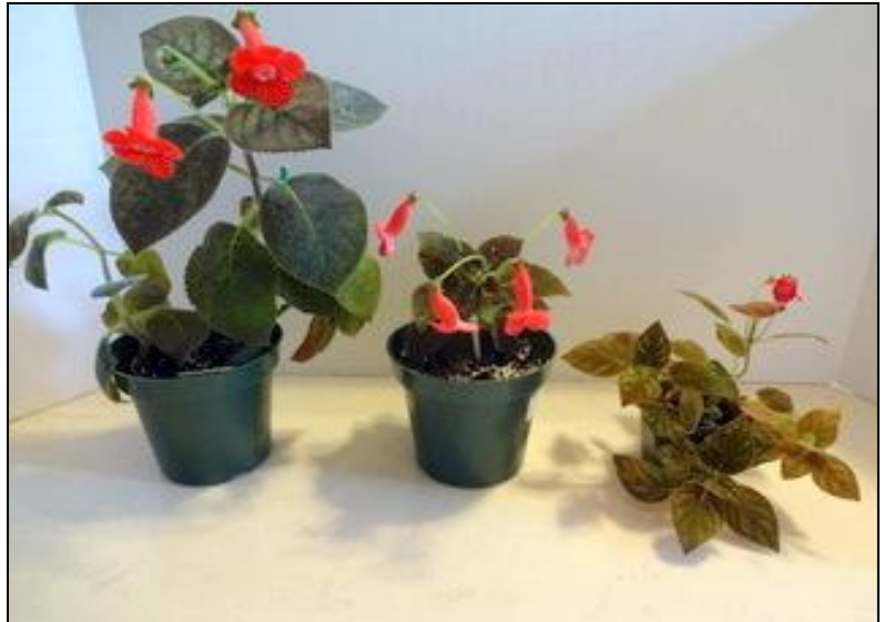
Bill's Kohlerias 'Red Ryder', 'Strawberry Fields', & 'Flirt'