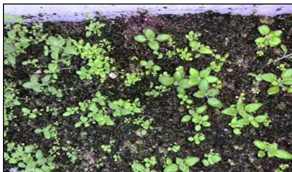
Smithiantha multiflora seedlings. I think every seed germinated! Time to move them again.

Brazil is not allowing any international packages or letters to be mailed from their country until further notice due to Co-Vid 19. Mauro has our seed order ready but cannot send them yet. Time to see if any of your 'stash' of older seeds are viable! Have fun!