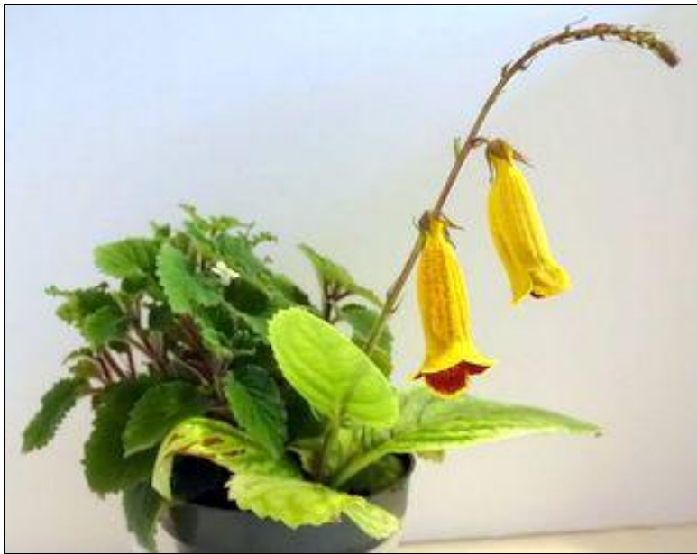
Bill's Titanotrichum oldhamii : "Last Fall I had quite a few rhizomes of Titanotrichum oldhamii so I planted them in different places, a couple of plastic pots under the lights, in a clay pot that I set out in the back yard, and in the ground next to a brick wall. The ones under the lights showed a lot of chlorosis including this one that I didn't realize I had planted in with an Amallophylon . I checked the clay pot and the rhizomes looked good, but they haven't sprouted. I am still waiting to see what comes up from the ground."