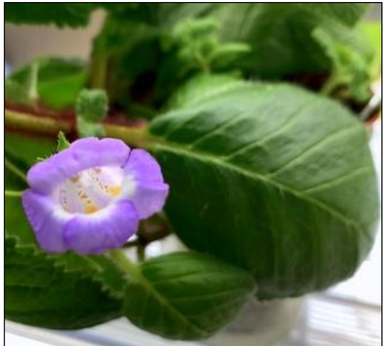
Donna's Eucodonia hybrid seedling.....close-up. The red hairs on the stems are beautiful along with the serrated edges of the leaves that have tiny hairs but not red.