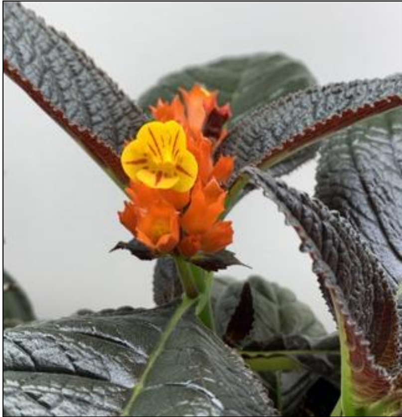
Donna's Chrysothemis pulchella 'Black Flamingo' orange bracts first appearing with little yellow flowers embedded in center of bracts. In second picture first flower has emerged.