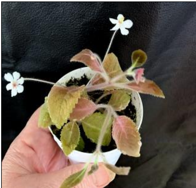
Donna's Amalophyllon divaricatum