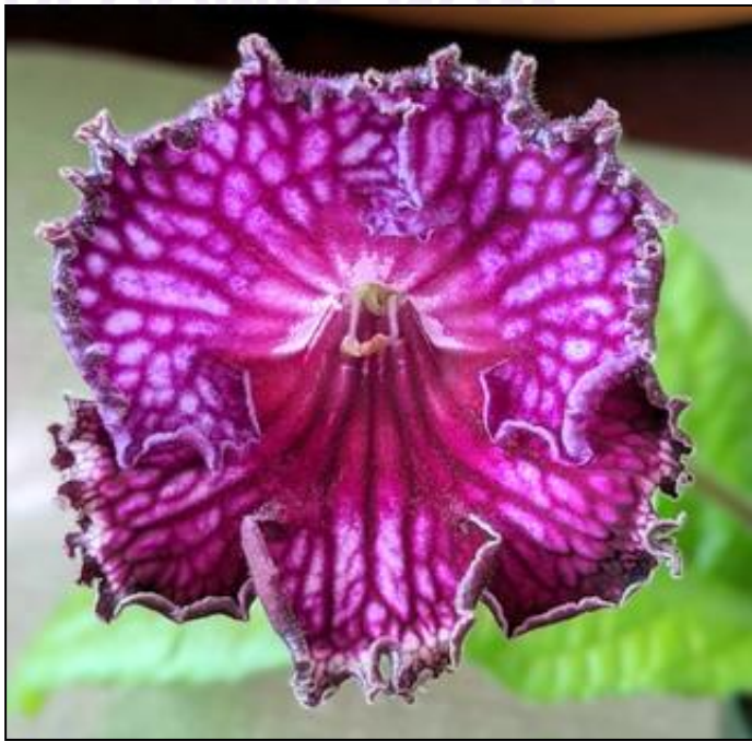
Kitty's Streptocarpus 'Dem the Gypsy Baron'