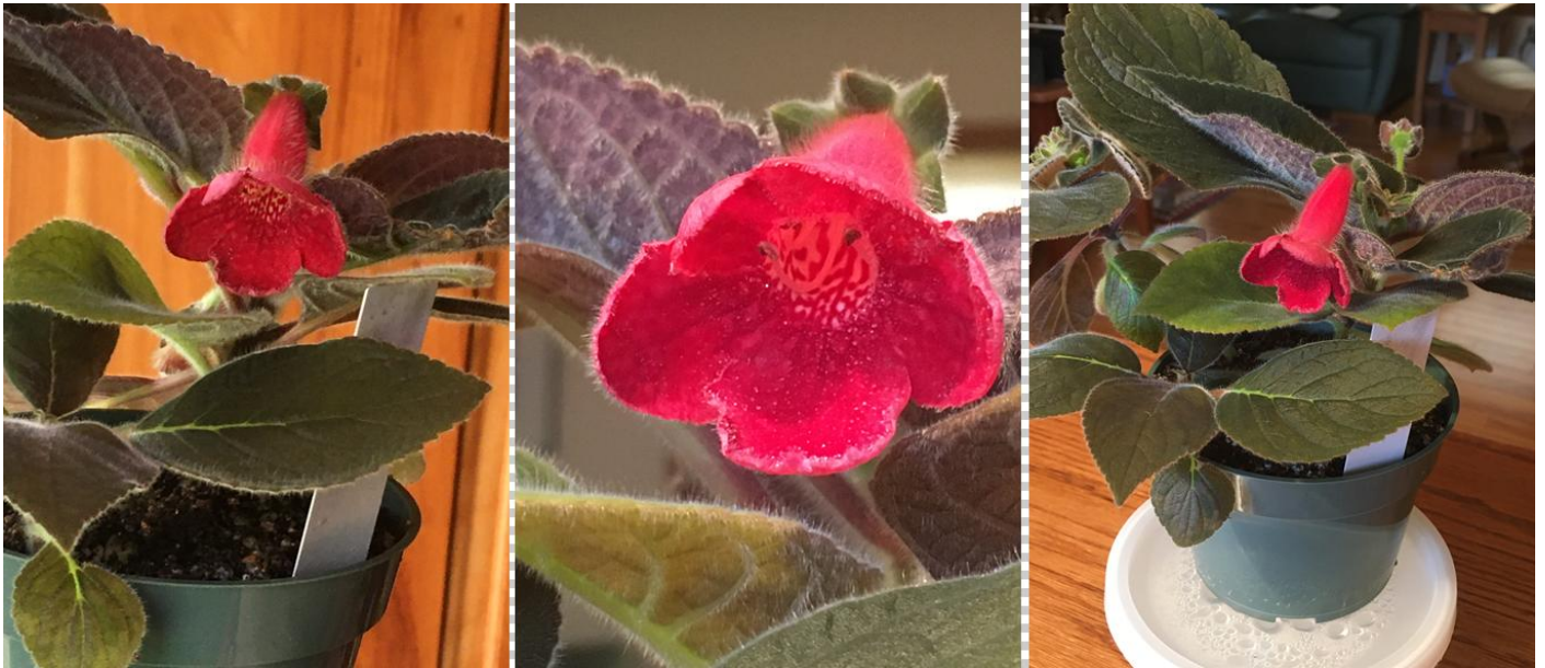
Janet's Kohleria 'Red Ryder'. Today (4/10/20) this Kohleria bloomed for the first time! It was received from our raffle table a couple of months ago and, as the name suggests, it has an intense deep red coloring. The plant is developing many more blooms and should bring a nice spot of color to my kitchen window in the next week or so!