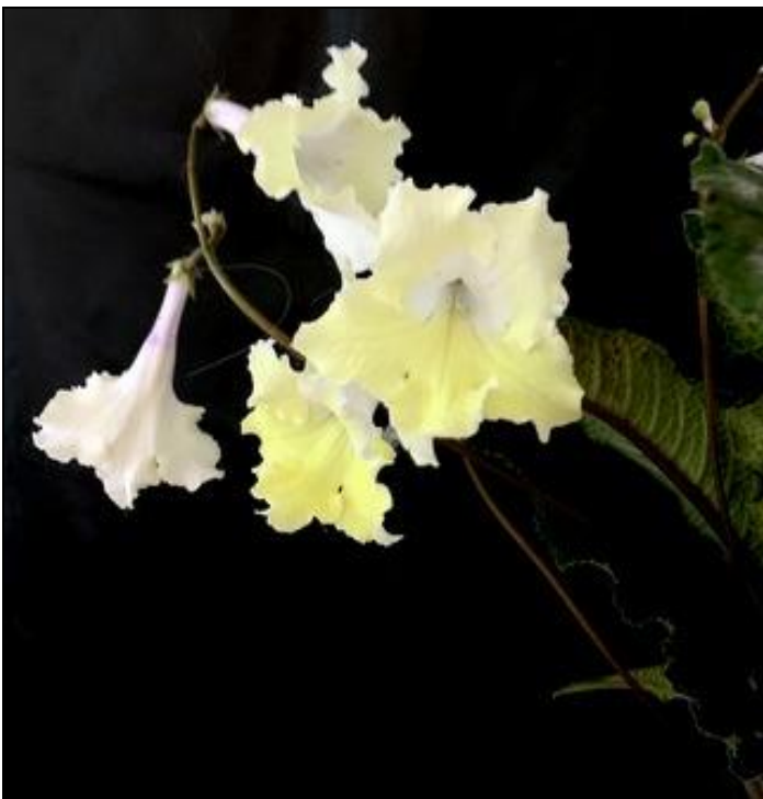
Donna's Streptocarpus 'Zlotko'