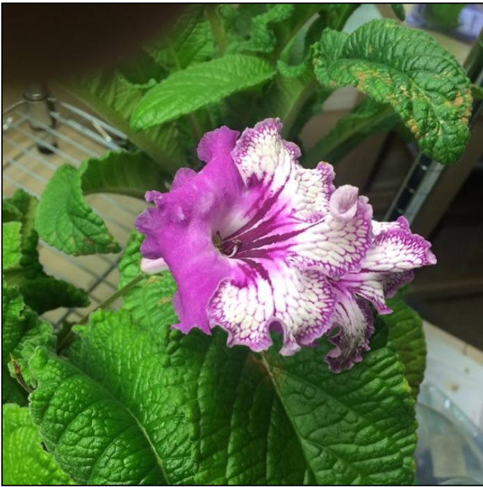
Brian's Streptocarpus 'DS in Lace'