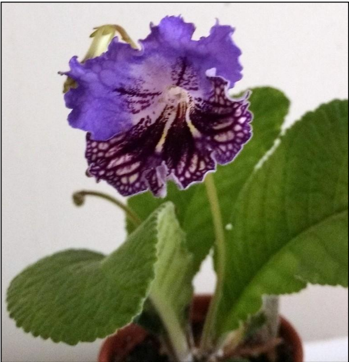
Barb's Streptocarpus 'Kahinta'