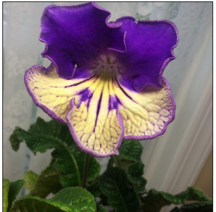
Brian's Streptocarpus 'DS Mozart'