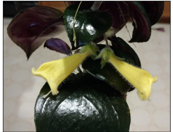
Barb's Nematanthus Yellow NOID