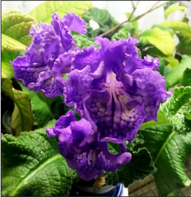
Brian's Streptocarpus 'DS Waterfall'