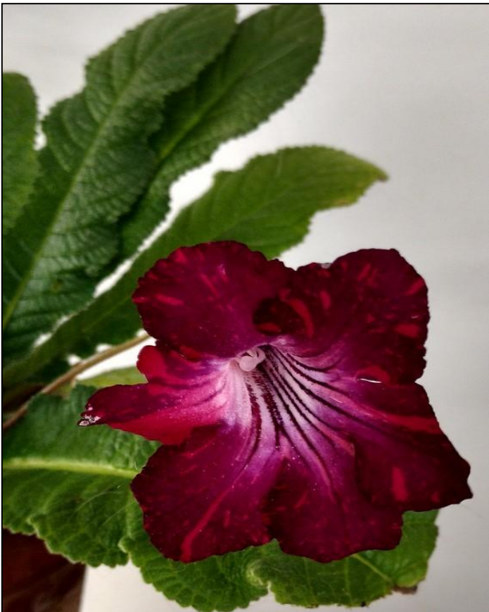
Barb's Streptocarpus 'JJ's Redhead Fantasy'