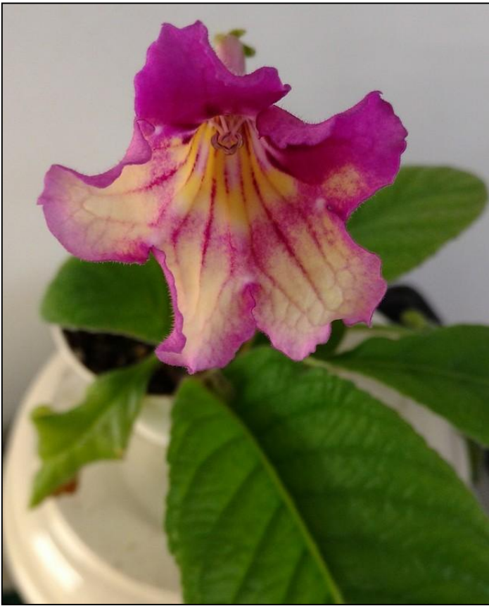
Barb's Streptocarpus 'Can Can'