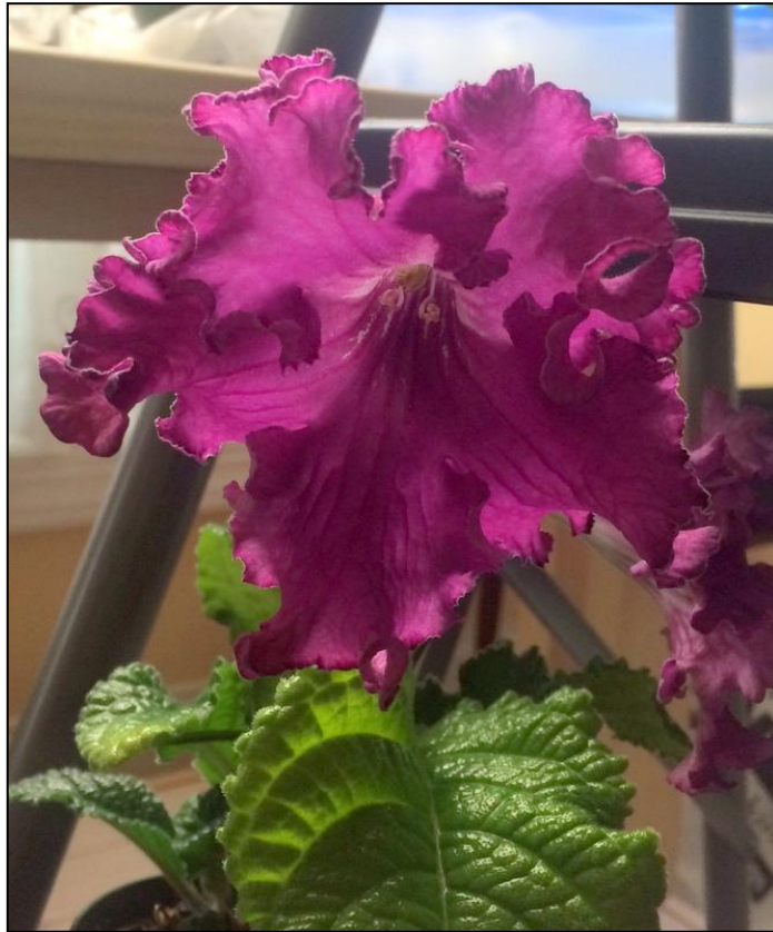
Brian's Streptocarpus 'DS Margarita'