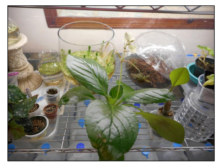
Another view of Primulina 'Dreamtime' on plant shelf with various assorted goodies! Notice it is in a tiny pot and I have not dared to repot!!! I think overwatering Primulinas may be my issue. I had hesitated to grow 'Dreamtime' as I heard it grows so large, but it is a nice size and still blooming!