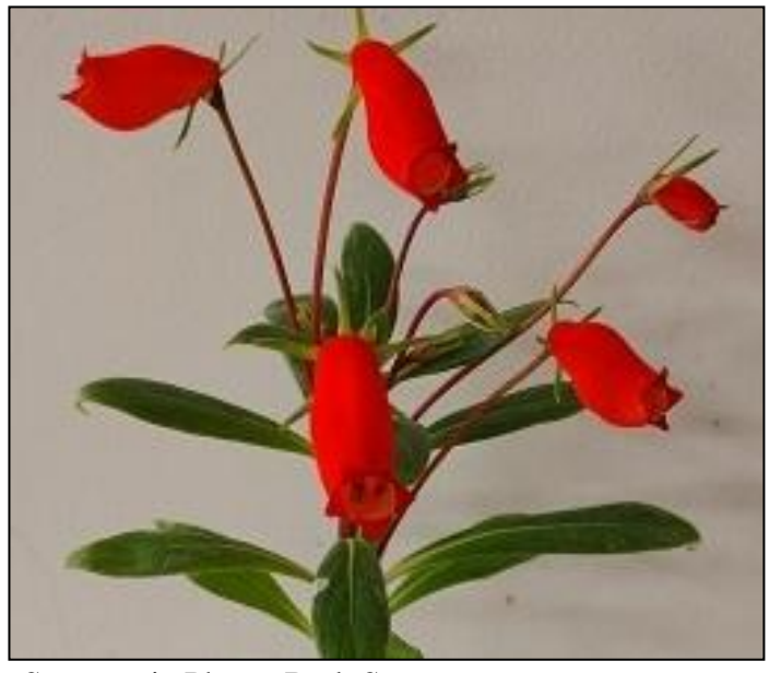
Seemannia