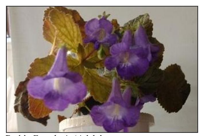
Barb's Eucodonia 'Adele'