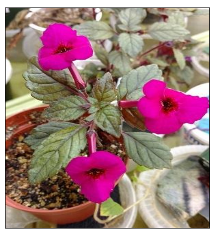
Barb's Achimenes 'Red Elf'