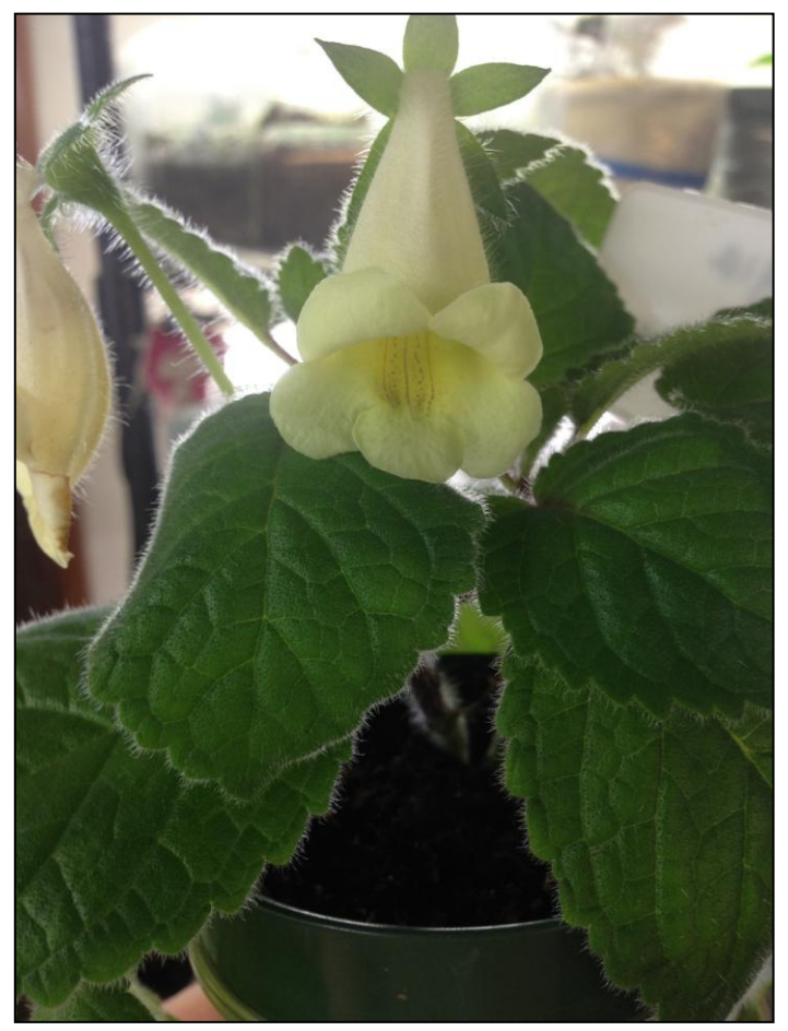
Donna's Sinningia conspicua blooming again