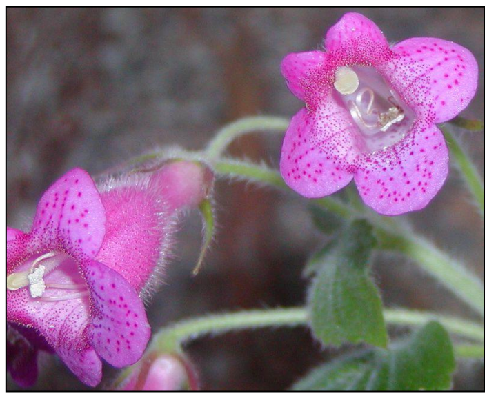
Seemannia gymnostoma