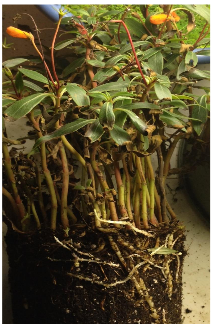
The most widely grown of this group is S. sylvatica , which has also contributed to a number of hybrids. This is a variable species which can result in subtle differences in plants. All members of Seemannia have rhizomatous storage structures at the root, and typically die back seasonally, usually in

The species in the genus Seemannia were formerly placed in Gloxinia until a revision of the group in 2005. The revision resulted in a number of other changes to the rhizomatous Gesneriads , in addition to the transfer of these species to Seemannia . Seemannia is comprised of four species with primarily red or reddish tubular flowers. While similarities in appearance do not always indicate close relatedness, genetic analysis in this instance suggests that the morphological similarities do in fact reflect underlying relatedness. Seemannia is primarily an Andean genus, distributed through Bolivia, northern Argentina and southern Peru. S. sylvatica is known as far north as southern Ecuador.