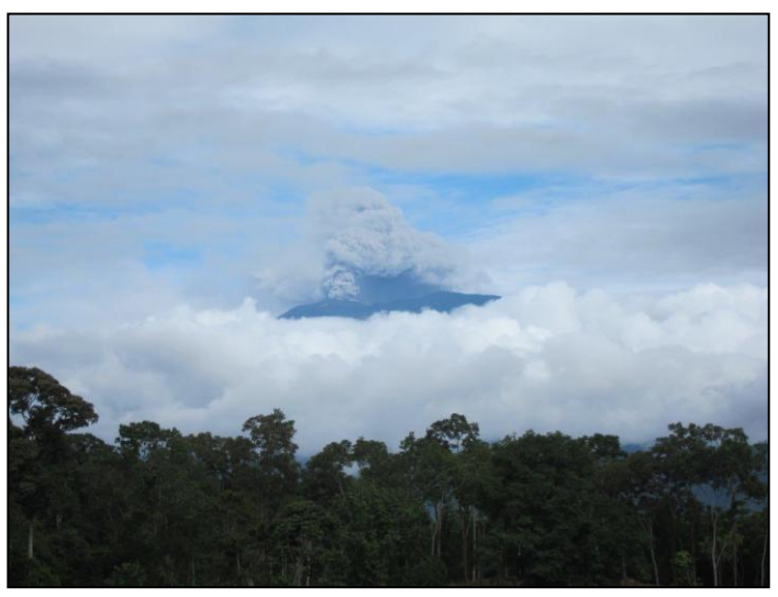
Another amazing cloud formation in Costa Rica

rainforest at La Selva Biological Research Station to the cloud forest of the Montverde Biological Reserve. Most of the gesneriads [and begonias] we saw were in the mid-level forests or in the gardens around the lodges where we stayed. In the forests, many were several yards off the trail, down or up a hill or up a tree, and not clearly seen or easily photographed with my point and shoot camera. If I had had better jungle vision, I would probably have seen many more.