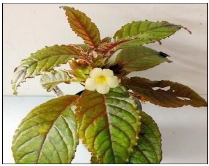
Barb's Nautilocalyx forgetii