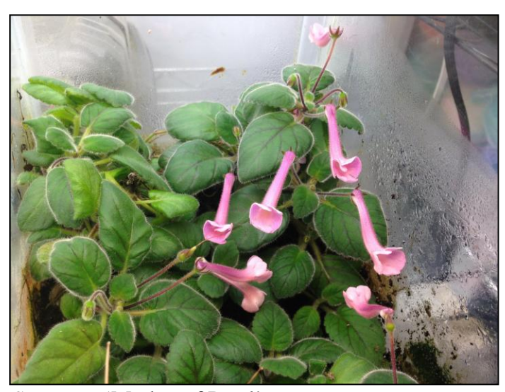
Sinningia 'Mother of Pearl'