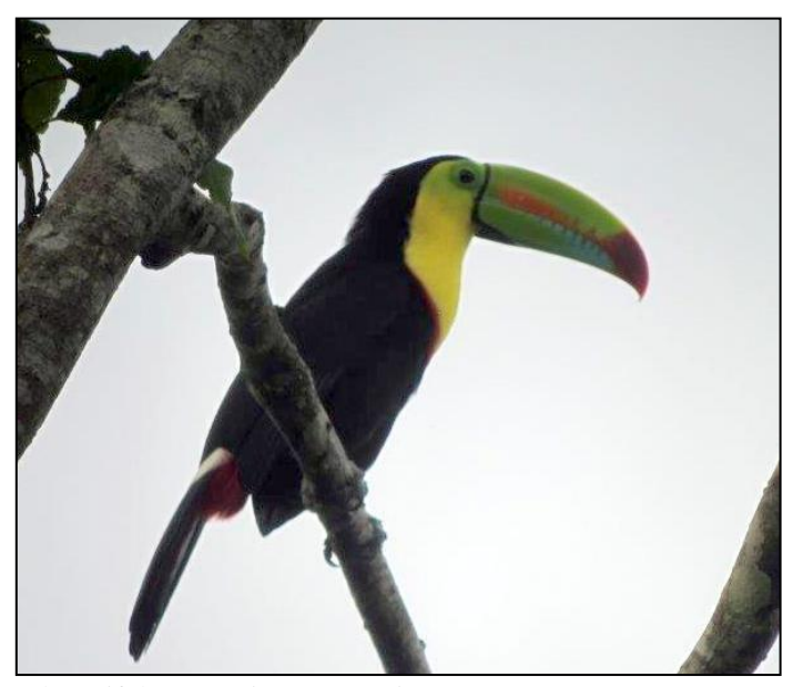
A beautiful Toucan in a Costa Rican tree

Our second trip to Costa Rica centered on animals.