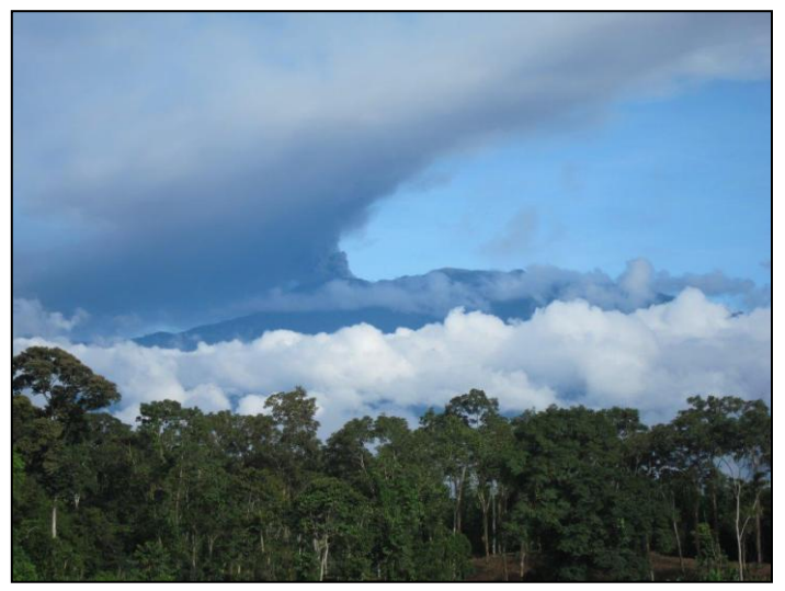
Beautiful skies of Costa Rica

In the last few years, my husband and I have traveled to Costa Rica twice. One trip was with a group of gardeners and it focused on visits to gardens and tropical rainforests from the lowland tropical