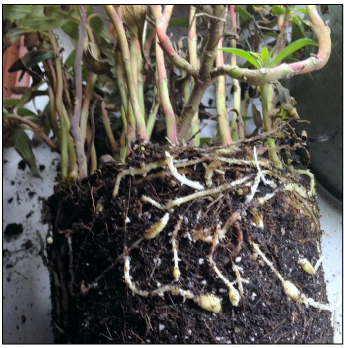
Seemannia roots and rhizomes