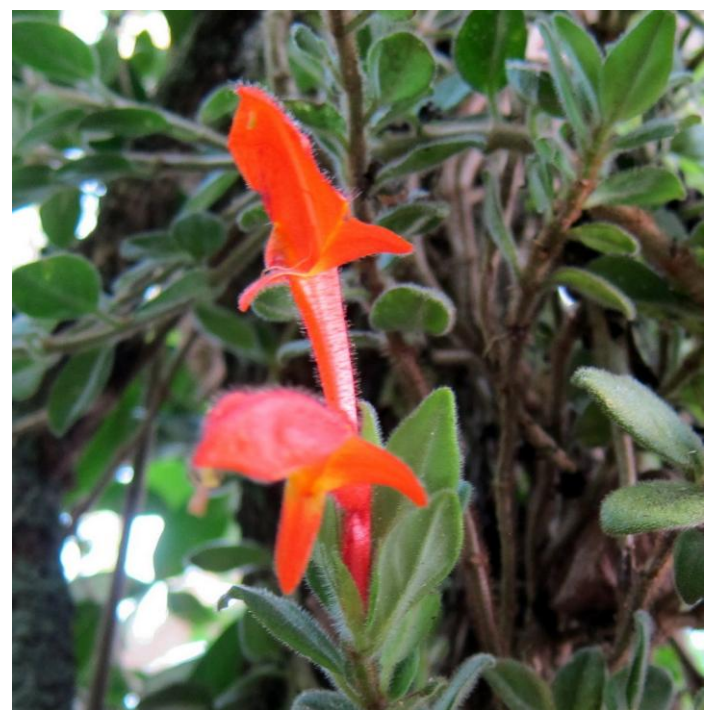
Columneas in Costa Rica