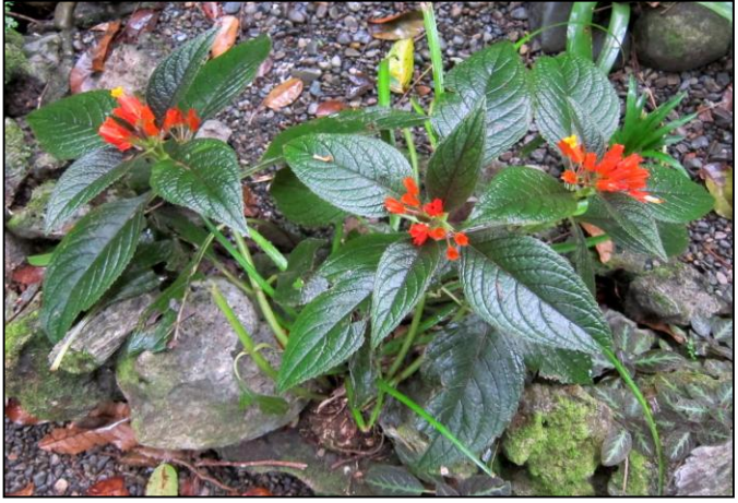
What looks like a variety of Chrysothemis in Costa Rica

I was surprised that we saw so few, but we walked along trails that overlooked streams or waterfalls, but did not get on the banks of or in the streams or off any of the trails. Also, I am fairly new to Gesneriad growing, and might not recognize the unusual and less frequently grown gesneriads. I wish I had