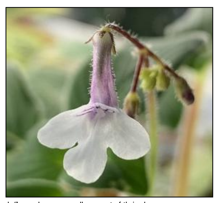
Donna's Streptocarpus pallidoflorus from Mauro Peixoto's seed. "I may have a small amount of thrip damage on my leaves. I am still working to rid my plants of these invaders. Could be watering damage, but my instinct is there are still a few thrips lingering around. Spraying with Bonide's Captain Jack's Dead Bug Brew. I still have not transplanted this little one and so it is still growing in the seed propagation container."

"The subgenus Streptocarpella consists of a large number of species which can be subdivided into the African and the Madagascan species. The African species are found primarily in Tanzania, Kenya, and in a few other locations in Central and West Africa. S. Pallidoflorus is an attractive species of Streptocarpus , subg. Streptocarpella , and can be grown in greenhouse beds to spectacular effect. It is one of the rare subg. Streptocarpella species to have been used in hybridizing, and is a parent with S. caulescens of the hybrid 'Epupa Falls'. The species is variable in color, and there are blue forms." <a href="https://gesneriads.info/gesneriad-genera/streptocarpella/">https://gesneriads.info/gesneriad-genera/streptocarpella/</a>