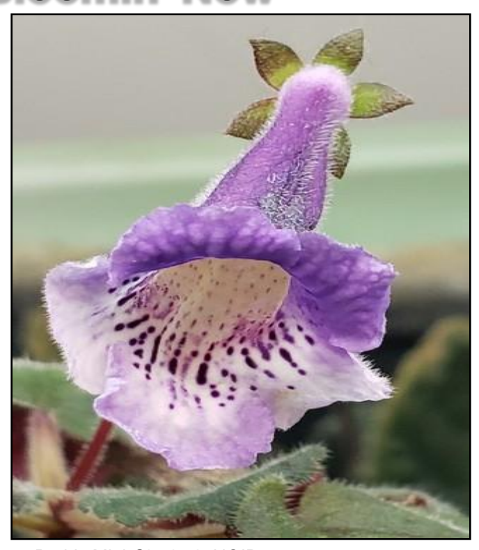
Barb's Mini Sinningia NOID