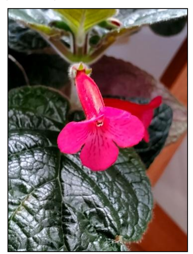
Brenda's Sinningia conspicua x bullata blooming