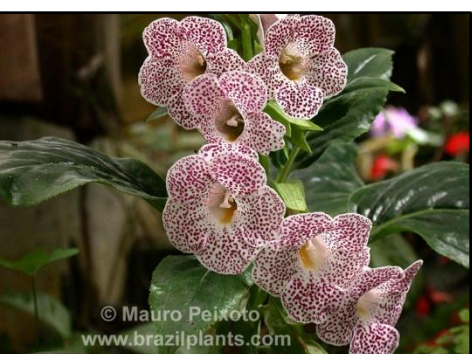
Sinningia guttata is called such because of it's spotting (gutta = spot, drop or speck). Plants can bloom even when they are relatively small. Some clones are reported to be fragrant. Easily grown from seed.