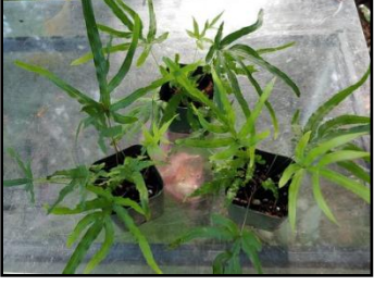
Begonia eleagnifolia, Nematanthus 'Cheerio',