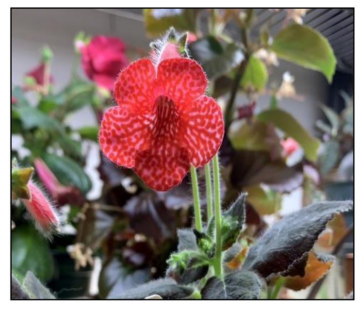
Donna's Kohleria 'Strawberry Fields'