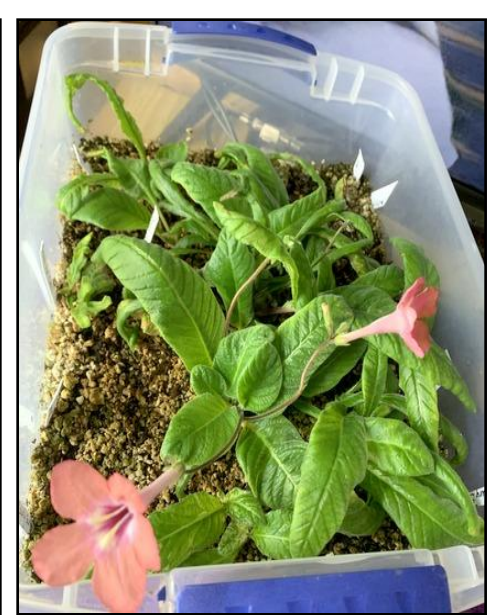
Donna's Streptocarpus 'Salmon Sunset' grown via cutting from Terry Vincenzi purchased spring 2020 before Covid. "At least I have some success before transplanting on to pots. Many other varieties of Strep young plants coming into bloom. Lots to share."