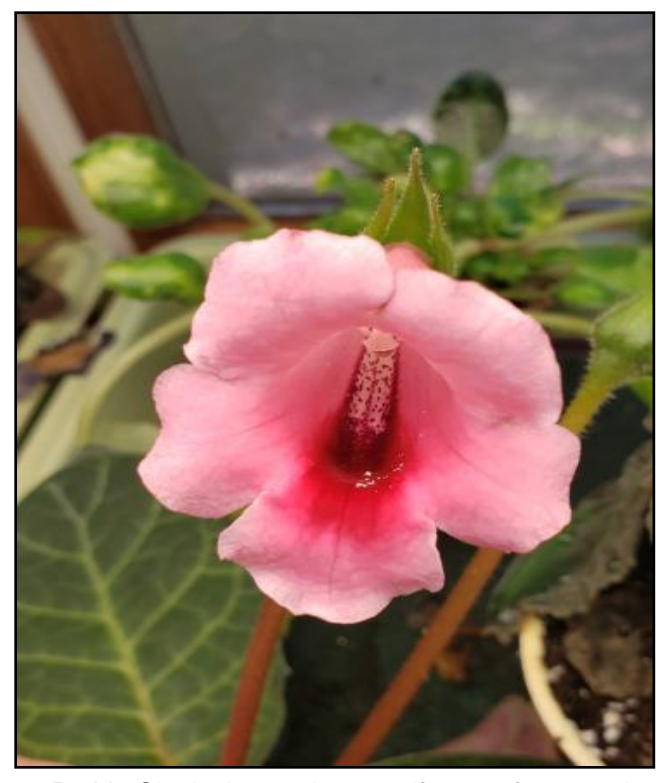
Barb's Sinningia speciosa x self grown from seed