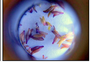
Johanna's Titanotrichum oldhamii: "Titanotrichum oldhamii propagules forming on the end of an inflorescence. Usually the propagules have formed on a separate stem, but this year they formed above the dying blossoms. I was looking at them to see if they looked as if I gave them enough time to ripen. I still don't know, but they are interesting looking.