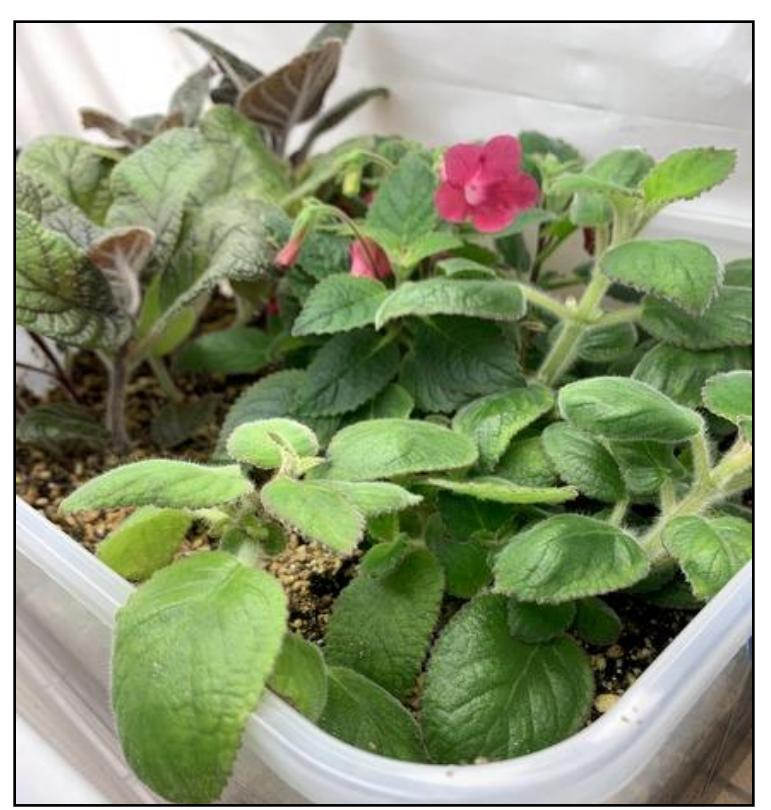
Donna's prop box with Sinningia 'Prudence Risley' blooming. Plant in front is Chrysothemis adenosiphon .