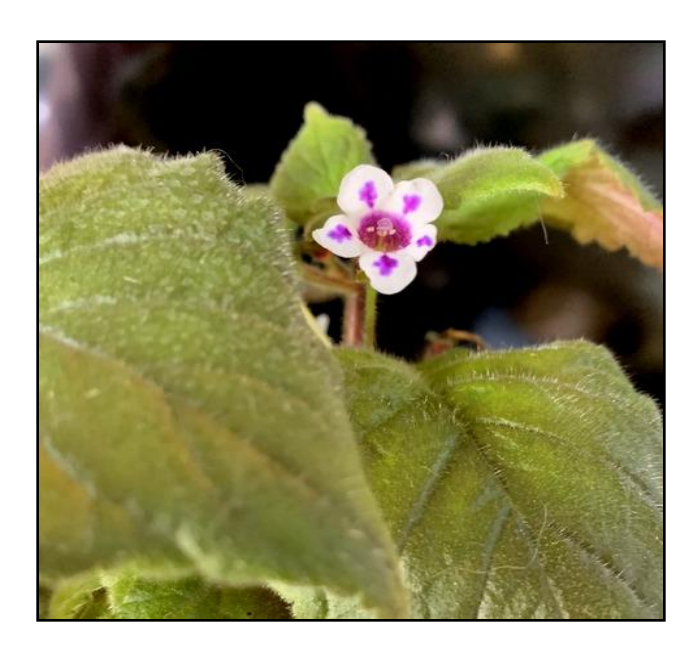
Donna's Diastema vexans . "Diastema vexans is a low-growing herbaceous plant with pretty white and lavender flowers and softly hair leaves. It needs fairly warm temperatures and good humidity to thrive, but prefers lower light levels." <a href="https://gesneriads.info/gesneriad-genera/diastema/">https://gesneriads.info/gesneriad-genera/diastema/</a>