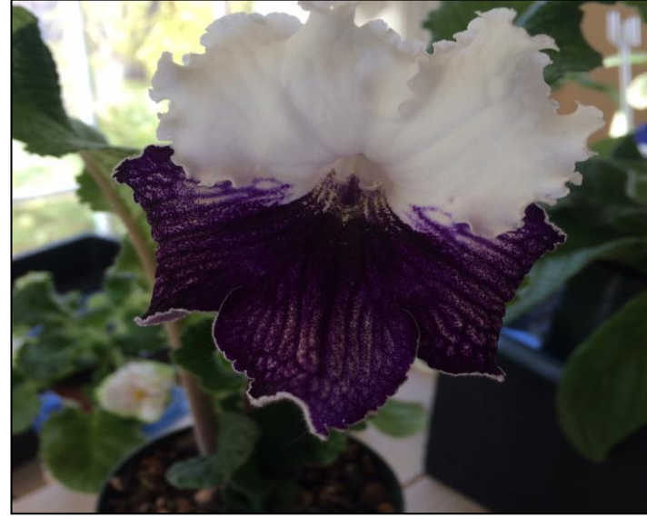
Brian's Streptocarpus 'Lolita'