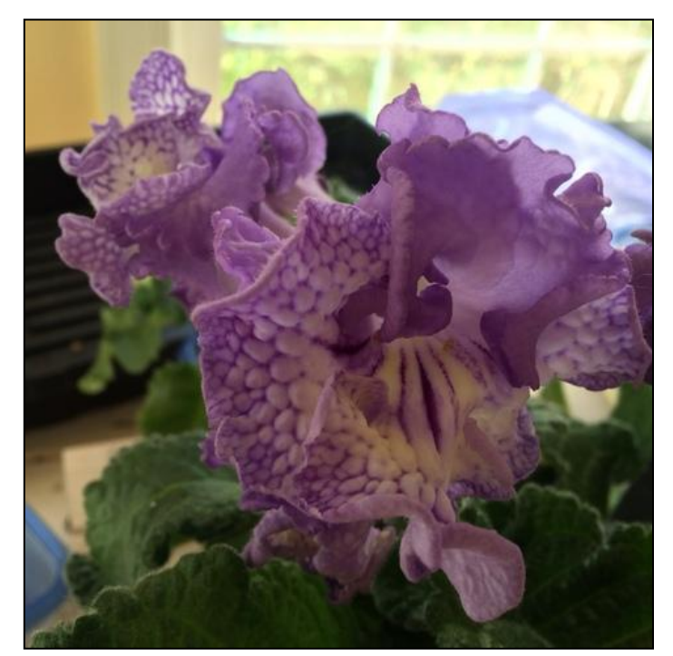
Brian's Streptocarpus 'DS Waterfall'