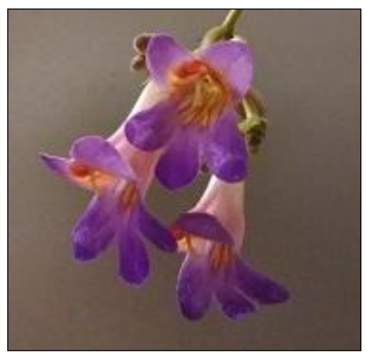
Barb's Primulina 'Souvenir'