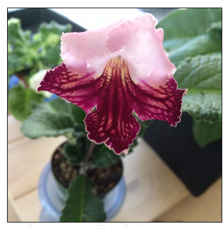
Brian's Streptocarpus 'Telma' (Piotr K)