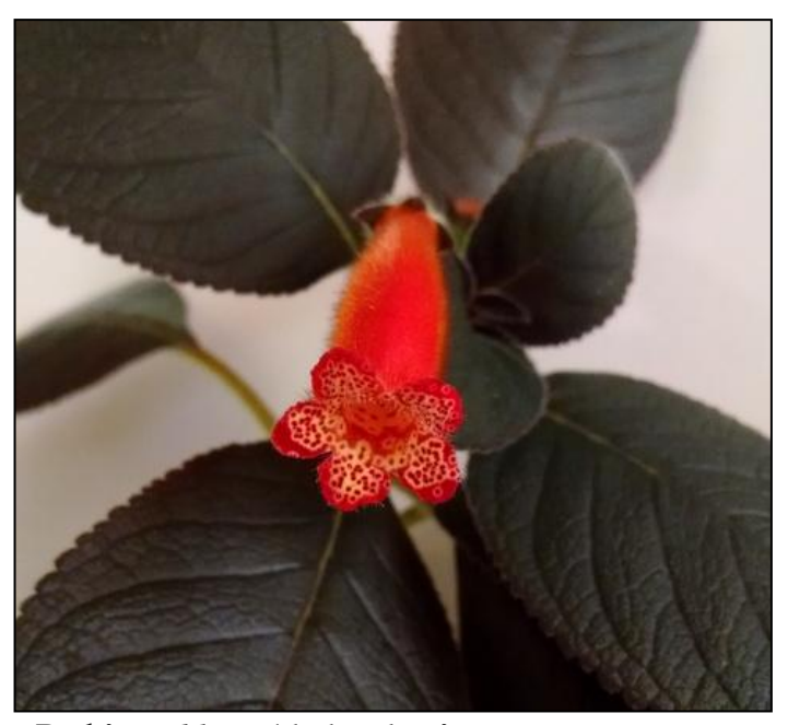
Barb's Kohleria 'dark velvet'