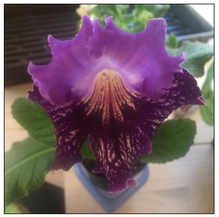
Brian's Streptocarpus 'Rondo' (Piotr K)