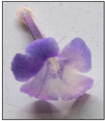
Is so cute in its little container! And Sinningia muscicola was giving a fabulous display for the winter months! After the meeting Johanna went home and potted up all the baby plants and cuttings from the meeting! See the following three pictures.