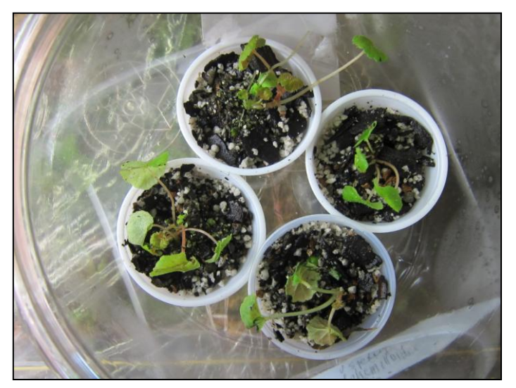
Baby Begonia alchemilloides potted up