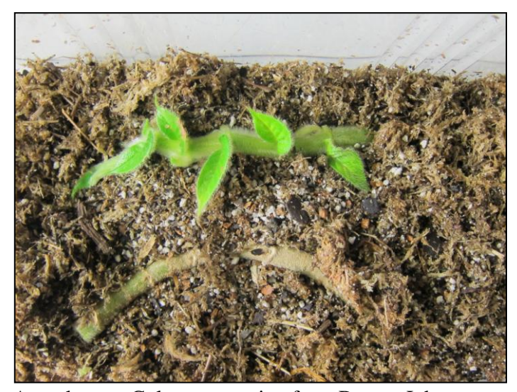
An unknown Columnea cutting from Barry. Johanna planted the naked stem after scraping off a bit of the thickened outer layer of the stem around the nodes, and putting the scraped side down as Drew had instructed to do with "hairy" stems.