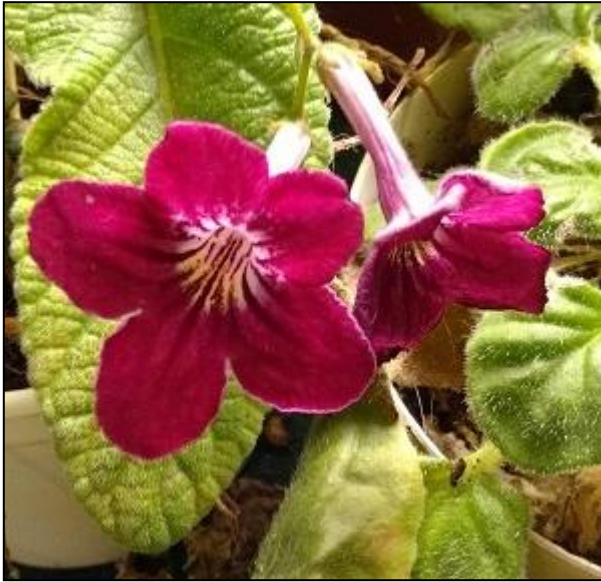
Barb's Streptocarpus 'Miss Mabel'