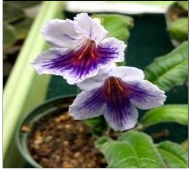
Barb's Streptocarpus 'Nery'