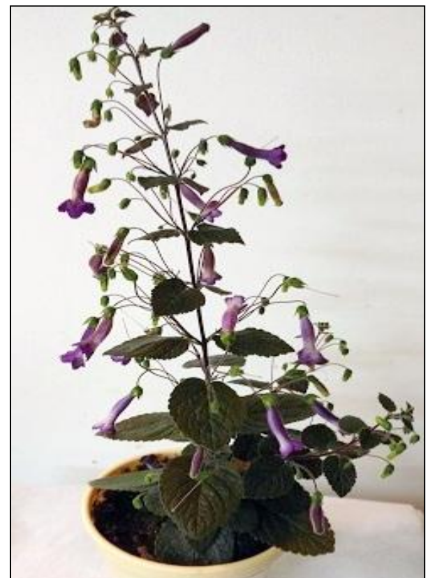
Barb's Sinningia 'Deep Purple Dreaming'