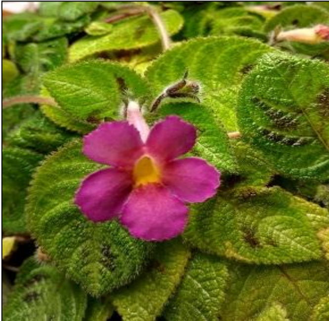
Barb's Episcia 'Harmony's Slinky Pink'