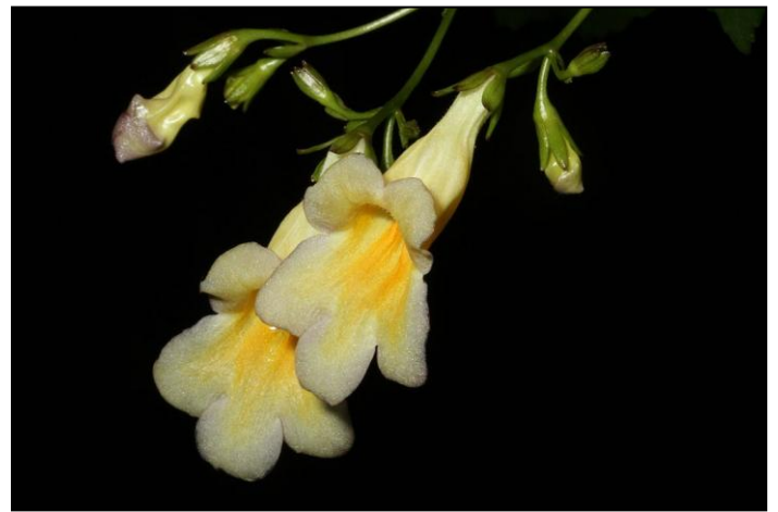
Lysionotus "Pudding", grown and exhibited by Bill Price at the 2012 convention in Seattle.

Lysionotus is a rhizomatous plant from Southeast Asia. It is an epiphyte which grows on trees in the forests, on moss covered rocks along streams, or in valleys. It has been used in traditional Chinese medicine to treat various diseases. Lysionotus grow in habitat similar to Petrocosmea and can tolerate