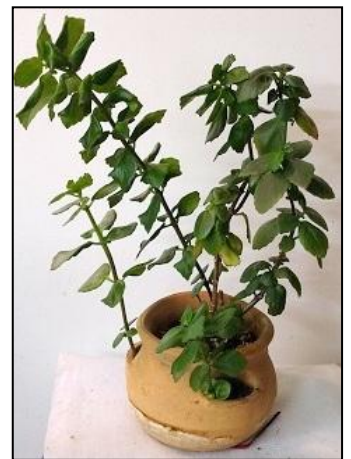
L. pauciflorus 'Ikada'

cultivar to have yellow flowers. I have not seen either of my plants bloom, but they should bloom in late summer and fall. I am growing L. "Ikada" in a clay strawberry jar planter which gives it room to expand its rhizomes and produce shoots that grow out of the side pockets. It is grown on my light stand on matting which frequently dries out, so it probably does not get the consistent moist soil it would like. However, it seems to take my culture fairly well. L. "Pudding" is a newer plant for me which grows in a clay pot on a wicking tub. It is not under fluorescent lights, but grown in front of a window. Neither of these plants has ever gone dormant for me. Lysionotus are not attractive plants to grow for ornamental foliage, so I