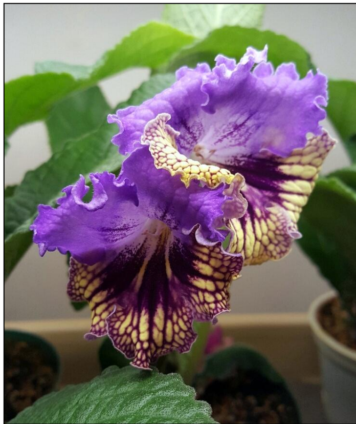
Kitty's Streptocarpus 'Kahinta'