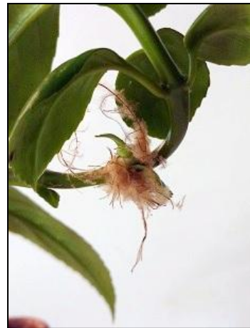
L. 'Pudding' aerial roots

cooler temperatures than other Gesneriads . If grown outdoors, they are hardy in zones 6a-9b with some varieties able to withstand temperatures below 0 F. They prefer to be grown in consistently moist soil. I am currently growing 2 varieties: Lysionotus pauciflorus "Ikada" and Lysionotus "Pudding". While most Lysionotus have flowers in various shades of lavender to white, L. "Pudding" is the first