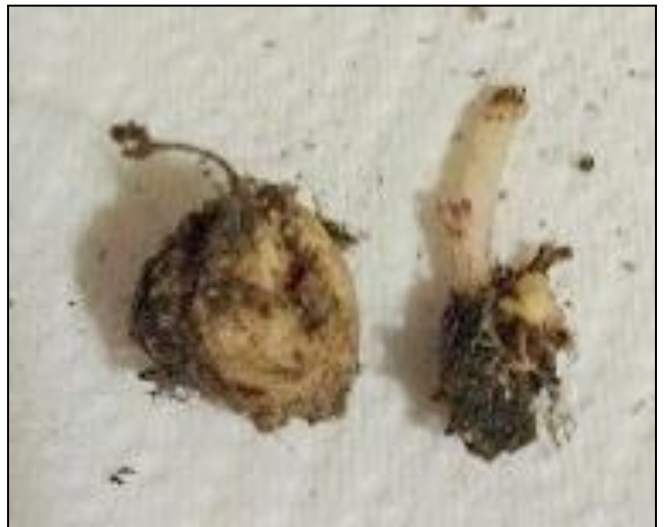
Close up of Nautilocalyx lynchii tubers