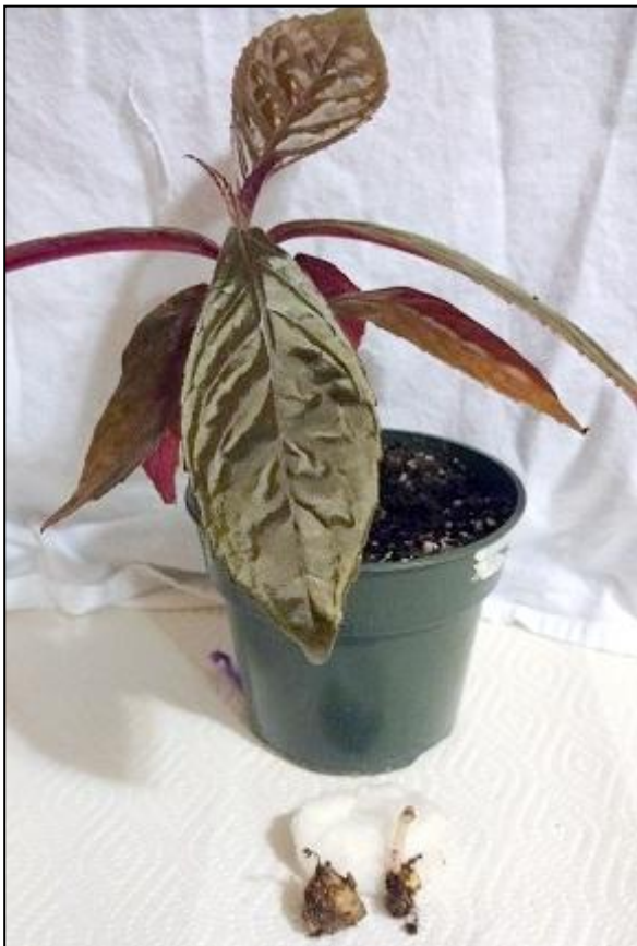
Barb's Nautilocalyx lynchii