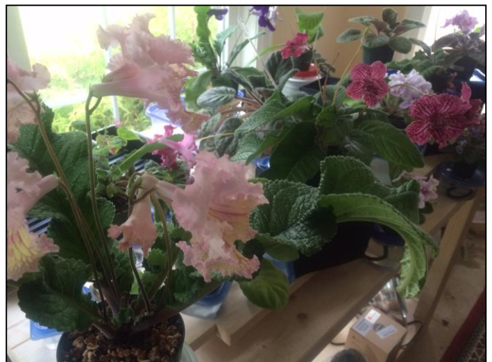
Brian Connor's windowsill full of Streps & AV's