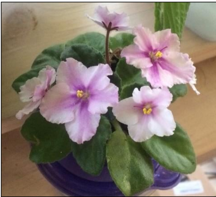
Brian's Saintpaulia 'Ness Mini- Sota'