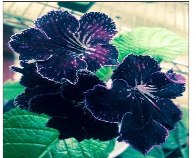
Brian's Streptocarpus 'Bonnaventure'