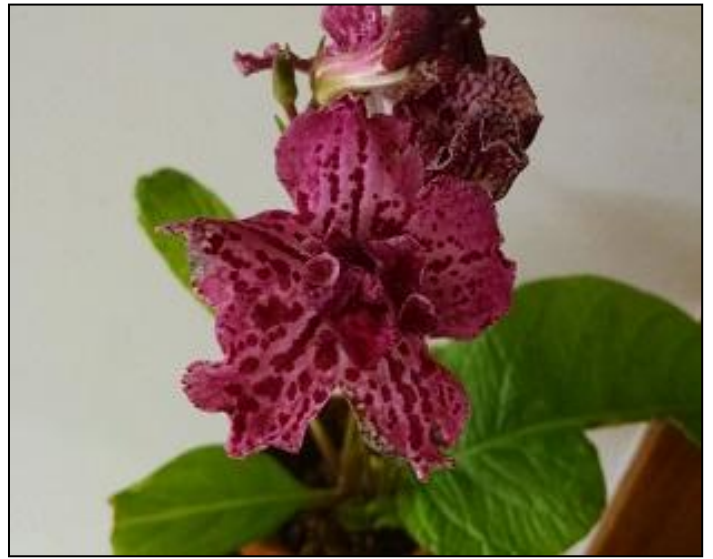
Barb's Streptocarpus 'Hawaiian Party'