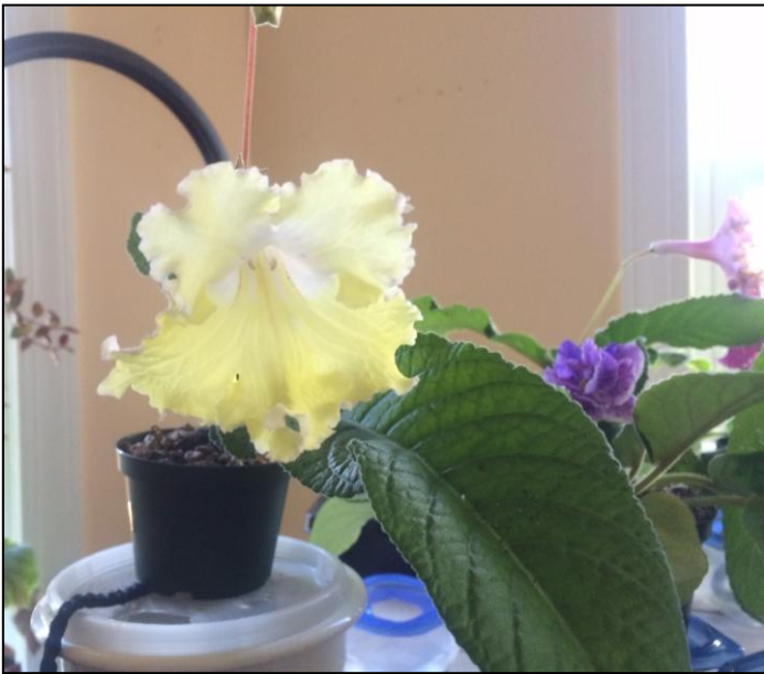
Brian's Streptocarpus 'Zlotko'