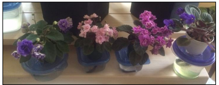
Brian's series of miniature Saintpaulias