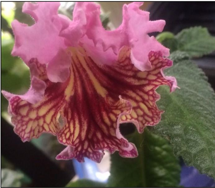
Brian's Streptocarpus 'Drako'