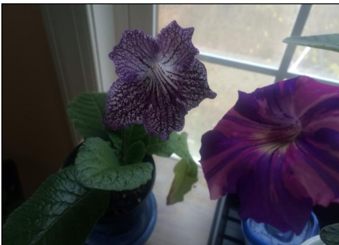
Brian's Streptocarpus 'Ronduls Kacey' & 'Byzantine Mosaic'