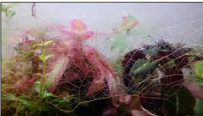
Barb's terrarium, interesting root formations