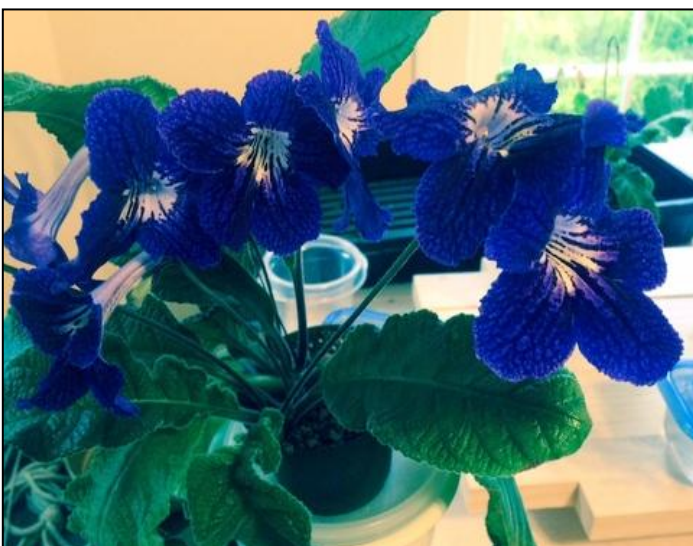
Brian's Streptocarpus 'CF-Diane'