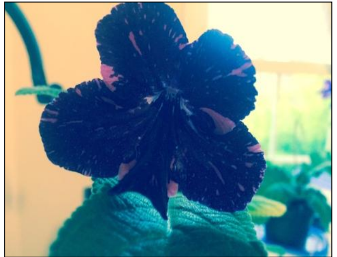
Brian's Streptocarpus 'DS-Furry Little Arctic Fox'