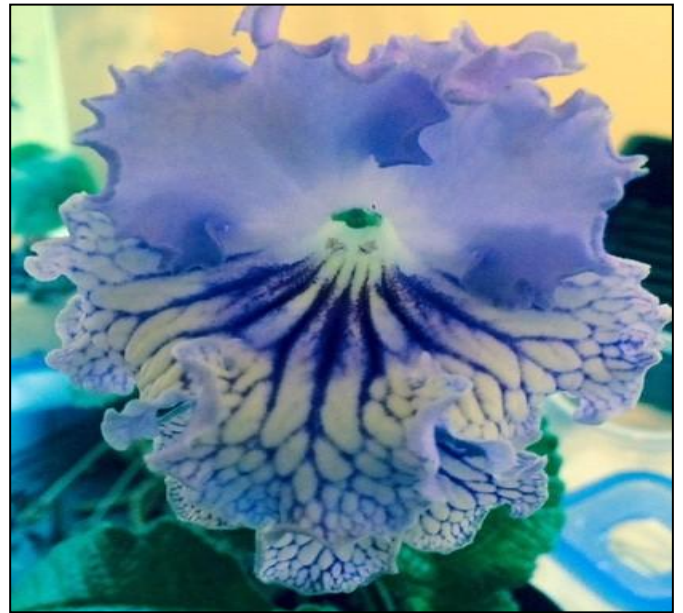
Brian's Streptocarpus 'DS-Crystal Lace'