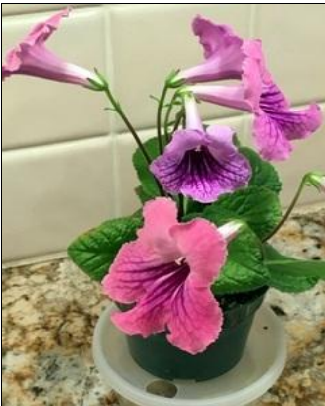
Janet's best multicolor Streptocarpus 'DS Mysticism'