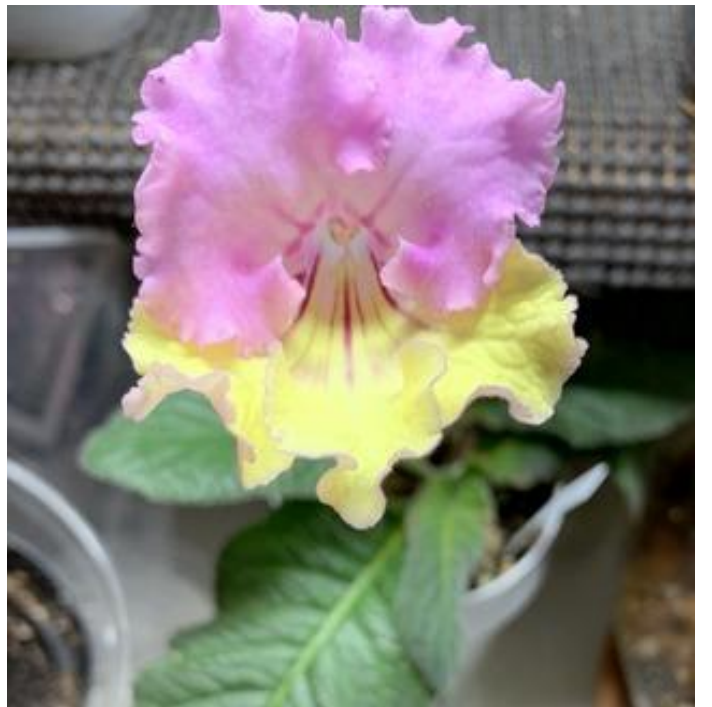
Donna's Streptocarpus 'NOID' from Otto's seeds