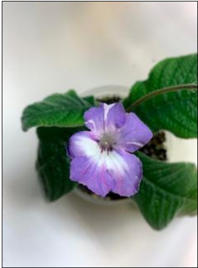
Doug's Streptocarpus 'Party Boy' from raffle table