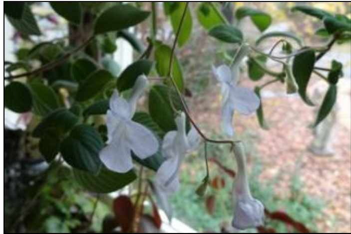
Bill's Streptocarpus saxorum