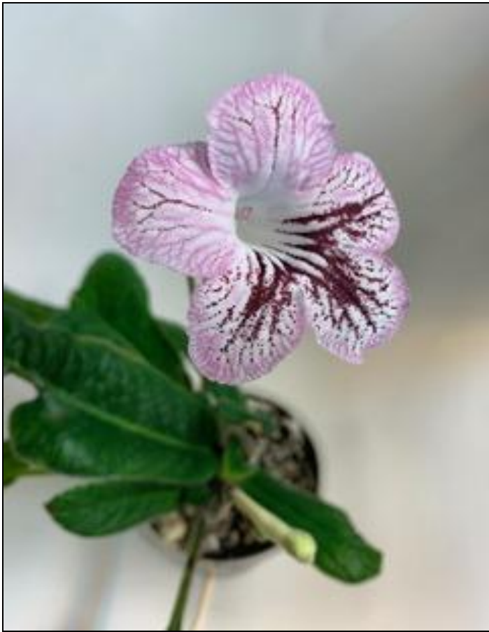
Doug's Streptocarpus Franken BBS seedling