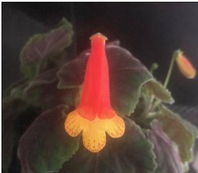
Brian Connor's Smithiantha 'Little One' close up