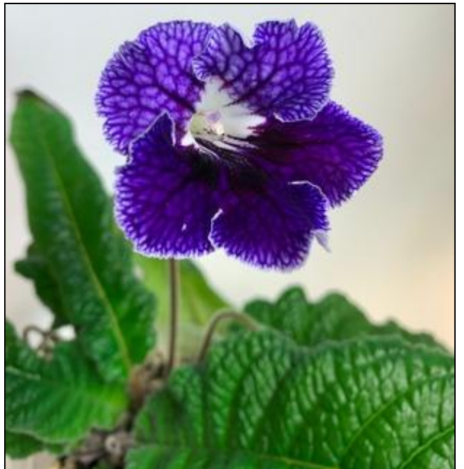
Doug's Streptocarpus 'Nightshade' from raffle table