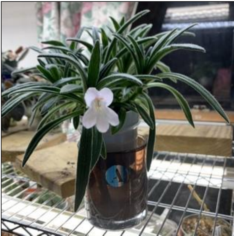
Donna's Primulina ophiopogoides x longgangensis : first bloom