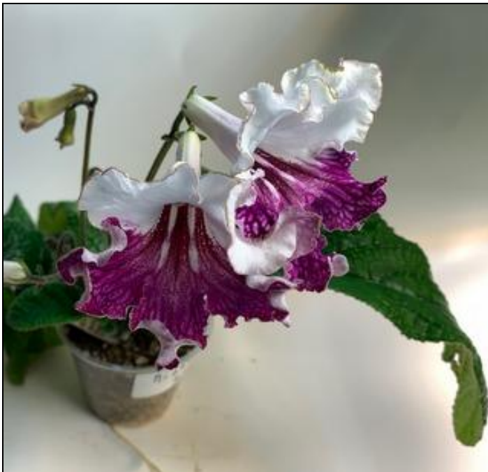
Doug's Streptocarpus 'Niobe'