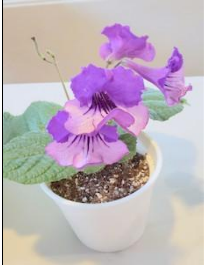
Barb Koski's Streptocarpus 'DS Musketeer' at RAVS meeting