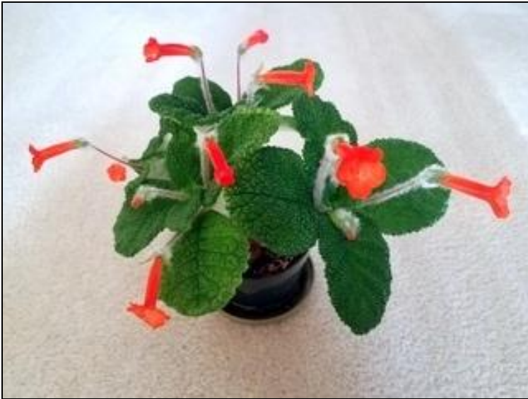
Peggy's Sinningia bullata blooming in perfect symmetry.