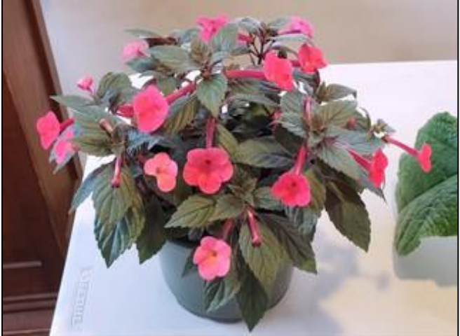
Bill's Achimenes 'Glory' at RAVS meeting