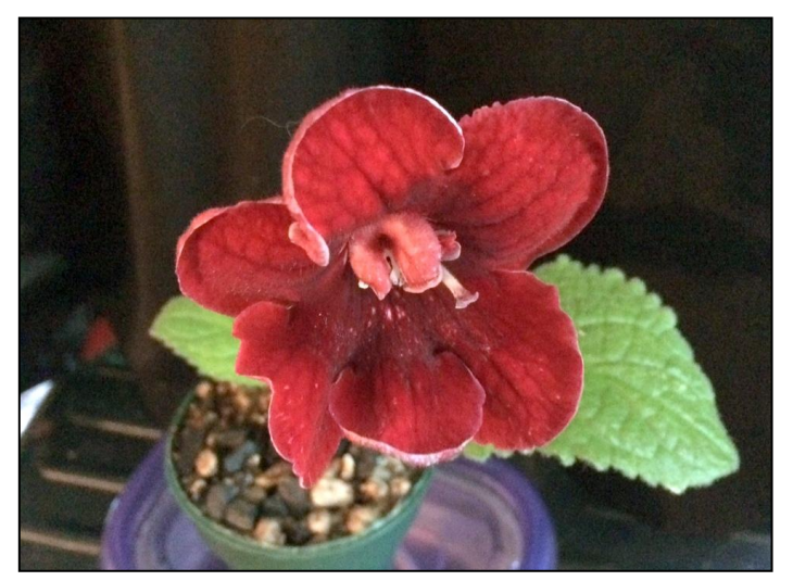
Brian's Streptocarpus 'DS 1472'