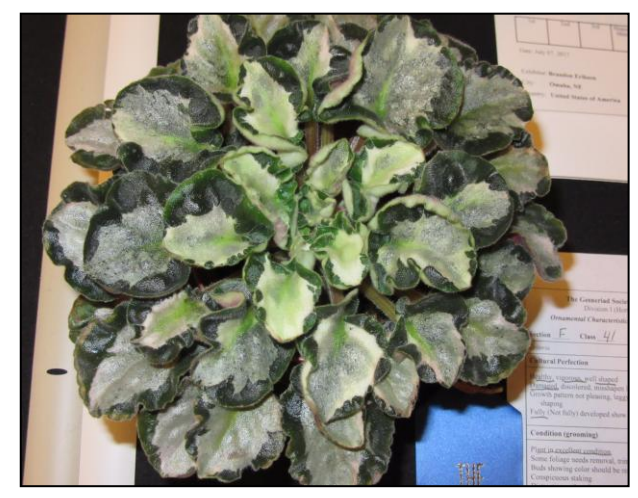
Saintpaulia 'Harmony's Little Stinker' won the blue for ornamental value African Old World