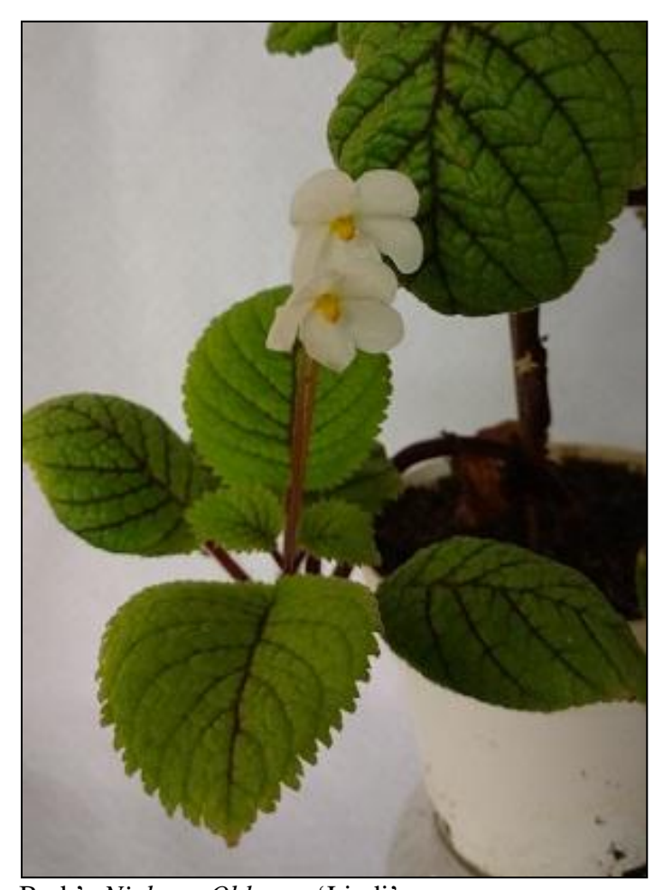
Barb's Niphaea Oblonga 'Lindi'