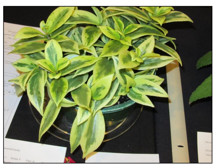
Bill Price's Aeschynanthus species 'Thailand'