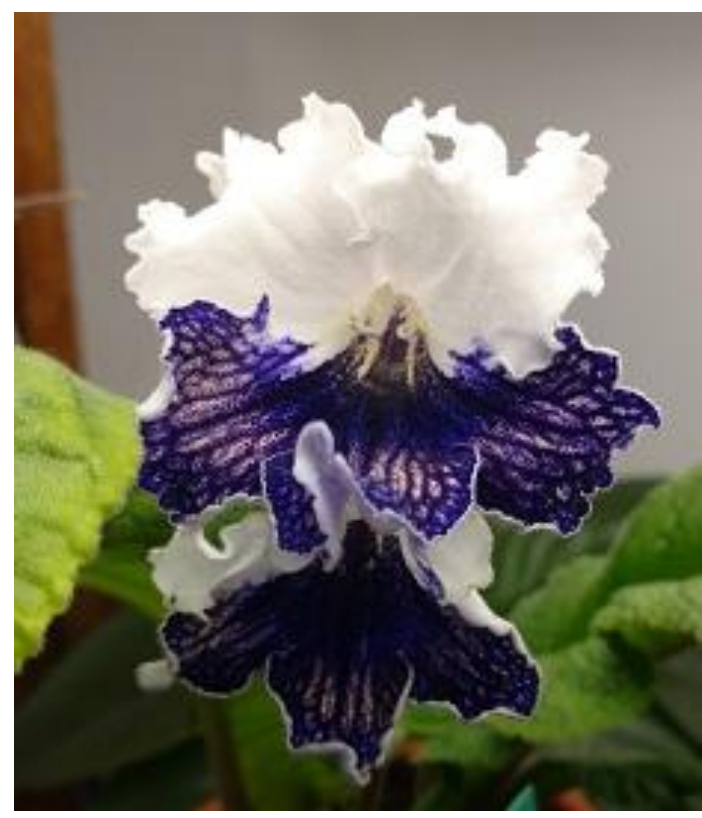
Barb's Streptocarpus 'Lolita'