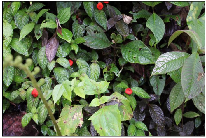
Pearcea bella: according to Jeremy this species has never been reported in Ecuador. Both the bronze and green leaf forms covered the bank by the side of the road.