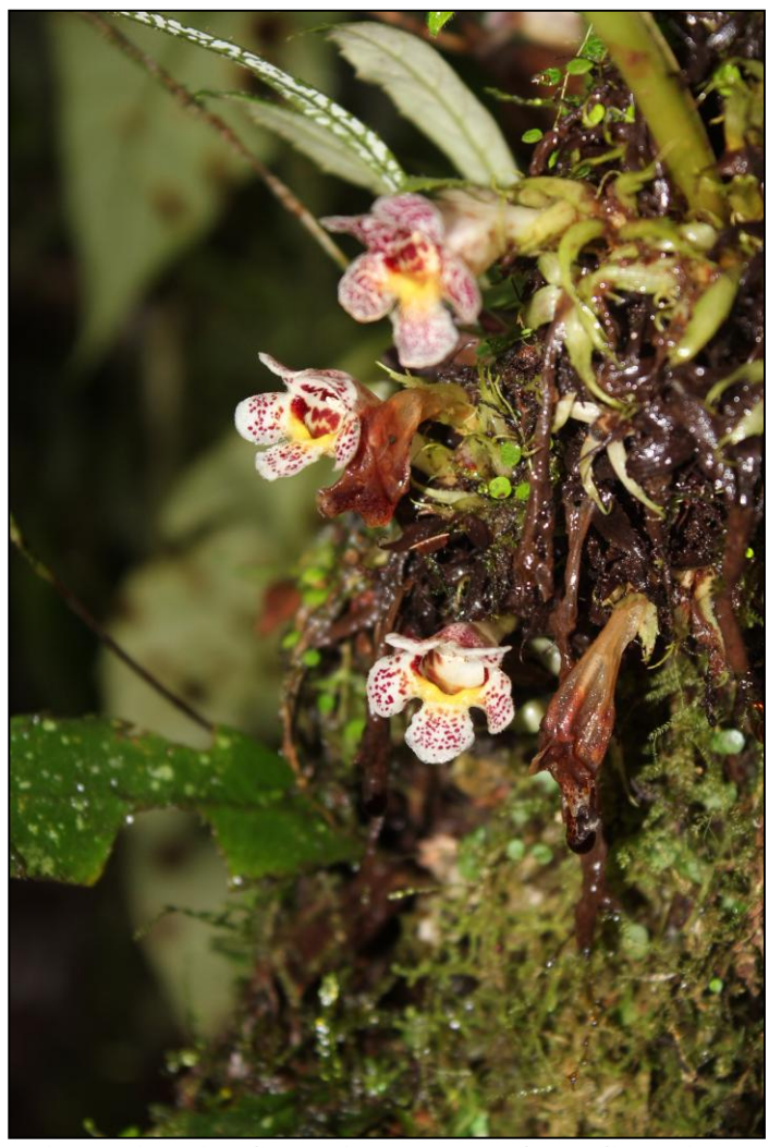
Always thought of Paradrymonia as a forest floor plant, but this one was growing happily on the side of a fallen tree. Species name? No idea. But it's rooting at home now!