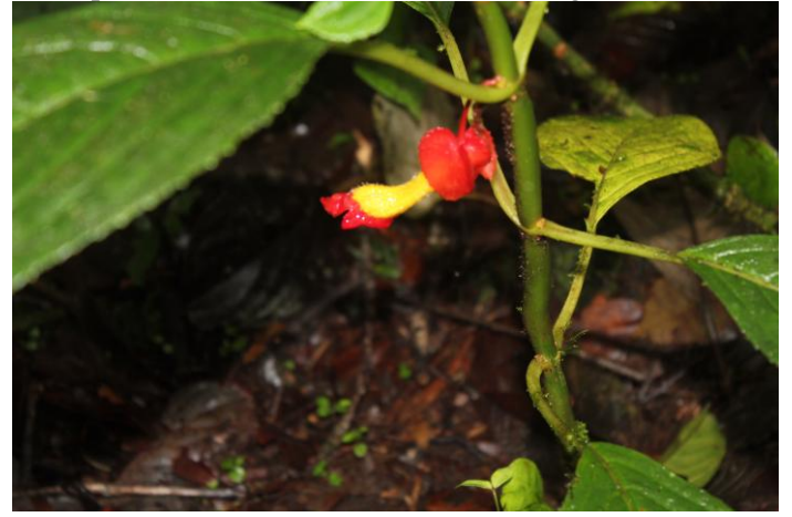
Glossoloma : Hard to miss a flower this bright in the darkness under the trees. No idea on the species name, but we collected it anyway.