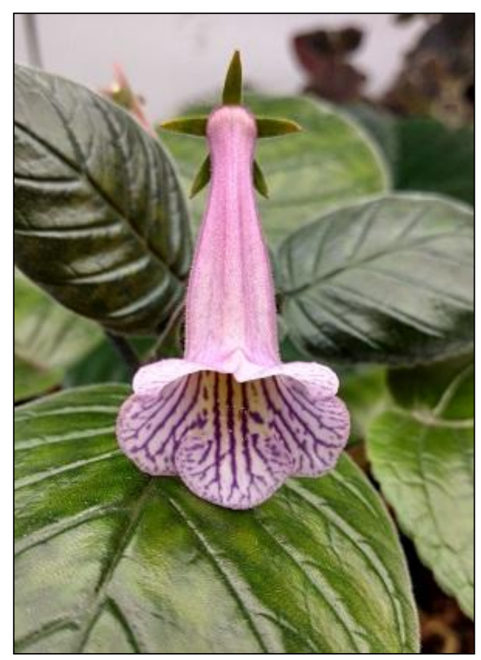
Barb's Sinningia 'Texas Zebra'