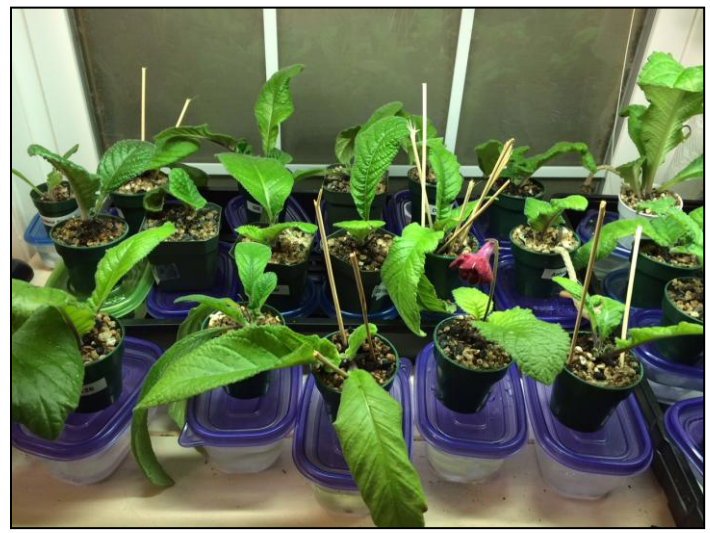
Brian's Strep' babies grown in a window with one T5 HO (high output) lamp to supplement.