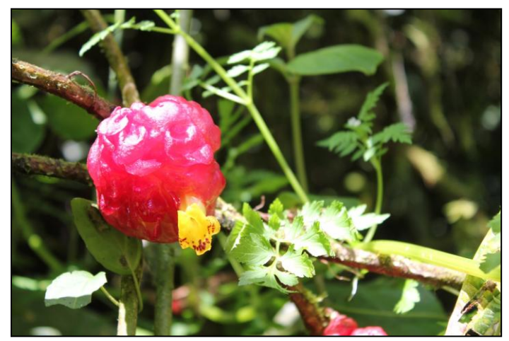
Saw lots of Drymonia in flower. This one has a very plump calyx, inside which are more buds, but never saw more than one flower open at a time. Wonder if I'll ever get our plant to flower!