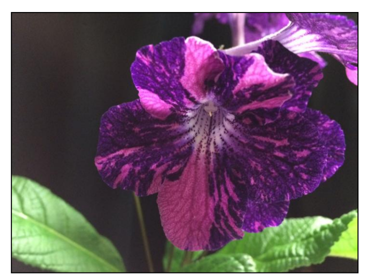
Brian's Streptocarpus 'DS Little Plushy Arctic Fox' (LPAF)