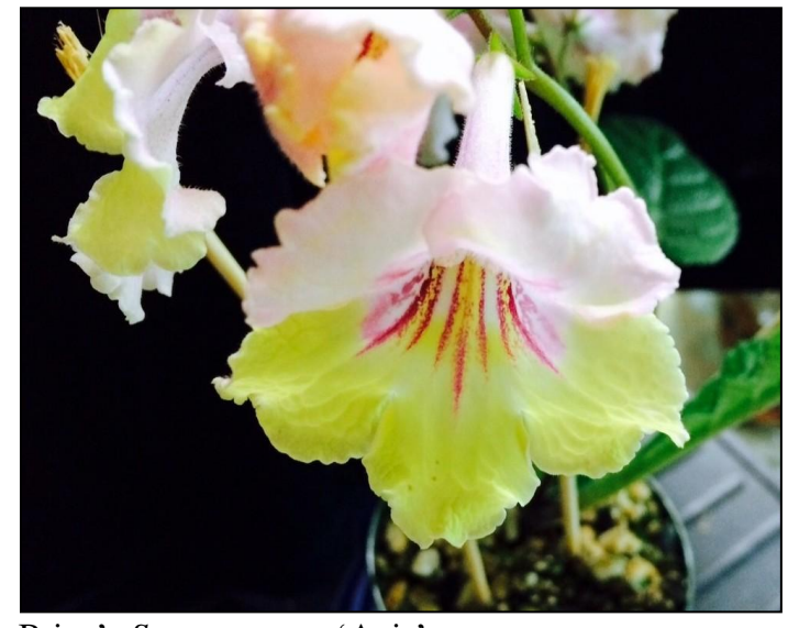
Brian's Streptocarpus 'Apis'