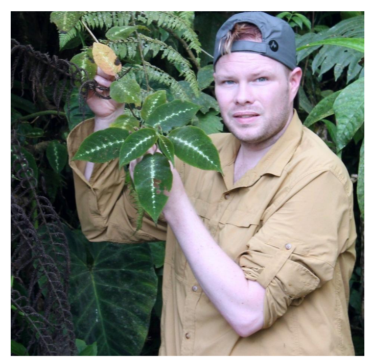
Drymonia variegate: May be hard to grow at home, but this species was found all over Ecuador with these huge leaves.