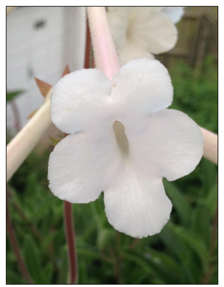
Donna's Sinningia tubiflora close-up