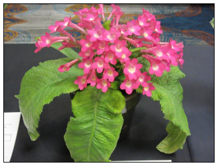
Dale Marten's new hybrid Streptocarpus 'Ring of Fire'