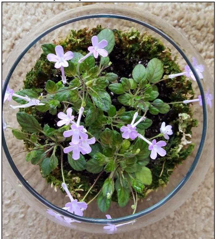
Kitty's Sinningia pusilla in glass container