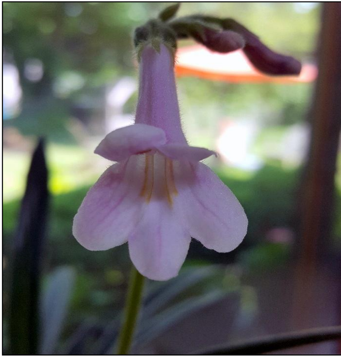
Kitty's Primulina linearifolia