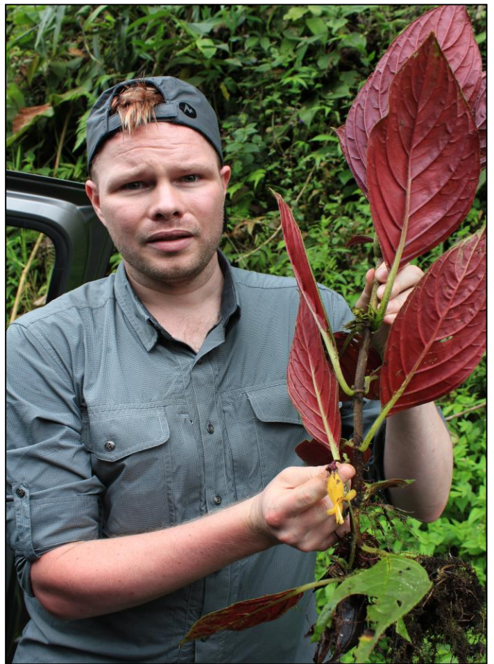
Columnnea leaves bigger than Drew!