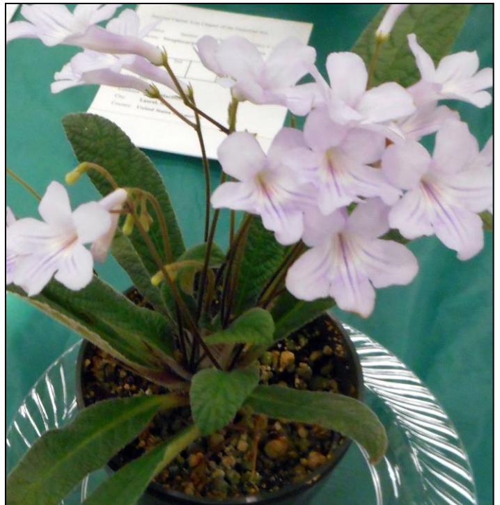
NCAC Show: Peggy's Streptocarpus 'Gator's Tail'