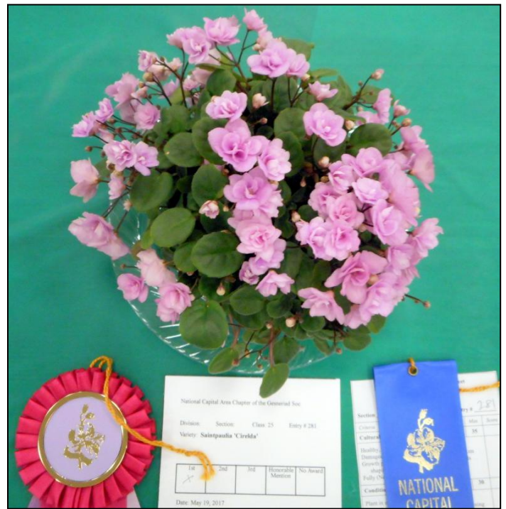
NCAC Show: Bill's Saintpaulia 'Cirelda' award winner!