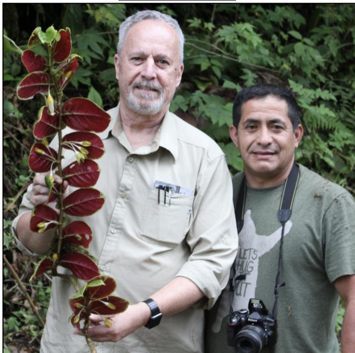
This Columnnea was growing 10 feet away from a Gasteranthus .