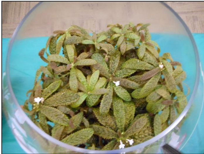
Nautilocalyx pemphidius close up. Any photo does not do it justice!