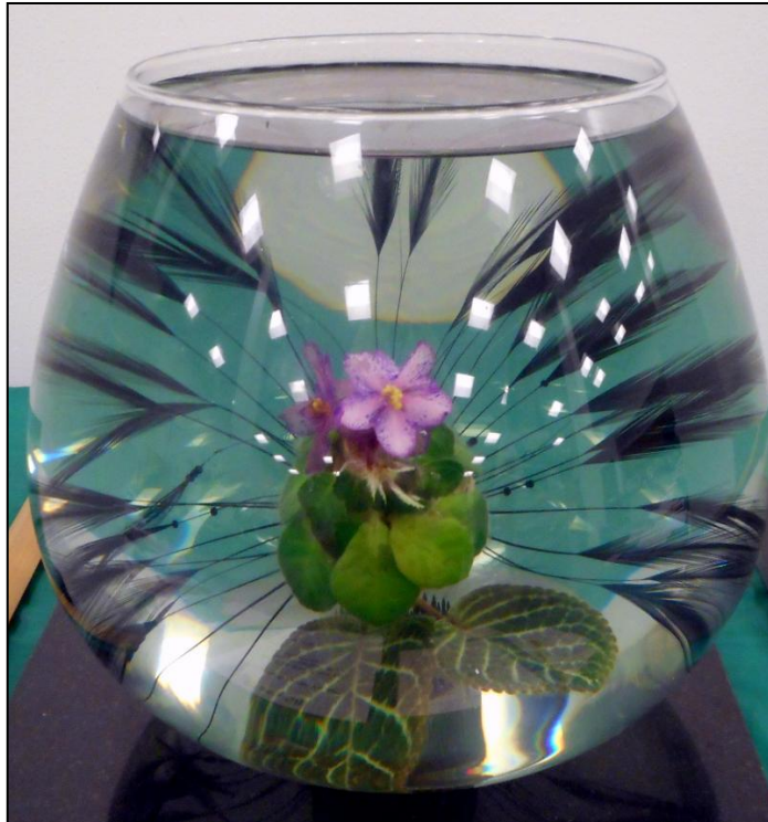
NCAC Show: Jim's exotic under water design "Chinese New Year in class 58. Photo does not show the outstanding beauty of the arrangement!