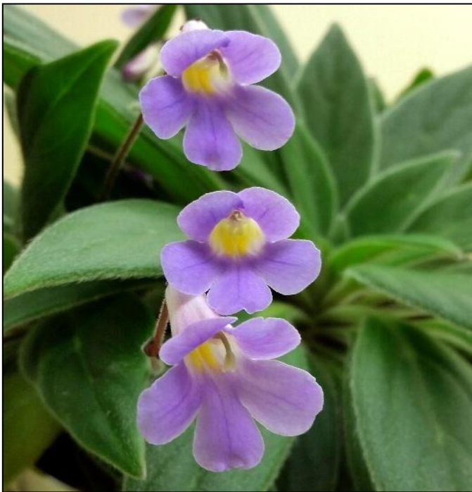
Sharon's Primulina USBRG 98-03