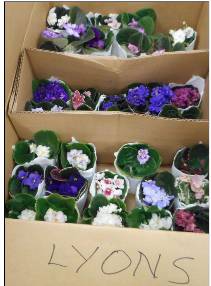
NCAC Show: Sale Plants shipping was perfection! Fancy Bloomers plants were outstanding with lots of unique varieties too. I did not take a pic of them. Very unfortunate!