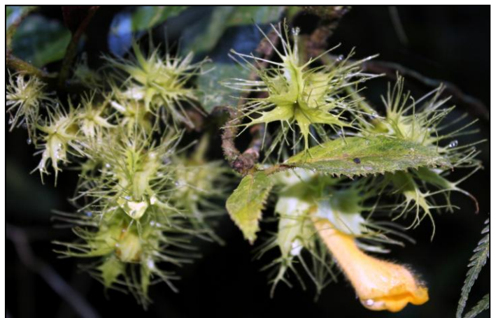
Glossoloma : this funny looking plant was growing right by the side of the road. The leaves are shiny and black.