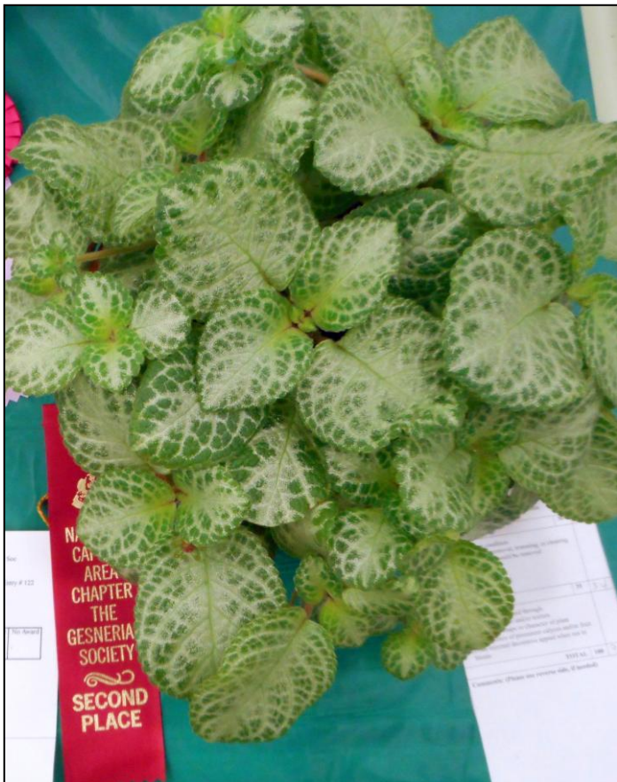
NCAC Show: Kitty's Episcia 'Faded Jade' before blooming