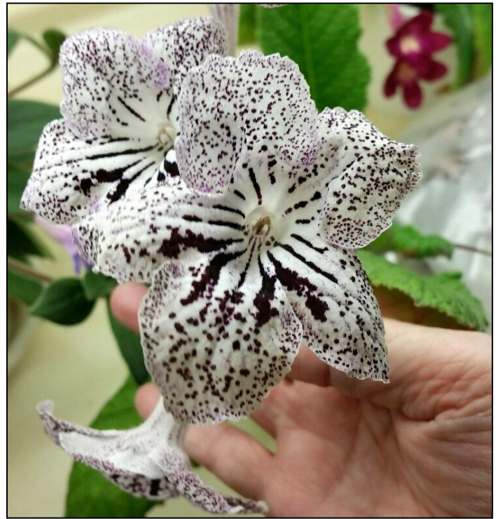
Sharon's Streptocarpus 'Franken Prunella'