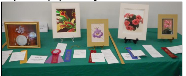
NCAC Show: Great display of photographic artwork!