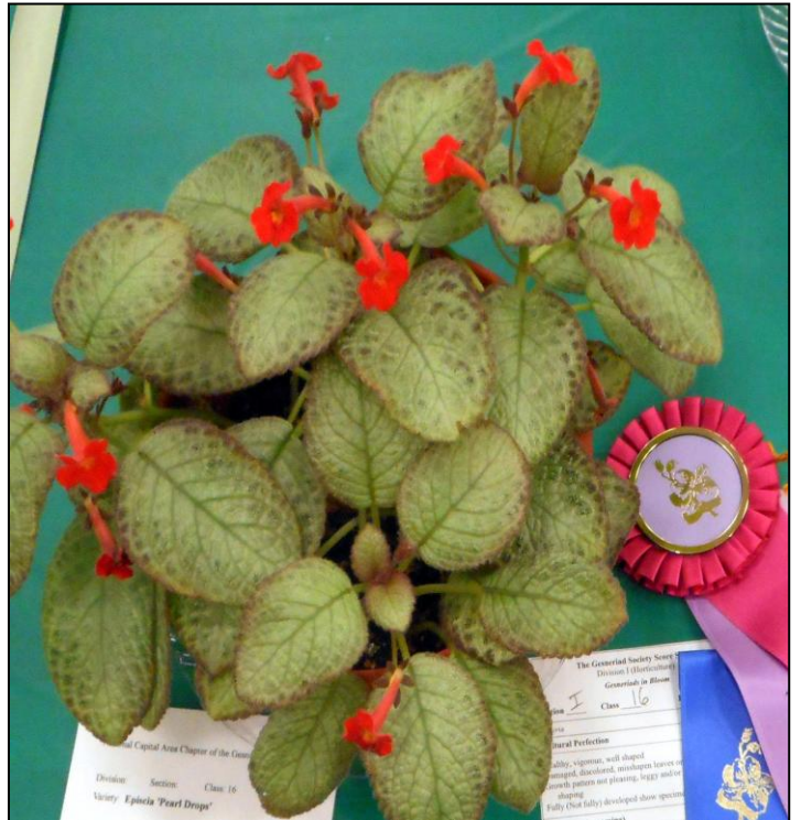
NCAC Show: Bill's Episcia 'Pearl Drop'