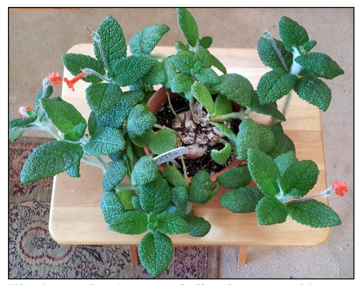
Kitty's amazing Sinningia bullata is 6 years old