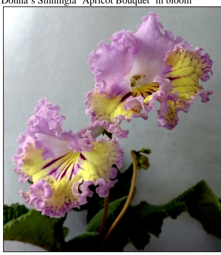
Barb's Streptocarpus 'Renia'