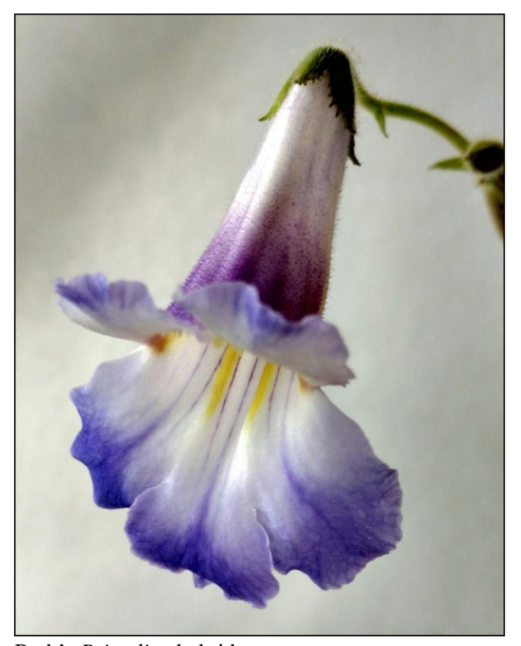
Barb's Primulina hybrid

An excellent website for researching your plants with lots of pictures and detailed information about all gesneriads.