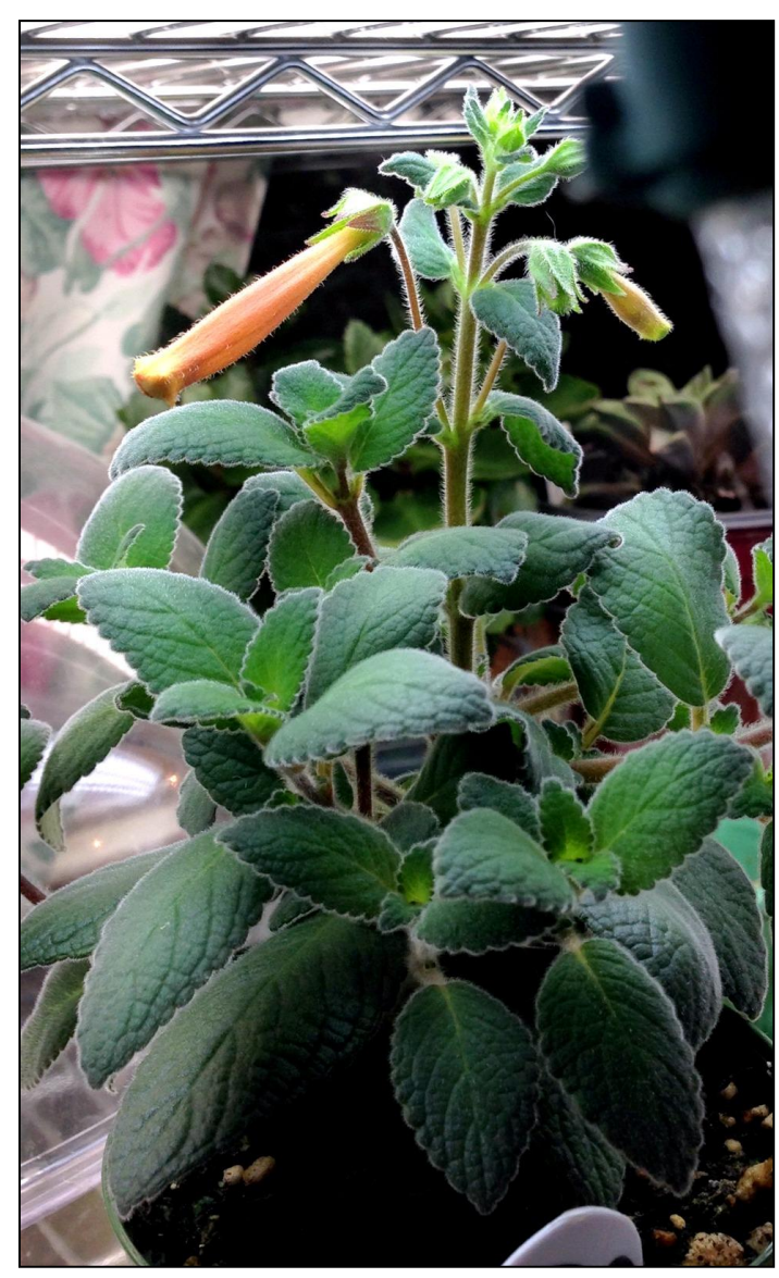
Donna's Sinningia 'Apricot Bouquet' buds last evening. Buds opened in morning! This plant was obtained from Barb at the raffle table a few months ago!