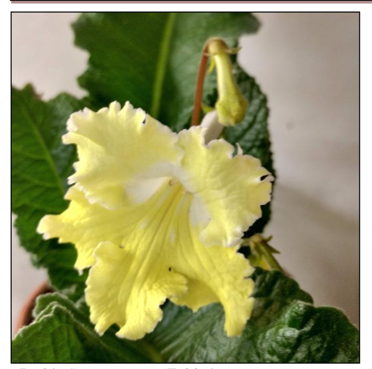
Barb's Streptocarpus 'Zoltko'