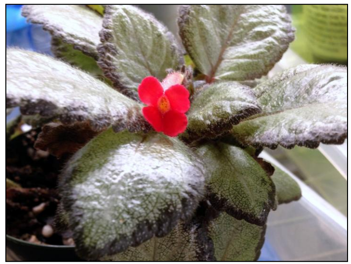
Donna's Episcia 'Silver Skies'