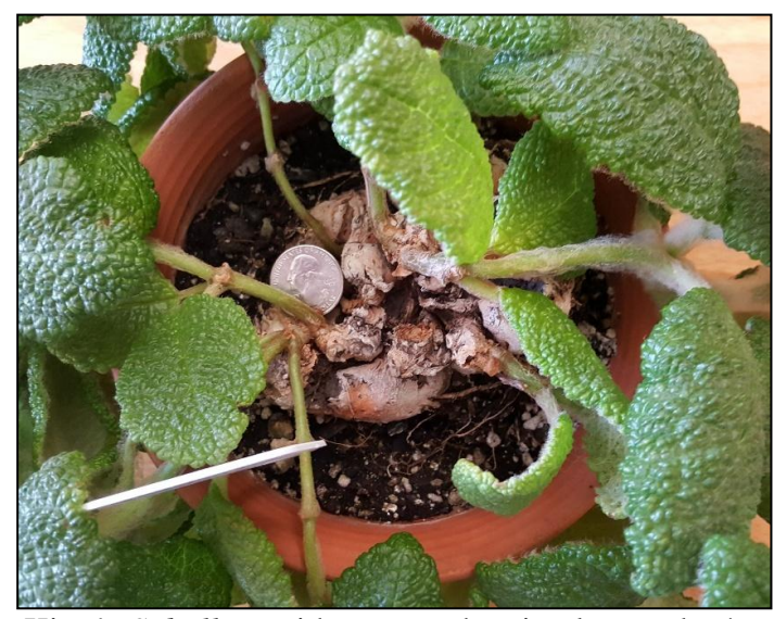
Kitty's S. bullata with quarter showing large tuber!