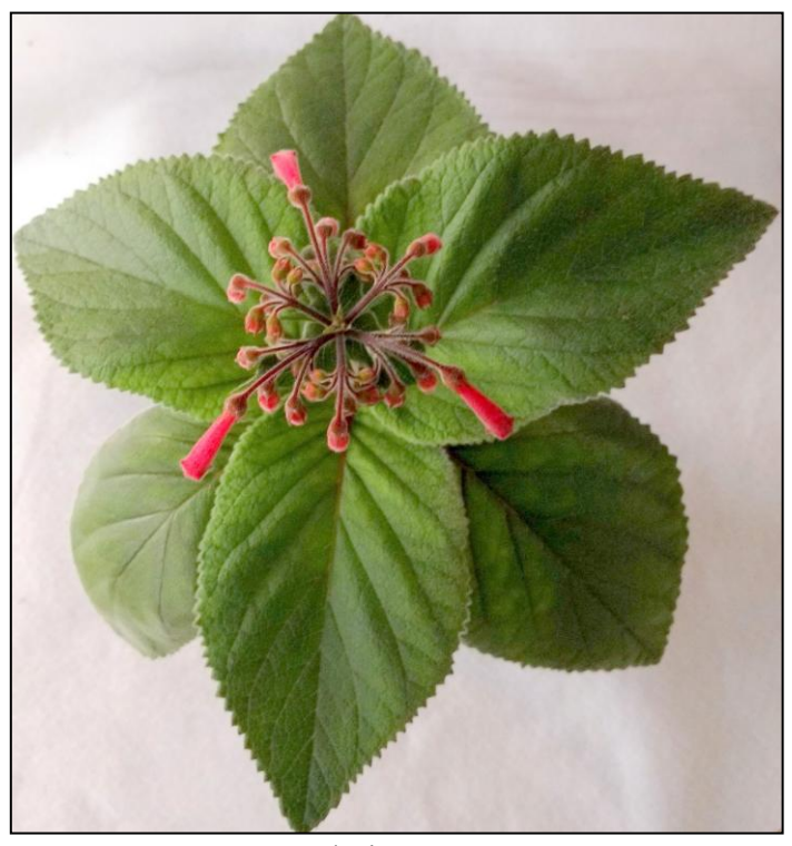
Barb's Sinningia 'Ramboi' hybrid top view