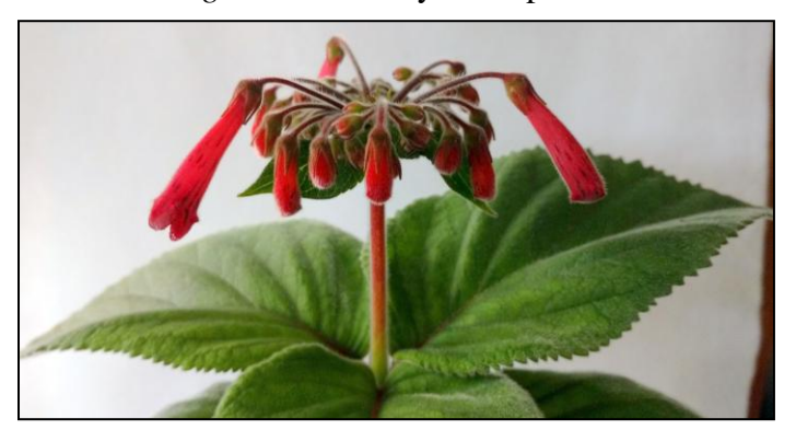
Barb's Sinningia 'Ramboi' hybrid side view