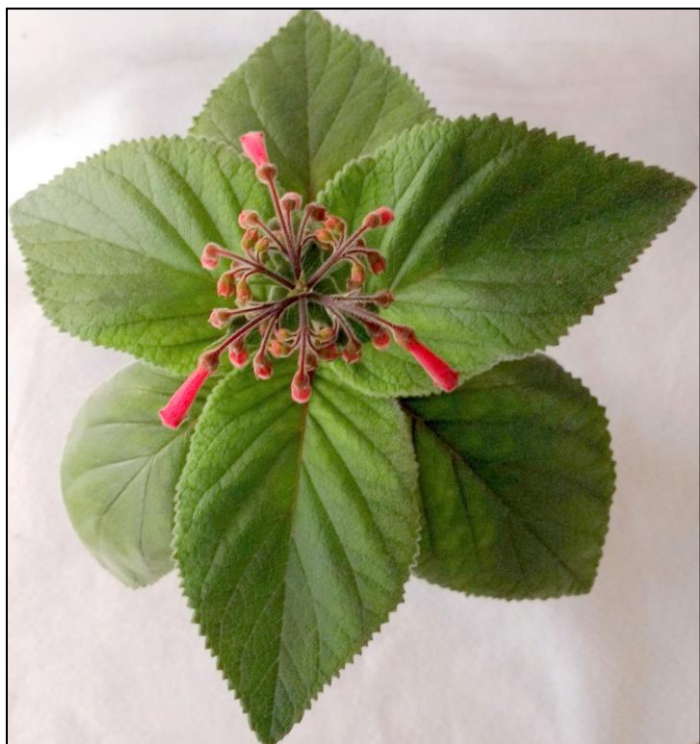
Barb's Sinningia 'Ramboi' hybrid top view