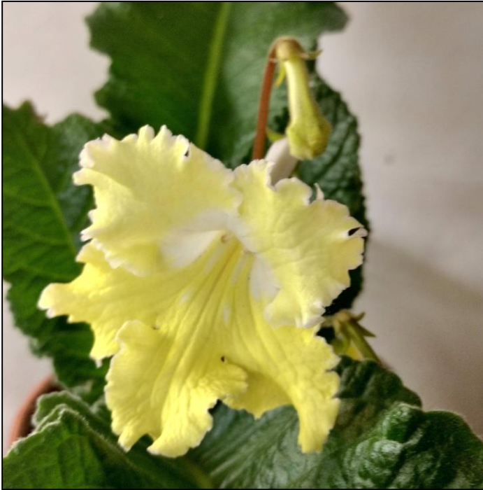
Barb's Streptocarpus 'Zoltko'