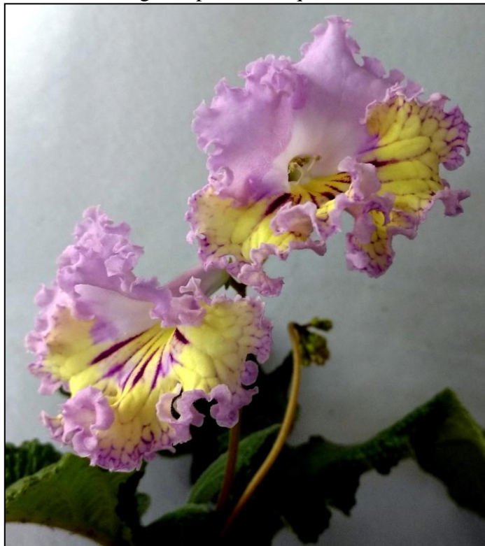
Barb's Streptocarpus 'Renia'