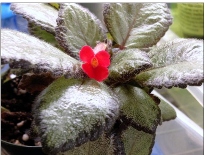
Donna's Episcia 'Silver Skies'