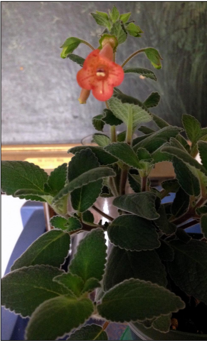
Donna's Sinningia 'Apricot Bouquet' in bloom