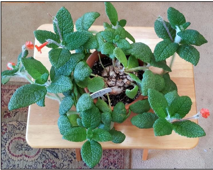
Kitty's amazing Sinningia bullata is 6 years old