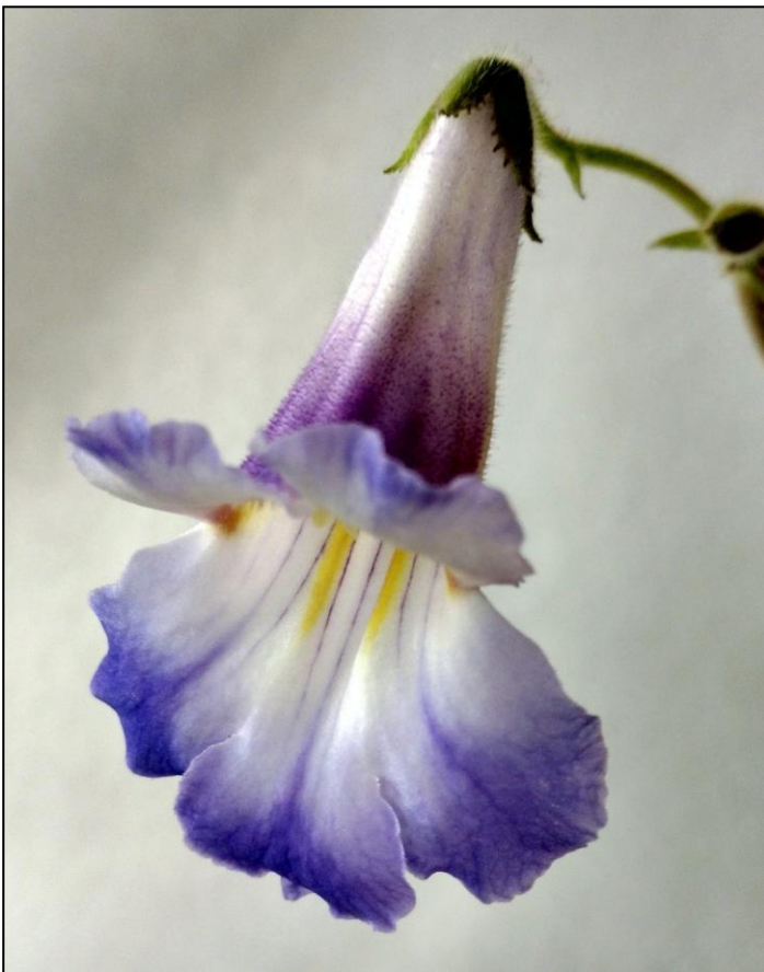
Barb's Primulina hybrid