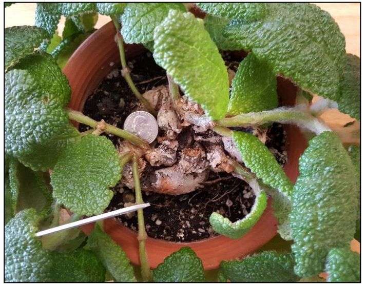
Kitty's S. bullata with quarter showing large tuber!