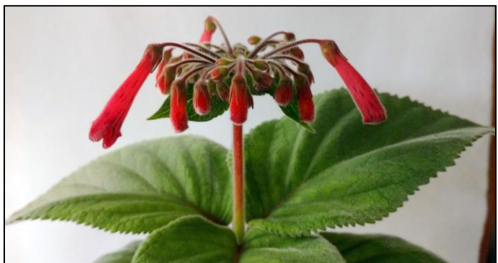
Barb's Sinningia 'Ramboi' hybrid side view