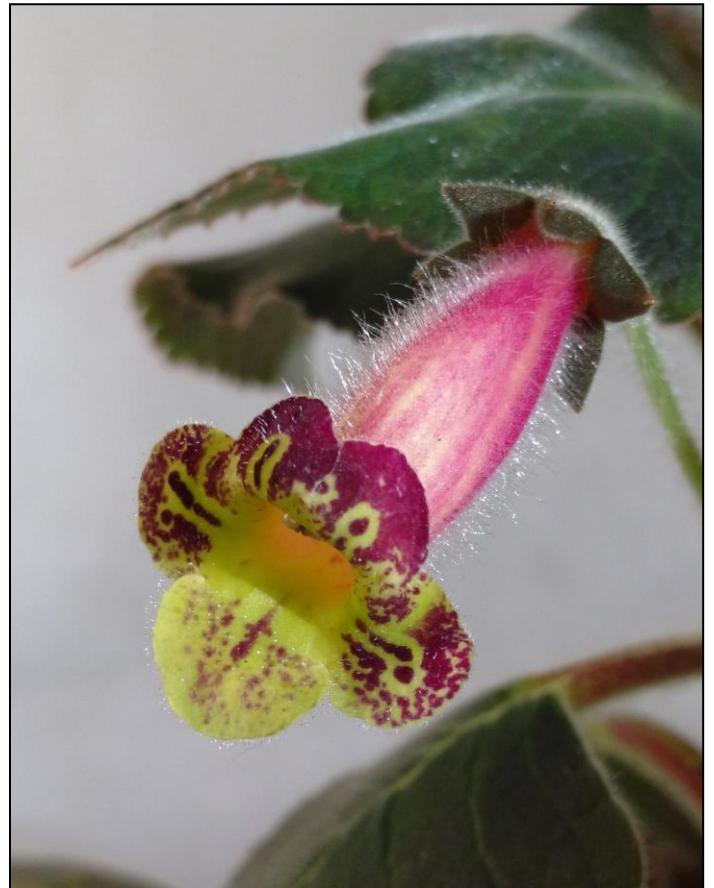
Barb's Kohleria 'An's Nagging Macaw'

An excellent website for researching your plants with lots of pictures and detailed information about all gesneriads.