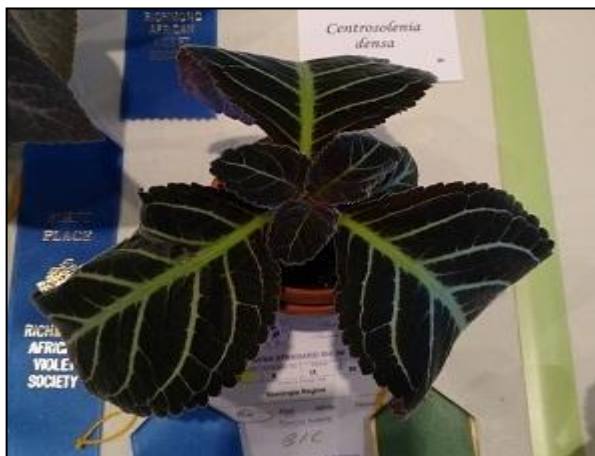
Barb's Sinningia 'Regina' at RAVS