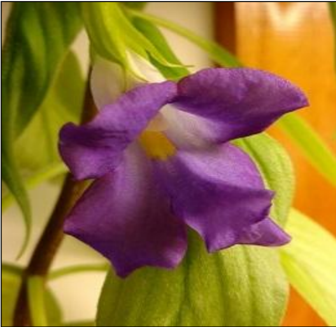
Barb's Henckelia 'Moonii' ...graceful beauty pose.