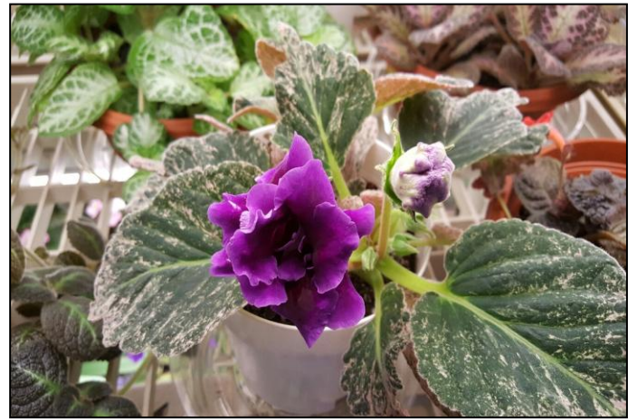
Kitty's Sinningia speciosa 'Aurora Borealis'