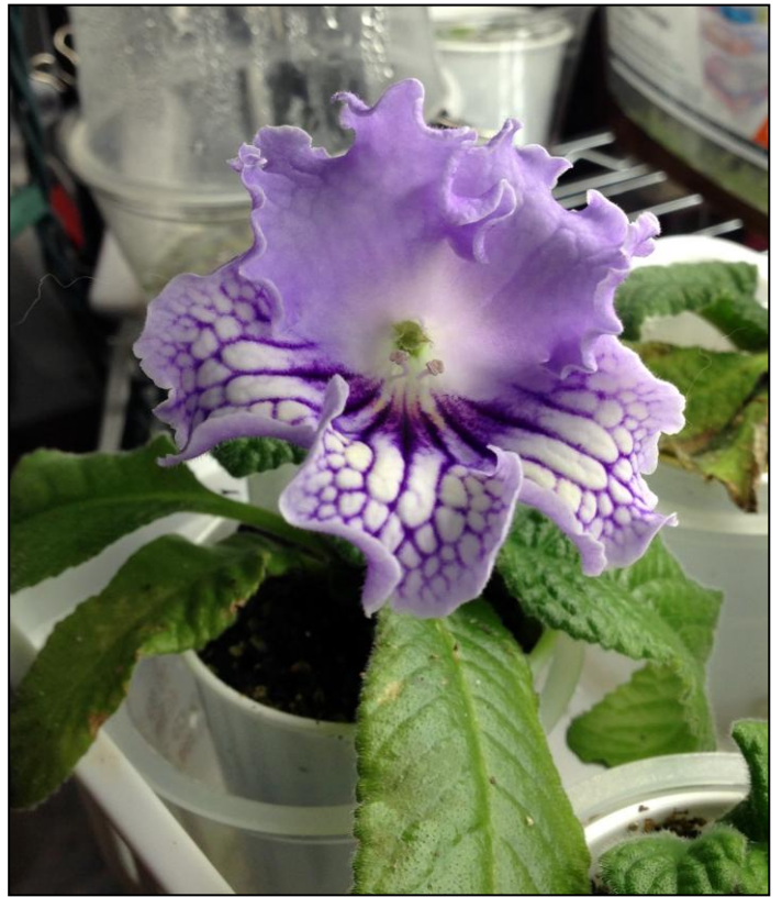
Donna's Streptocarpus 'DS Crystal Lace' from a leaf