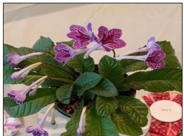
Barb Koski's Best Streptocarpus 'Little Kahn' at RAVS