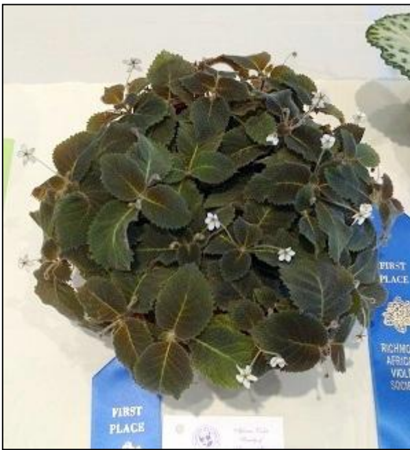
Nell Reese's Amalophyllon RAVS