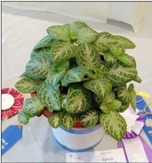
Kitty's Episcia 'Faded Jade' at RAVS