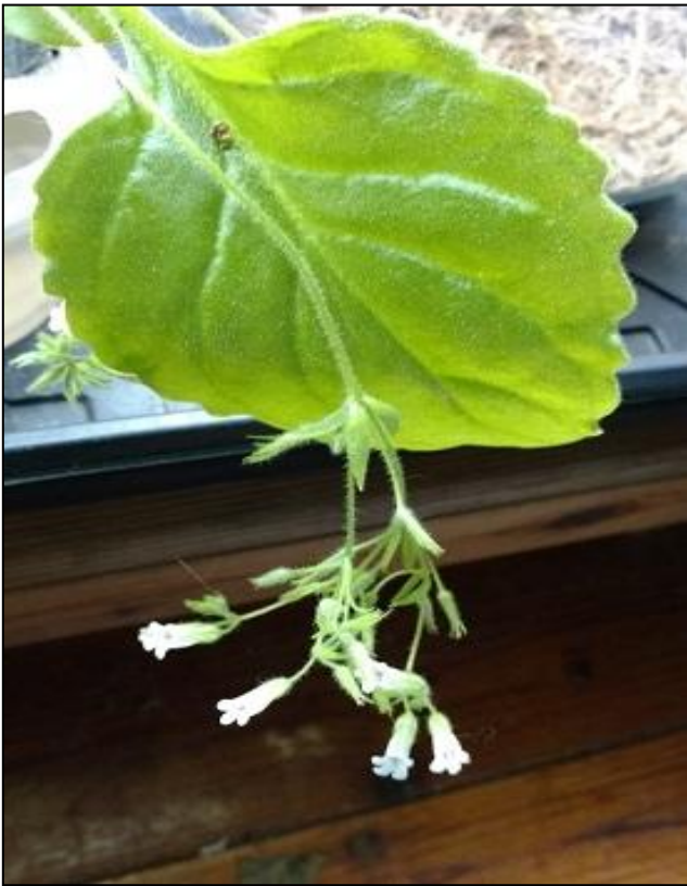
Barb's Primulina species close up of bloom