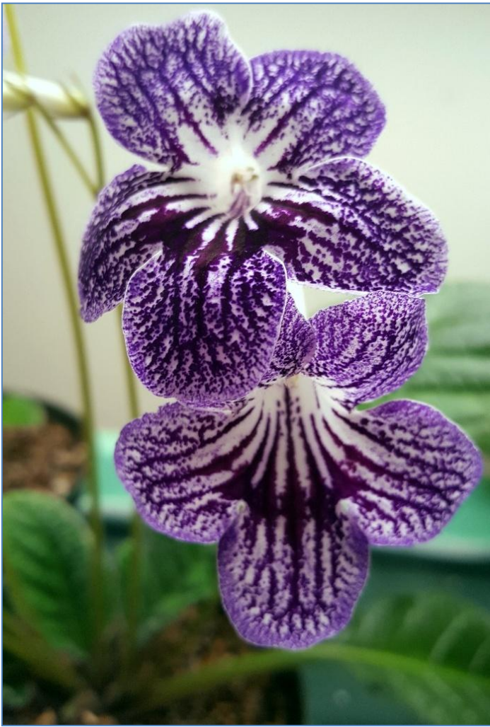
Kitty's Streptocarpus 'Somerset Indigo Ice'