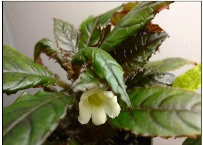
Barb's Nautilocalyx forgetii in bloom