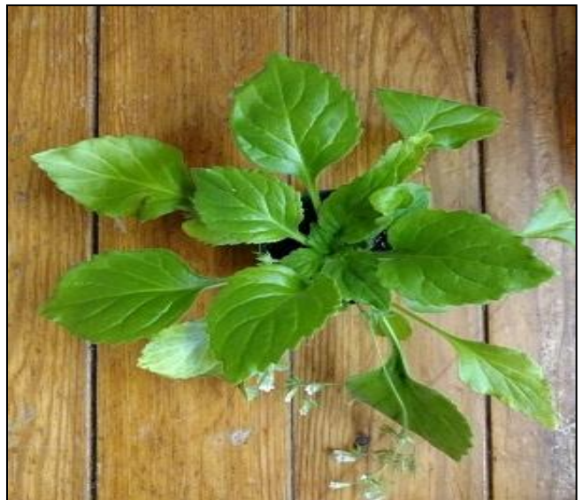
Barb's Primulina species in bloom