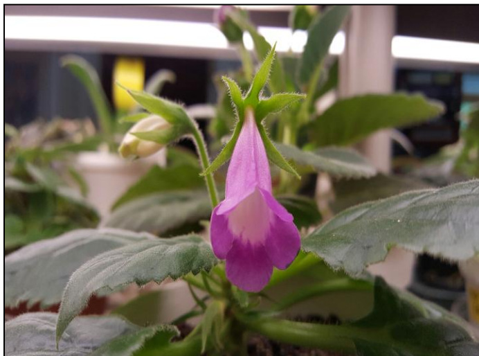
Kitty's Sinningia speciosa seedling