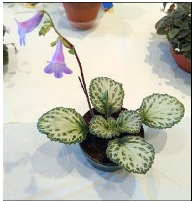
Kitty's Primulina 'Loki' at RAVS