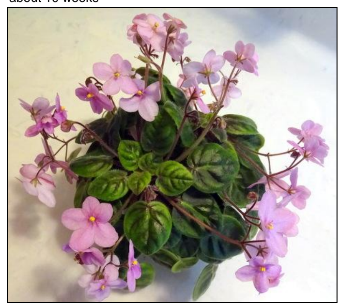
Bill's Saintpaulia 'Foxwood Trails'