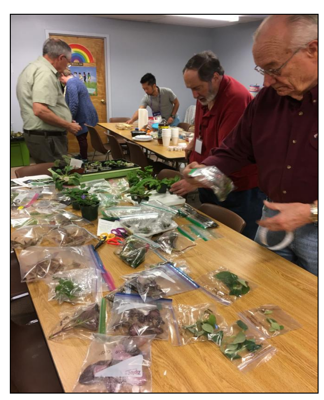
Raffle table full of goodies!