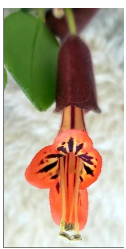
Barb Stewart's Aeschynanthus 'Thai Red'