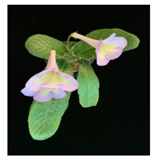
Doug Bolt's Streptocarpus 'Blue Halo'