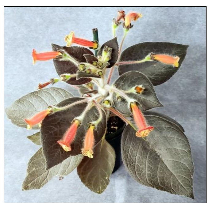
Barb Stewart's Kohleria 'El Capital' close up and a view of the plant from above.