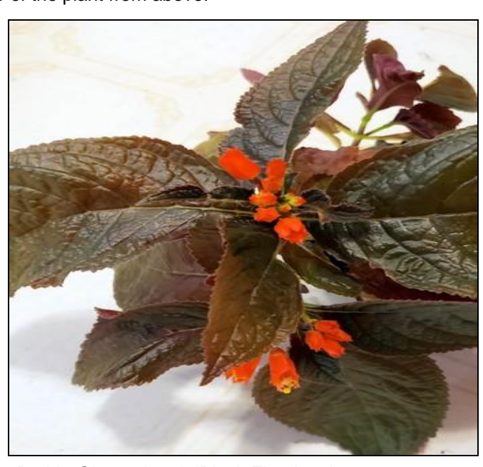
Barb's Chrysothemis 'Black Flamingo'