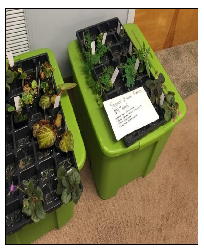
Our first meeting with plants for sale . Members enjoyed buying Dave's plants at $4.00 with our group receiving 25%.