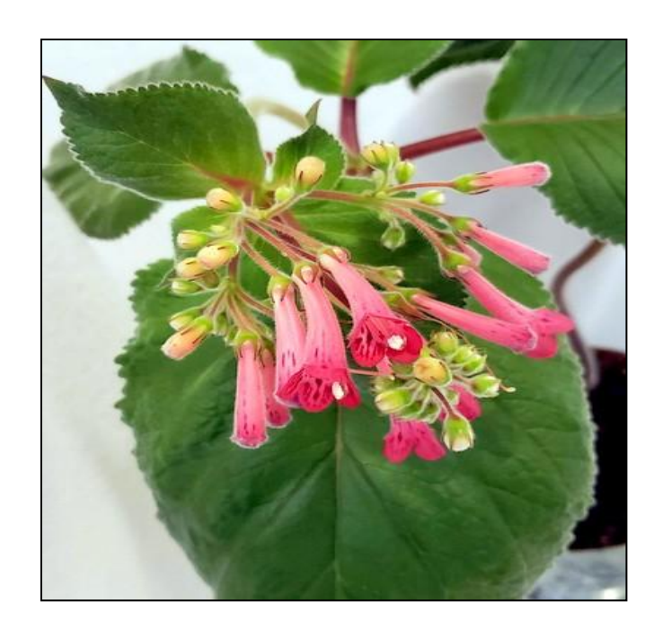
Barb Stewart's Sinningia ramboi in all its stages of growth. So beautiful!