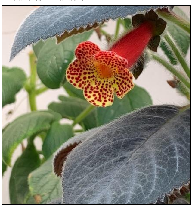
Donna's Kohleria 'Silver Feather'