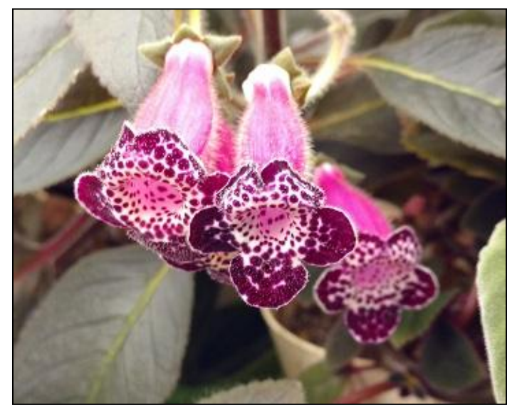
Barb's Kohleria 'Heartland's Blackberry Butterfly'