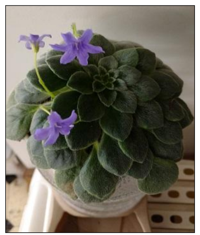
Barb's Petrocosmea 'Short'nin' Bread'