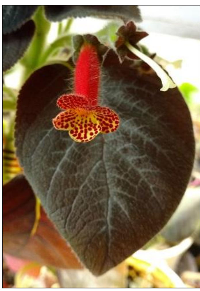
Barb's Kohleria 'Silver Feather'