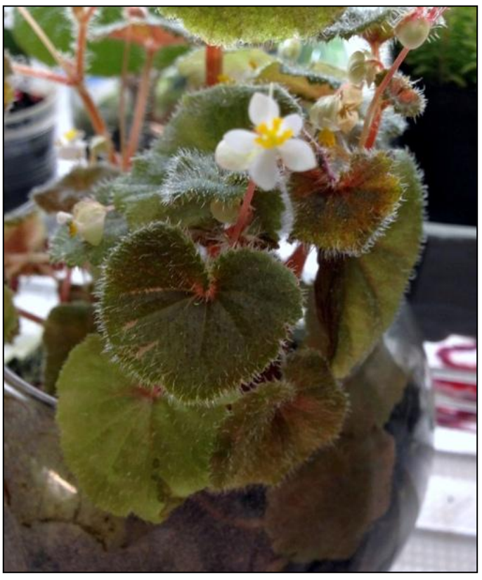
Donna's Begonia Alchemilloides