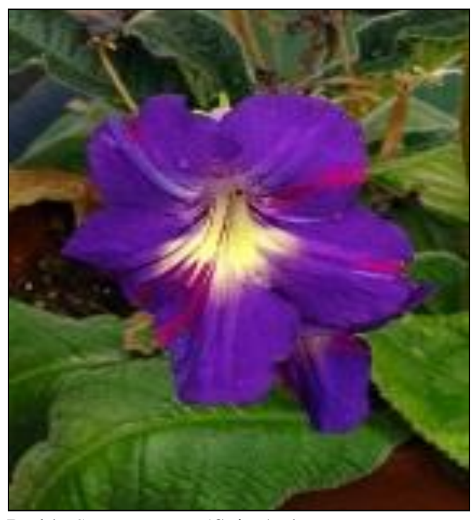
Barb's Streptocarpus 'Spin Art'