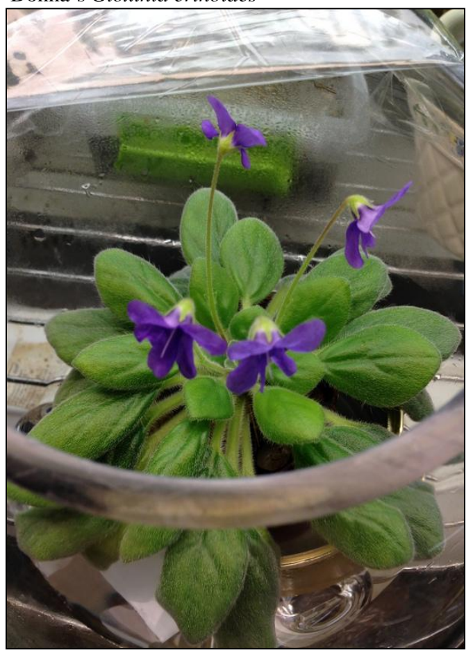
Another view of Donna's Petrocosmea 'Momo' as it is grown in a glass container.