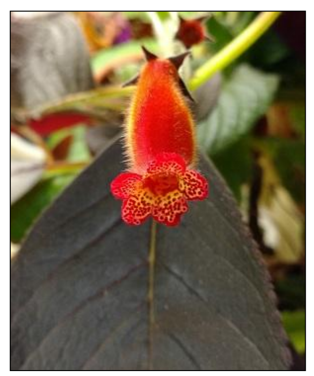
Barb's Kohleria 'Dark Velvet'