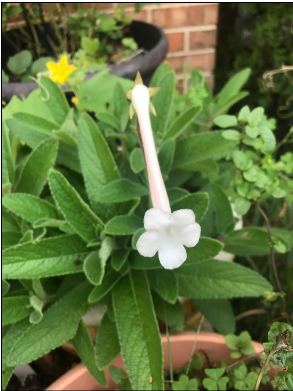
Sherris Sinningia tubiflora