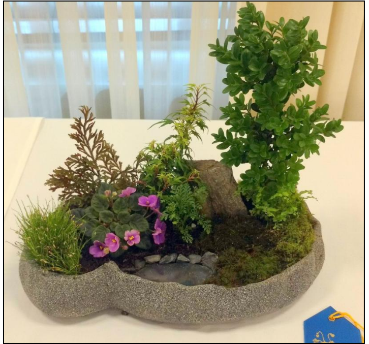
Barb's Dish Garden