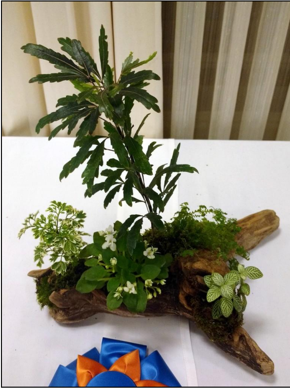
Barbs' Best Design in Show