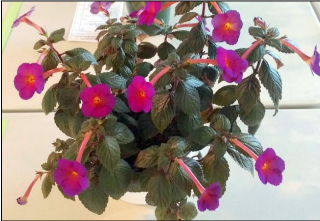
Nell's Achimenes 'Dark Matter'