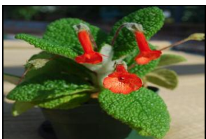
Sinningia bullata seeds and seedlings.