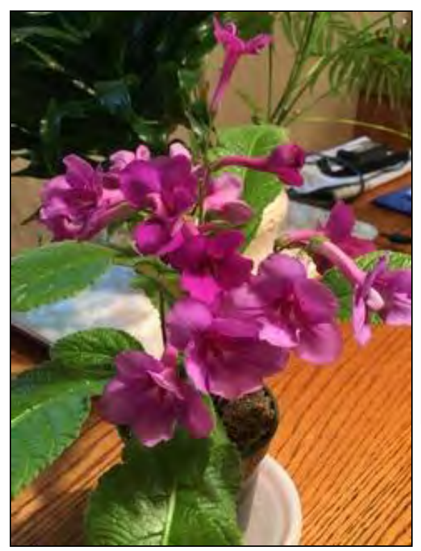
Janet's Streptocarpus 'Janet's Imperfection' "This is a Strep that I have been growing because I love the way the light shines peachy through the violet petals. It's not "perfect" and should have been tossed but I love it and it's doing really well – growing leaves and putting up an abundance of flowers."