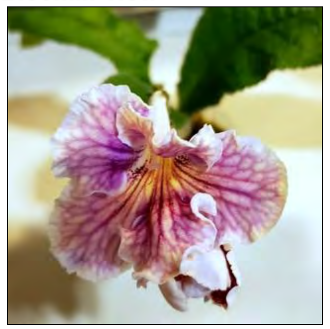
Barb Stewart's Streptocarpus Wow'