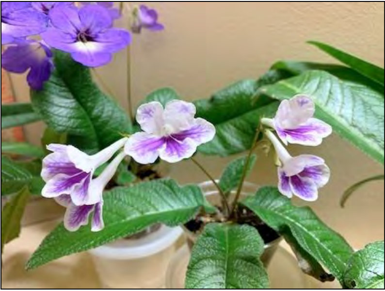
Doug's Streptocarpus 'Cat Dance' which stays small yet has abundant blooms.