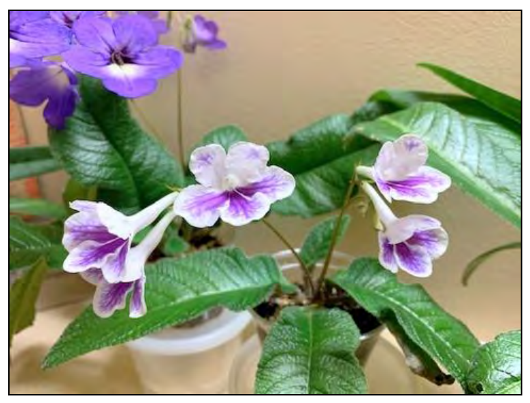
Doug's Streptocarpus 'Cat Dance'