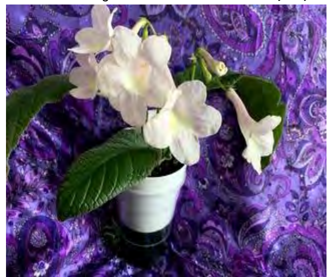
Donna's Streptocarpus 'Bristol's Goose Egg'