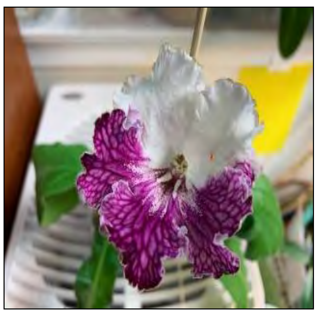
Top: Doug's Streptocarpus seedling from British Streptocarpus Society seeds.

Left: Janet's Streptocarpus seedling. "She loves the way the light shines peachy through the violet petals, its not perfect but sure is beautiful!"