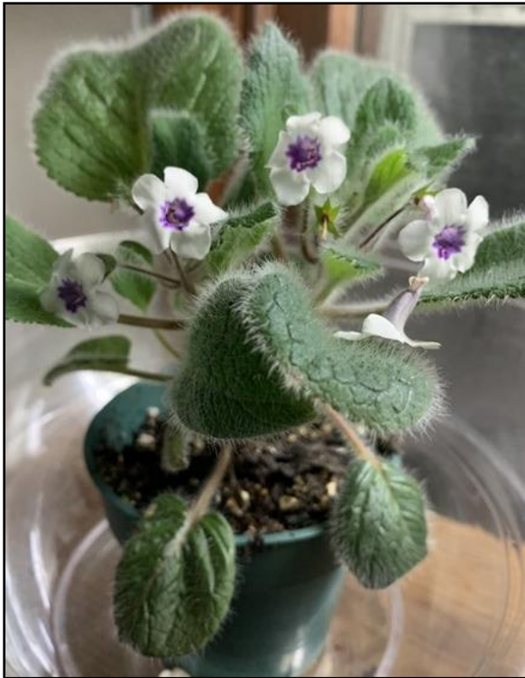
Donna's Sinningia hirsuta growing in a salad bowl terrarium