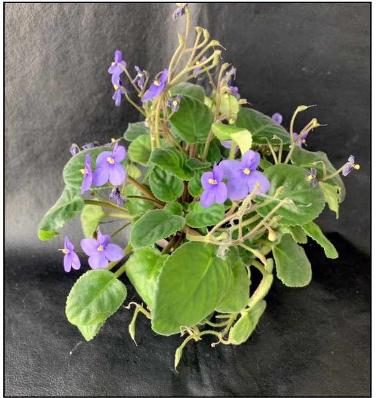
Donna's Saintpaulia rupicola is a constant bloomer and may have self seeded.