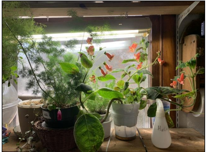
Kohlerias cheerful blooms during winter!