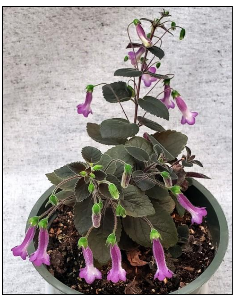
Barb's Sinningia 'Deep Purple Dreaming'