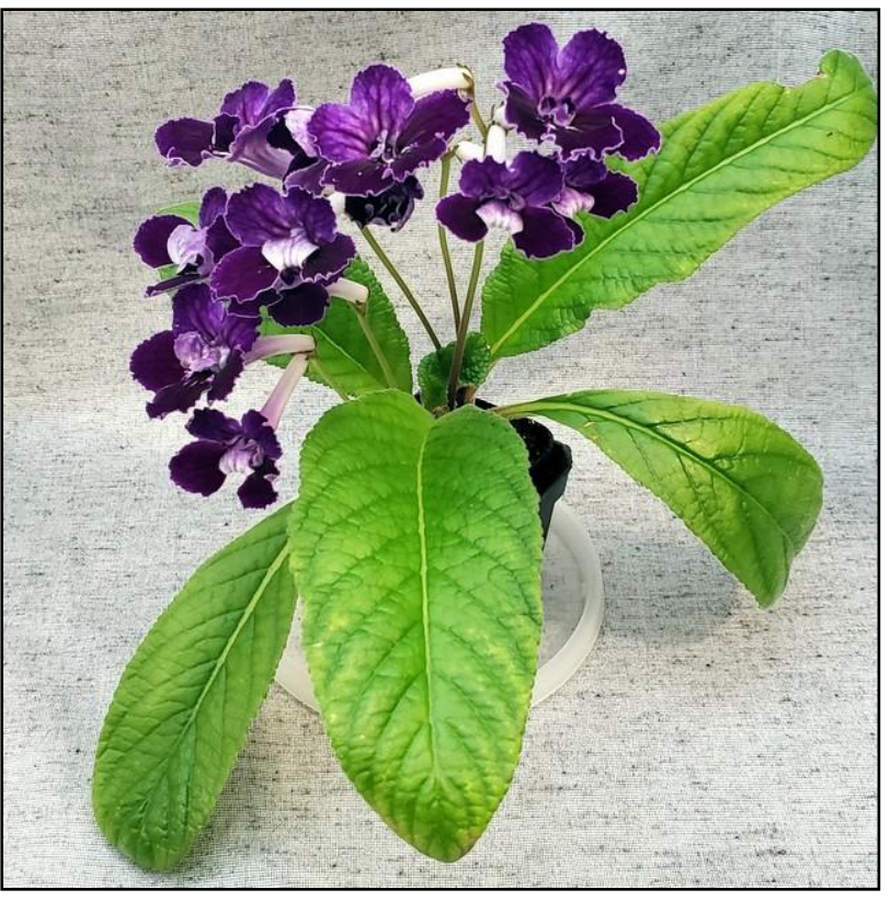
Barb's Streptocarpus 'Bristol's Black Mascara'