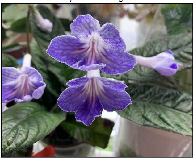
Donna's Streptocarpus 'Janet's Got The Blue'