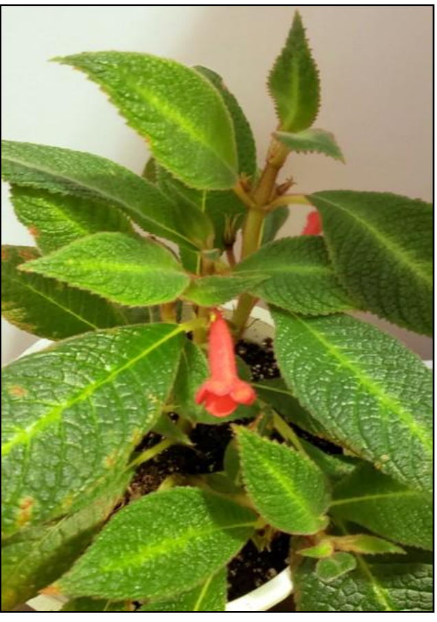
Barb's Centrolsolena: "This is Centrosolenia porphyrotricha growing and blooming happily in my large terrarium. This is an easy to grow New World species from South America. According to the Gesneriad Reference Web, "most species are found growing on the shady banks of rivers and streams, in crevices or on wet, mossy rock and in the understory of the rain forests", so it enjoys the humidity of a terrarium. The brown spots on the leaves resulted from a "drought" in my terrarium when it dried out. To reduce the condensation on the glass and provide ventilation, I leave the Plexiglas tops cracked a little, so I need to water once in a while. This also allows the plants to get some fertilizer periodically."