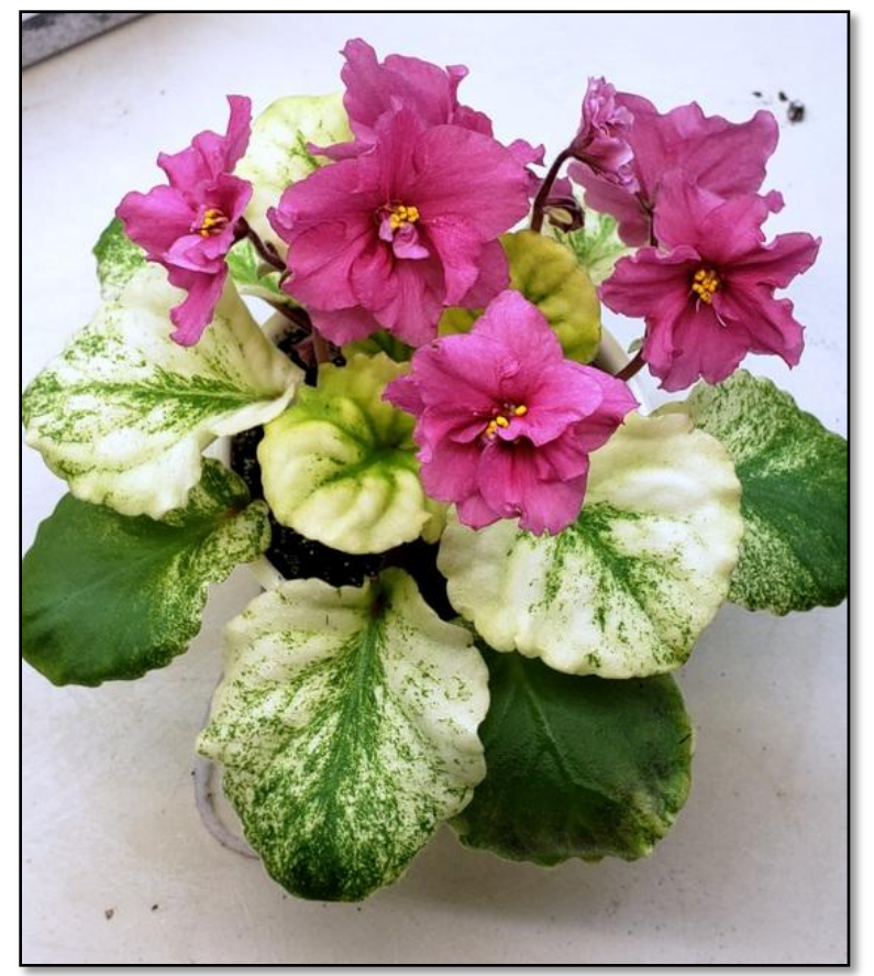
Sharon Long's Saintpaulia 'Sunny Salmon' with yellow variation