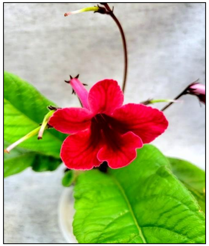
Barb's Streptocarpus 'Bristol's Cherry Bomb'