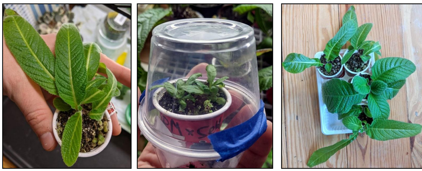
Nadya's experimentation crossing Streptocarpus with African Violets.

Janet: "These are the photos of the Kohleria eriantha – cross pollinated seedlings that I mentioned on FB. 3 larger ones in one 4" pot and the other 4 smaller ones in another 4" pot. Not sure what to expect. They were outgrowing their deli container already (too tall) so they are now in wicked pots. Probably too wet. I may lift the wicks out of water tomorrow. We'll see. Have not planted the Kohleria warszewiczii seeds from Brazil plants yet. Need to see how much room I have before growing out even more seedlings but I'm looking forward to those more than these."