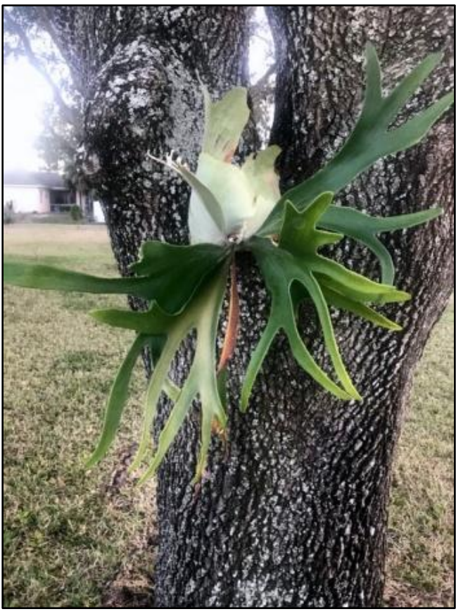
Jim: "I've always liked the look of Staghorn ferns. This one was so easy to take care of. I mounted it to the tree and it just grows. Rainwater is all it needs and it just keeps putting out more leaves. Has even gone through a couple light frosts with no damage.