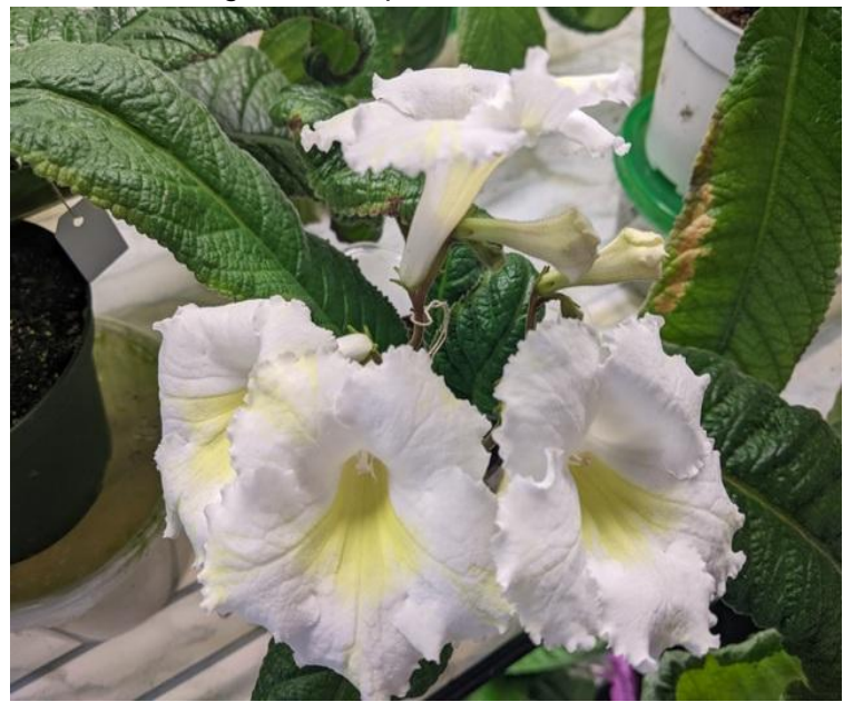
Nadya's Streptocarpus fave!