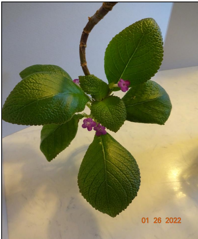
Bill's Nautilocalyx 'Berle Marx'