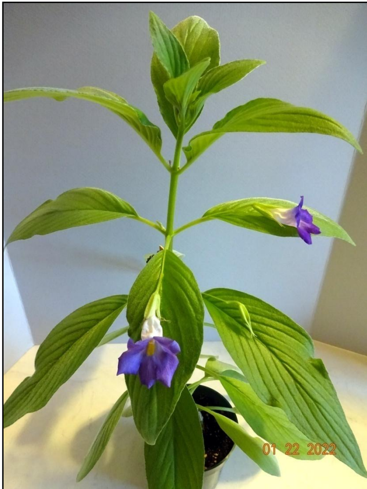
Bill's Henckelia moonii