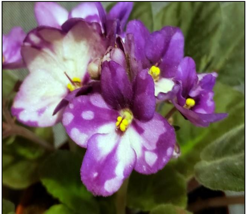
Barbara: "A Saintpaulia NOID with unusual blossoms I bought recently. This looks a little like a puff fantasy, but may just be a sport issue. It will be interesting to see if this pattern continues on other blossoms."