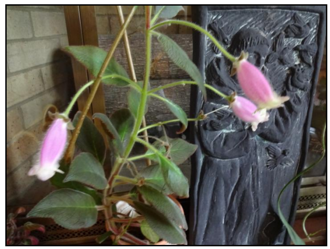
Bill's Kohleria 'Beltane'