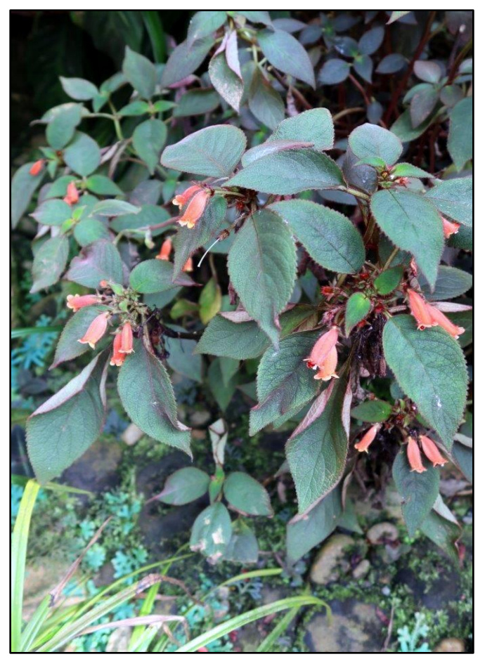
Gesneriad NOID, maybe a S. reitzii?