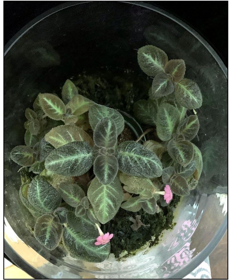
Donna's Episcia 'Jim's Canadian Sunset' in a terrarium. "I think it is a cutting from the December meeting.