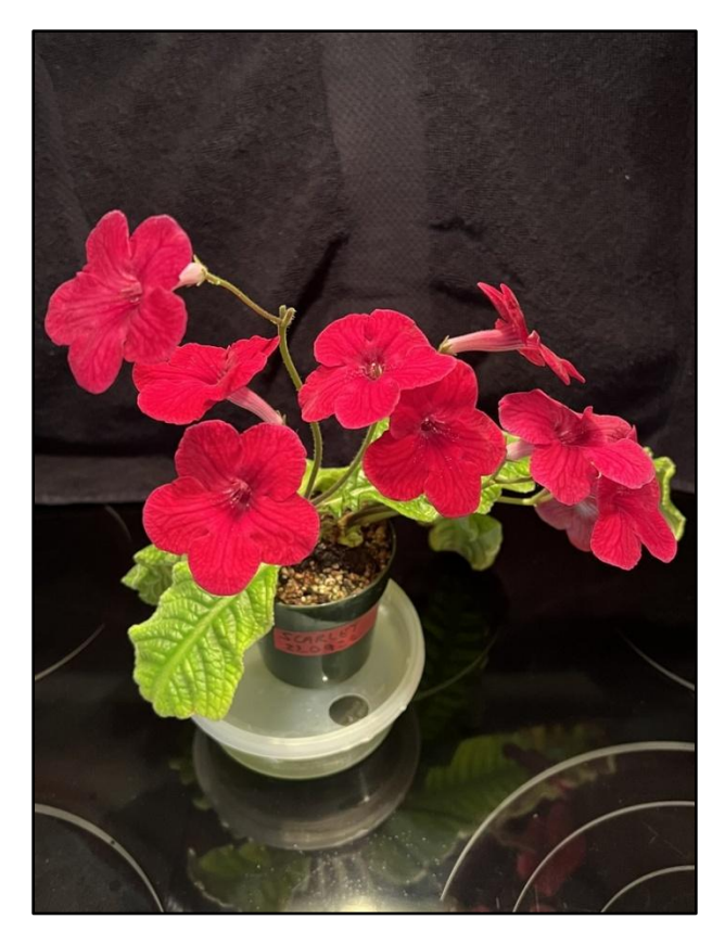
Janet's Streptocarpus 'Scarlet'