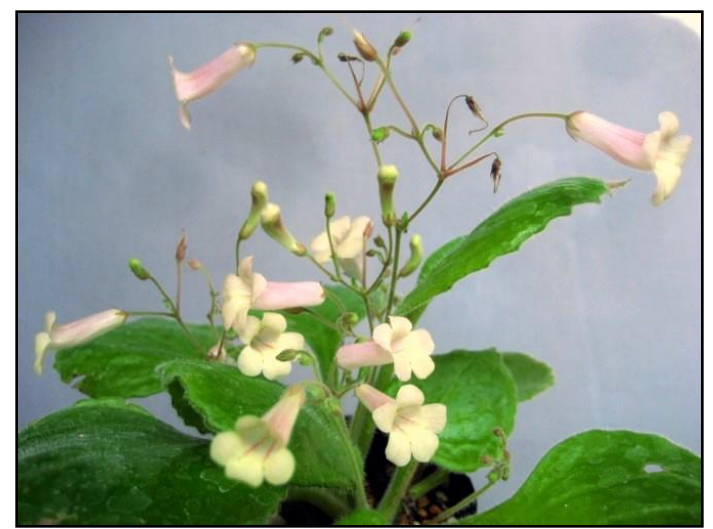
"Another hybrid of Primulina tabacum with former Chirita . This is Primulina flavimaculata x Primulina tabacum I made in 2014. There is a scent on the leaves."