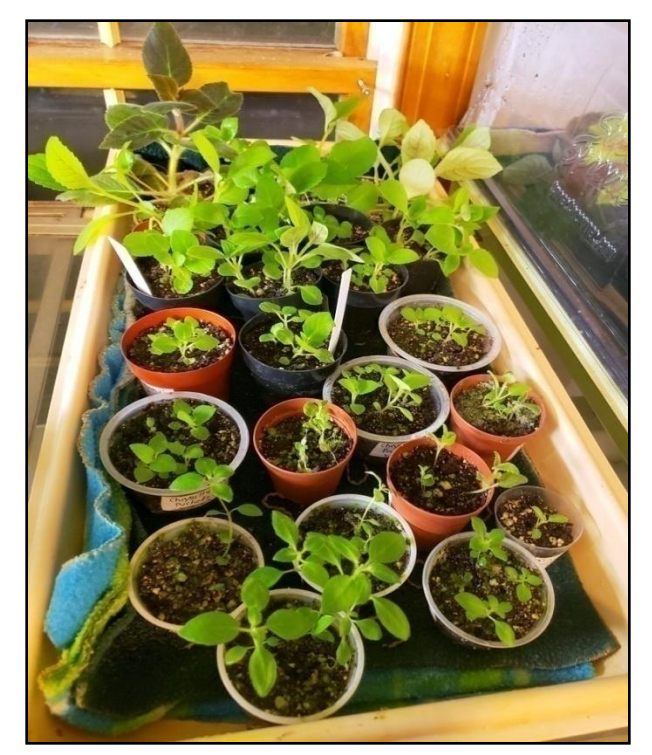
Barb's tray of gesneriads to share at our Propagation meeting in March