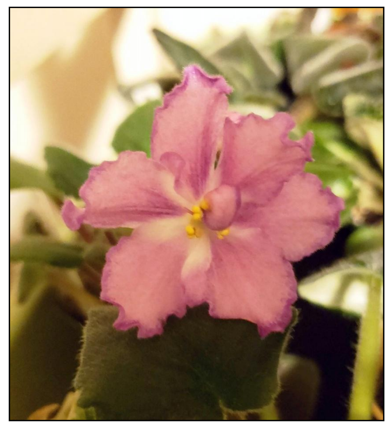
Barb's Saintpaulia 'RS-Operetta'