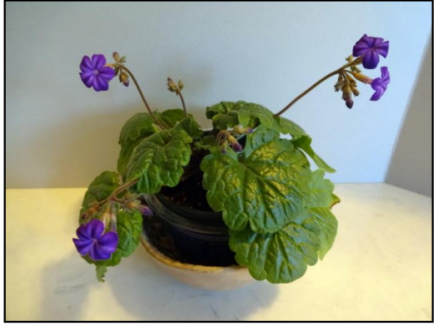
Bill's Primulina tobacum