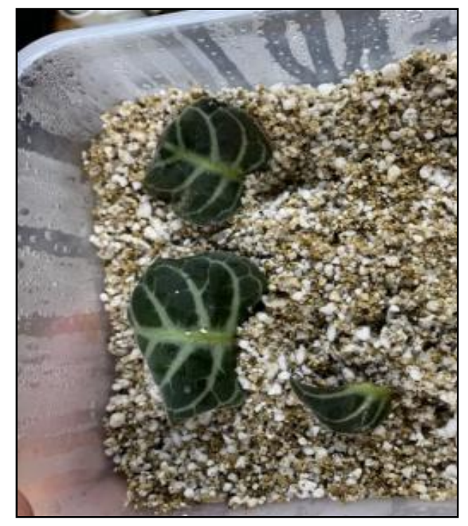
Donna's leaves rooting from S. speciosa regina 'Serra Da Vista'.