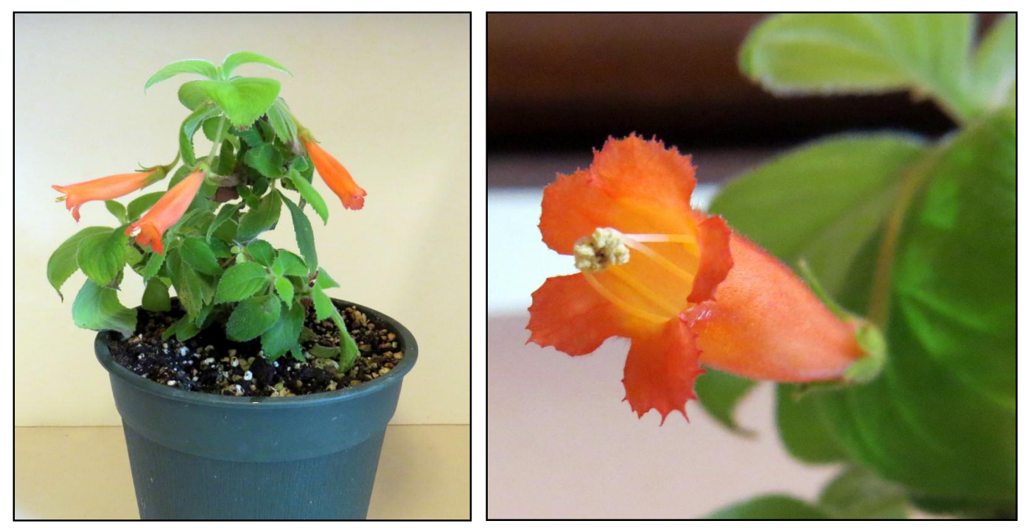
Mousoonia septentrionalis G1202

Karyn Cichocky : "I received some old seed back in 2017 of this species. The seed was between 15-20 years old and I got a few plants to come up. I was happy to see that the remaining plant was finally going to bloom for the first time. The flowers are paler than Mousoonia elegans and have fringe on the petal edges. I've made cuttings and hope to have plants for the convention plant sales tables."