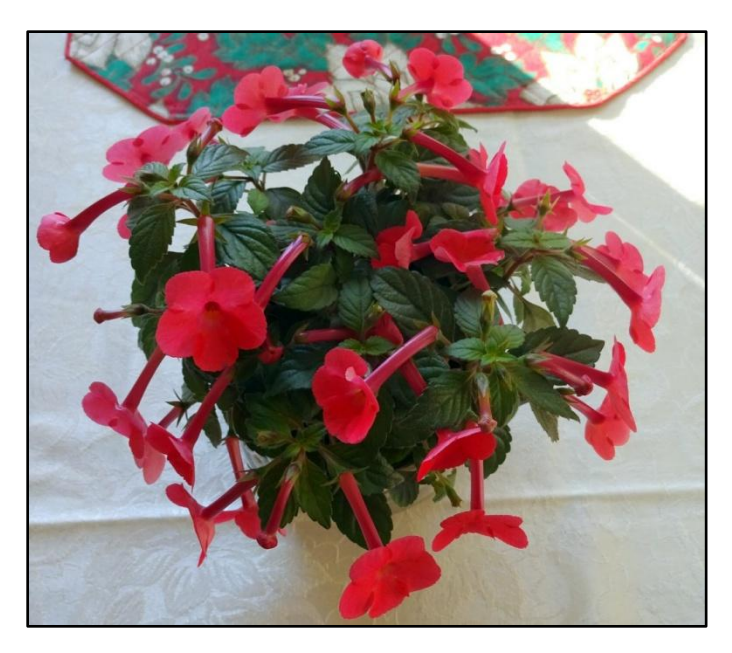
Bill's Achimenes 'Glory'