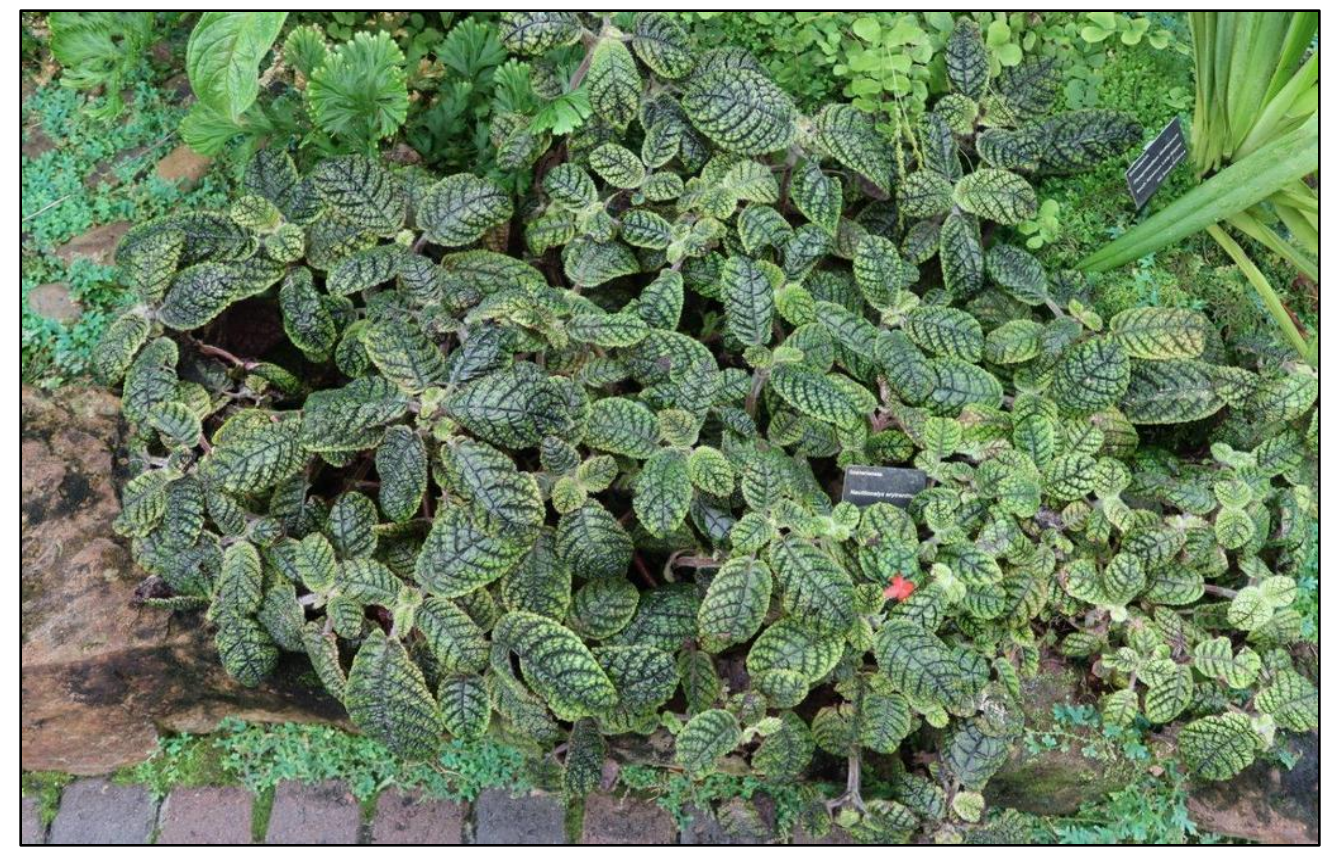
The rare Nautilocalyx erytranthus