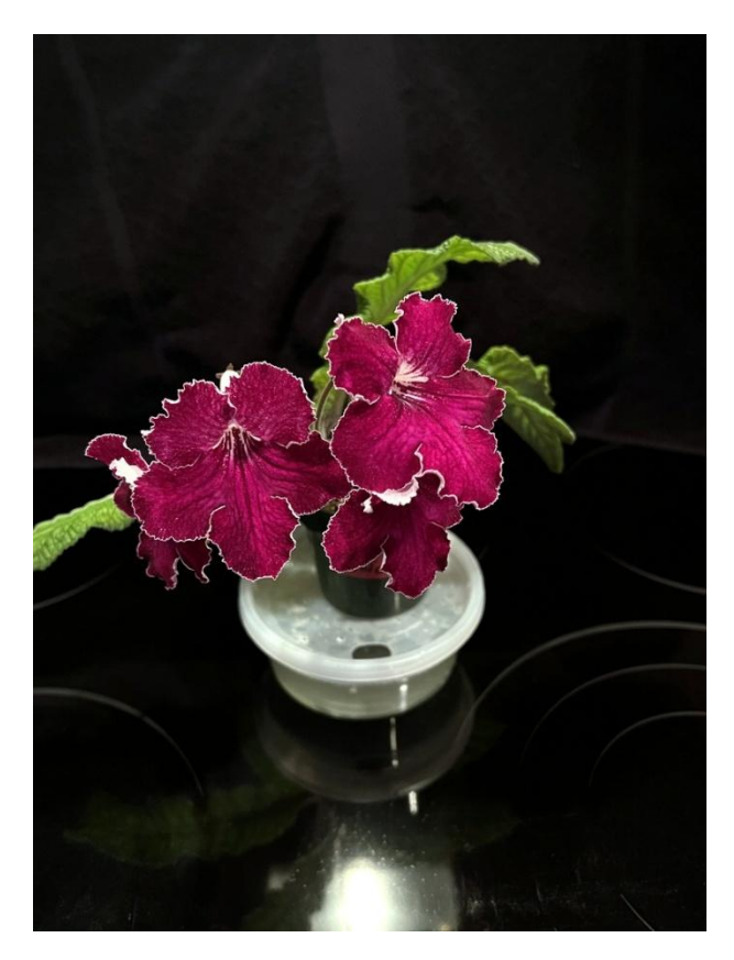
Streptocarpus 'Janet's Wino' is one of her hybrids!