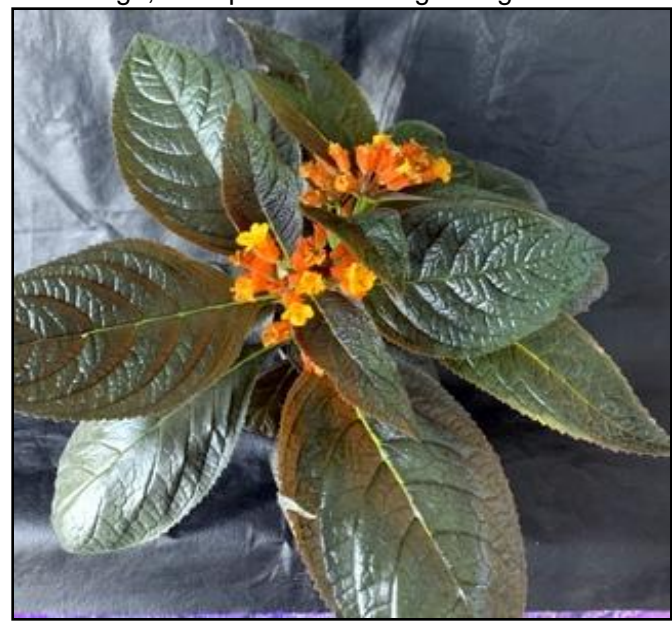
2020 blooms of Chrysothemis pulchella 'Black Flamingo'