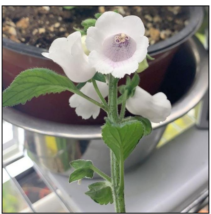
Donna's Gloxinopsis racemosa light leaf colored form: above & below. Previously named Gloxinia racemosa. It grows from