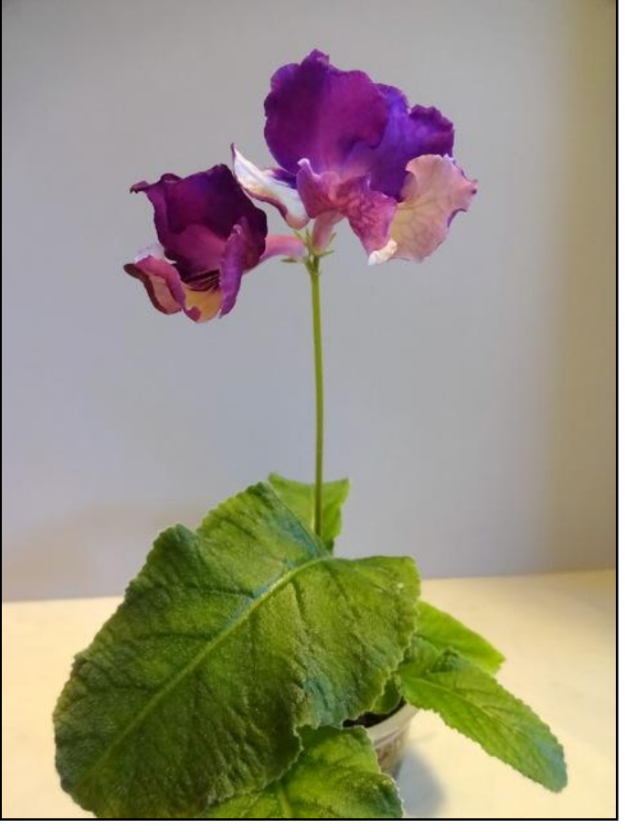
Bill's Streptocarpus 'Versace'