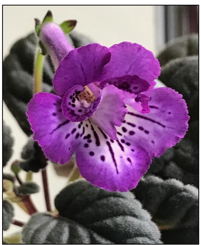
Jim's Sinningia 'Double Dilly' "Nice dark leaves and extra petals"