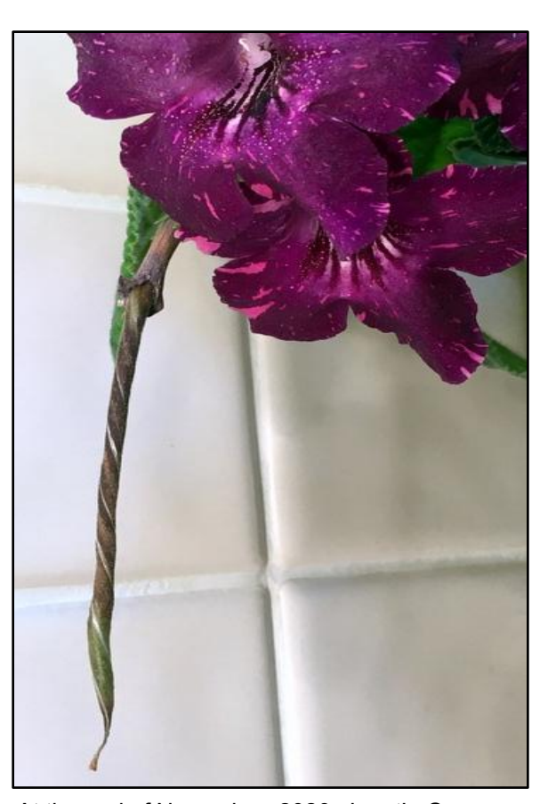
At the end of November, 2020, Janet's Streptocarpus 3S-Fernweh spontaneously self-pollinated. Now, on Valentine's Day, the pod is almost 11 weeks old and seems ripe enough for harvesting. It will be dried thoroughly before the seeds are stored in the fridge until ready to plant.