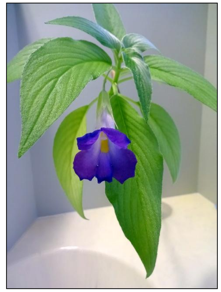
Bill's stunning Henckelia moonii blooming again in 2021