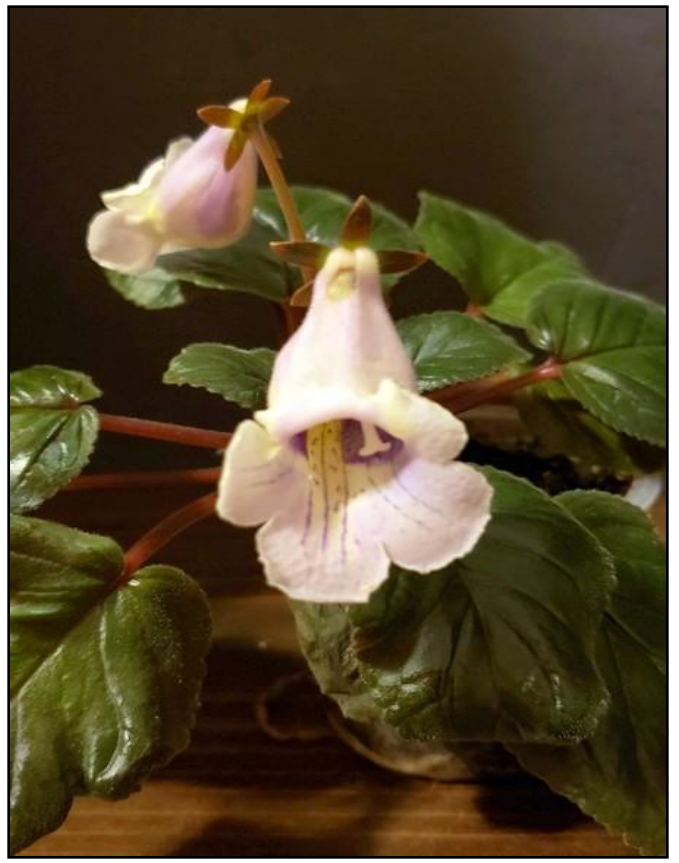
Barb's Sinningia eumorpha with light purple tint.