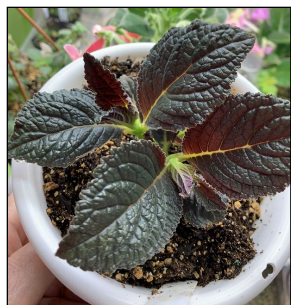
Donna's Chrysothemis pulchella dark leaf, possibly Black Flamingo, has sprouted and is growing so fast!