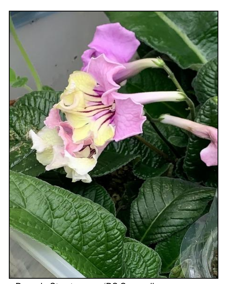
Donna's Streptocarpus 'DS Caramel'