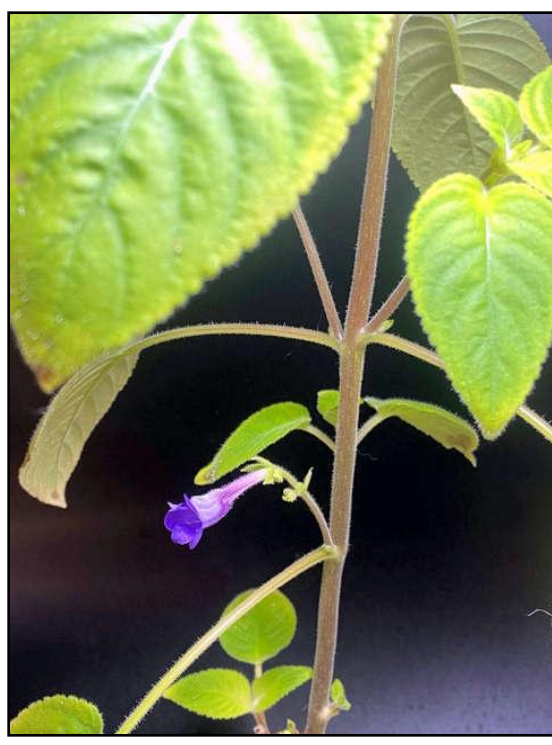
Tribounia grandiflora A new gesneriad

https://www.researchgate.net/figure/Tribounia-grandiflora-DJ-Middleton-A-habit-B-flowers-C-side-view-of-corolla_fig2_264552412