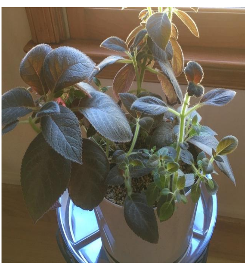
Janet's Kohleria 'Silver Feather' has beautiful foliage