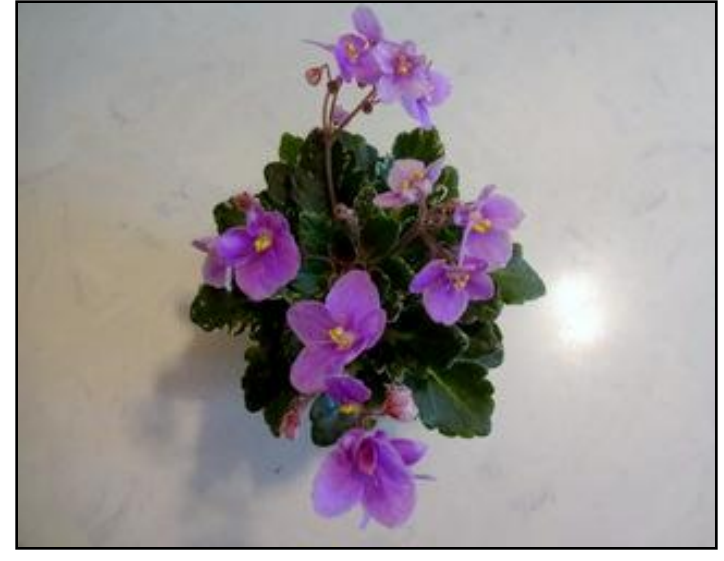
S. Aca's Raspberry Rapture from AVSA FB page