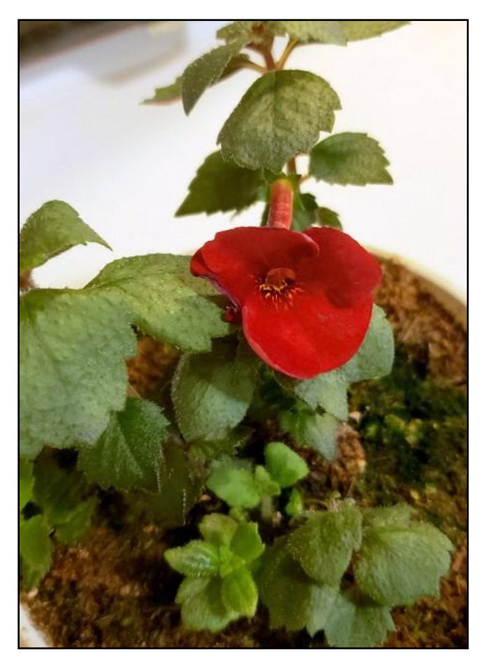
Barb's Achimenes 'Red Elf'