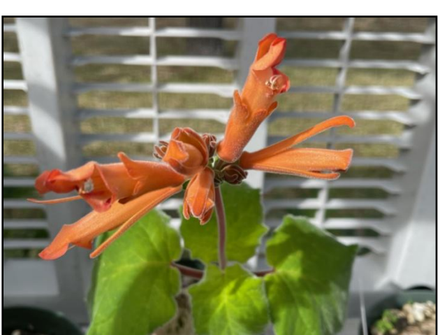
Two views of Jim's Sinningia 'Orange Feathers'