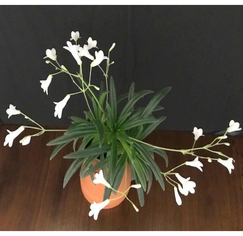
Barb Borleske: "A recent photo of my hybrid, Primulina 'Minnie Pearl'. It's grown in natural light on my chilly sun porch and is a winter bloomer.