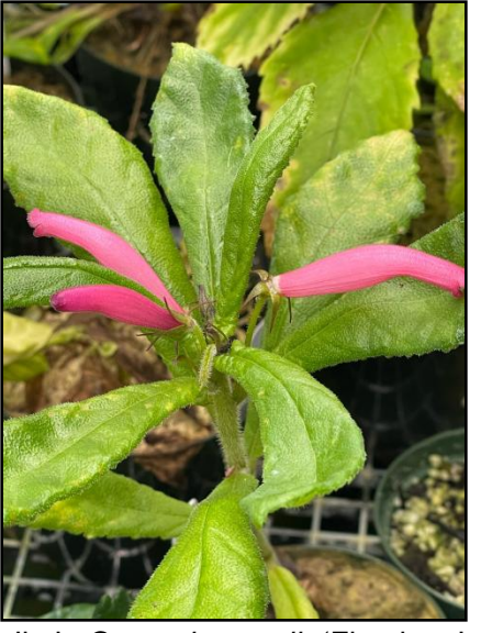
Jim's Gesneria acaulis 'Flamingo'