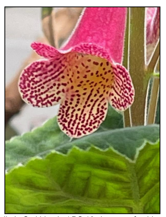
Jim's Smithiantha 'DS 16 close up of a bloom.