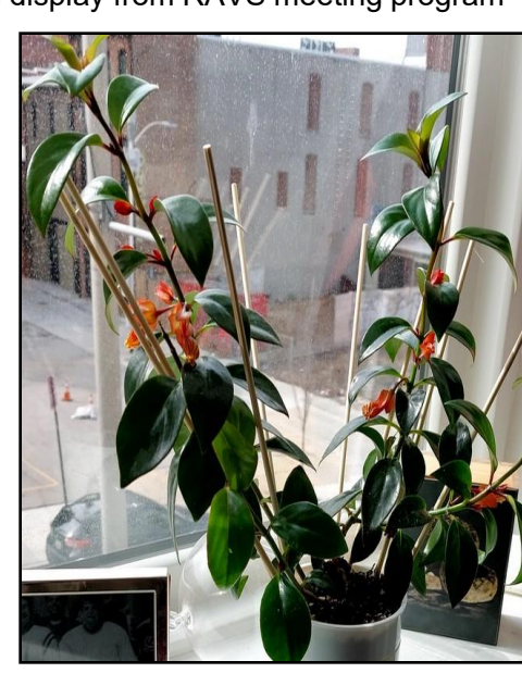
Brian Nematanthus 'Tropicana'