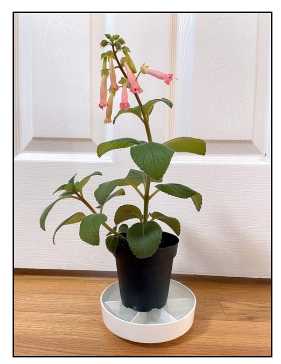
Dena's Sinningia grown from mixed seed packet when joining AGS several years ago.