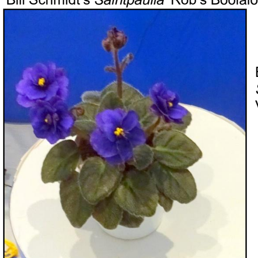
Bill's Best Miniature Saintpaulia 'Rob's Voodoo Blue'