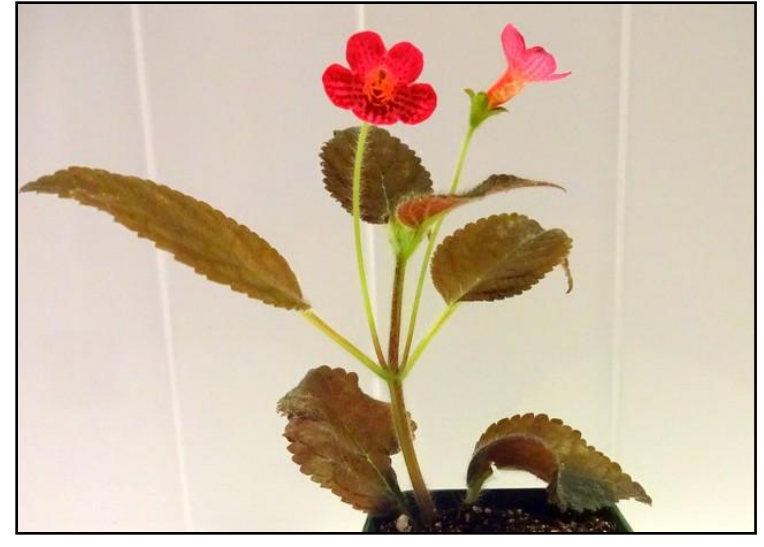
Bill's Kohleria 'Little Flirt'