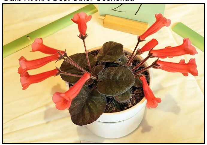
Kitty's Sinningia 'California Sunset'