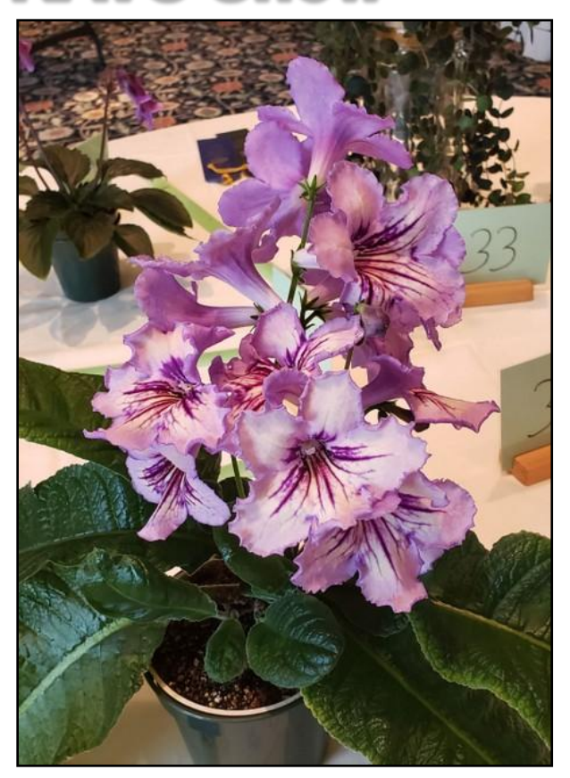
Nadya's Streptocarpus hybrid in RAVS