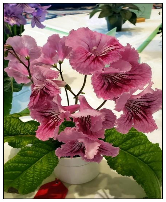
Barb Koski's Streptocarpus hybrid