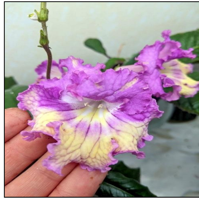
Two of Nadya's hybrid Streptocarpus