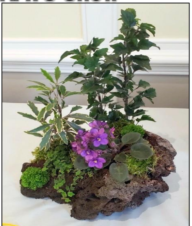
Barb S: Best Design in show