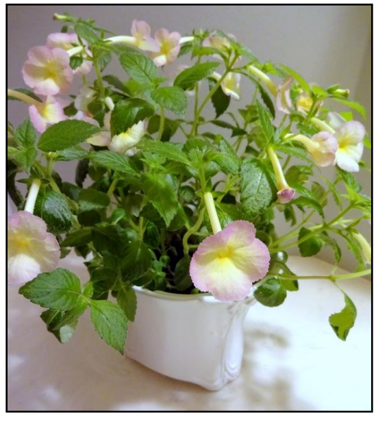
Bill's Achimenes 'Sauline"