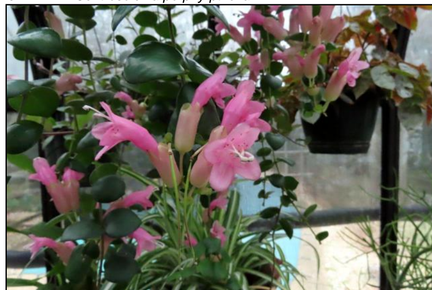
Johanna's Aeschynanthus 'Thai Pink' a non stop bloomer