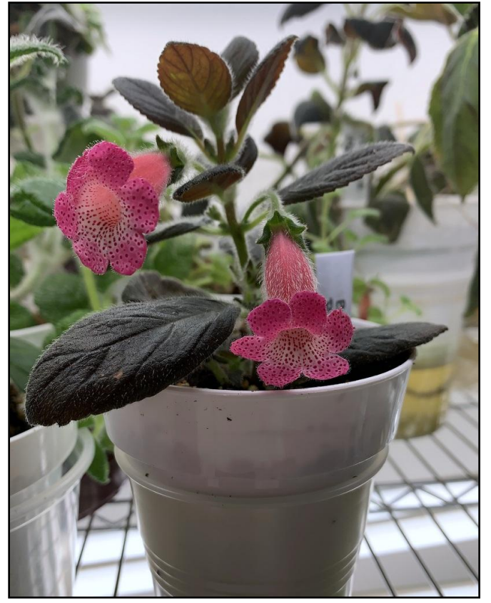
Donna's Kohleria 'Bud's Strawberry Shortcake' purchased from Barb B. at the DAVS sale. Now blooming from one stem after one month!