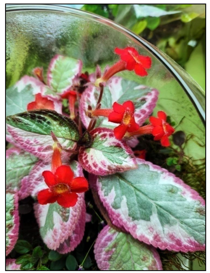
Peggy's Episcia 'Pink Dreams"