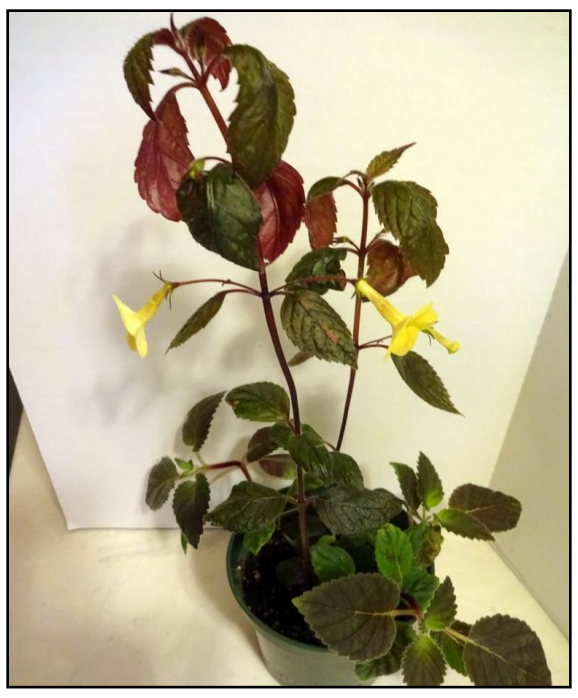
Bill's 'Achimenantha 'Yellow Beauty'