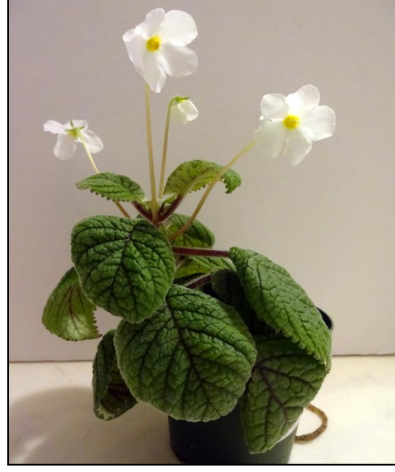
Bill's Niphaea 'Lindl'