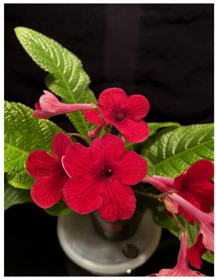
Janet's Streptocarpus 'Ladyslippers® Scarlet'