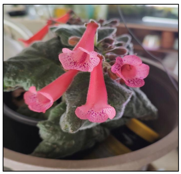
Dave's Sinningia macropoda hybrid