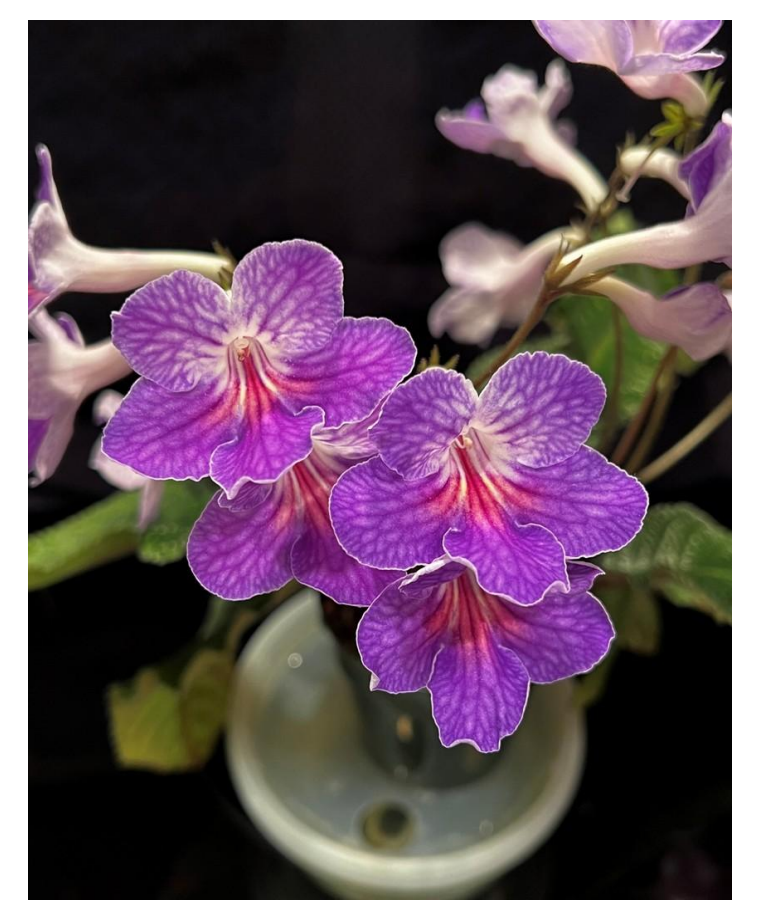
Janet's Streptocarpus 'Janet's Got the Blues'