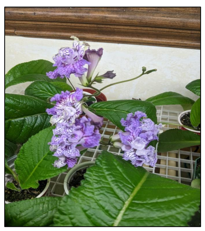
Nadya's Streptocarpus 'Myatnaya Konfetka'