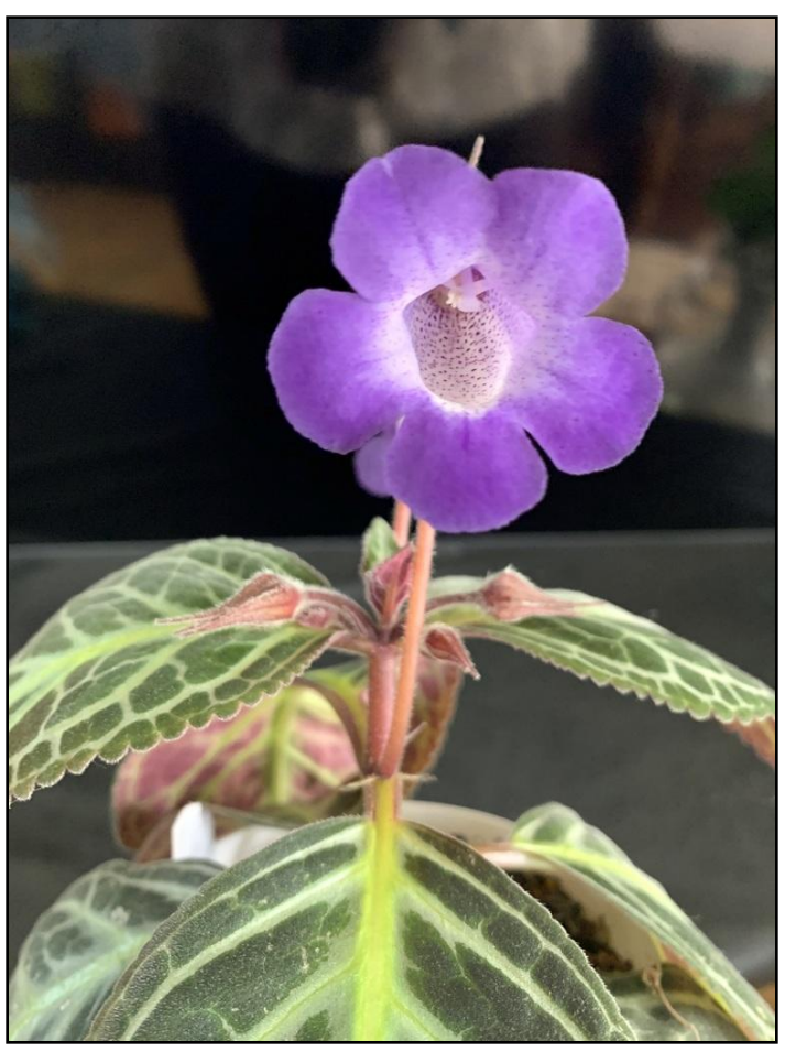
Donna's Sinningia speciosa 'Regina Serra da Vista'