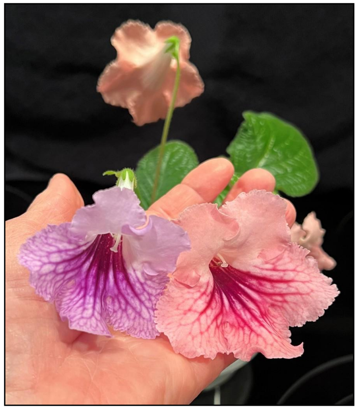
Janet's Streptocarpus 'DS-Mysticism', "Love how the DS-Mysticism really displays a color change from lavender to peach on one plant!"