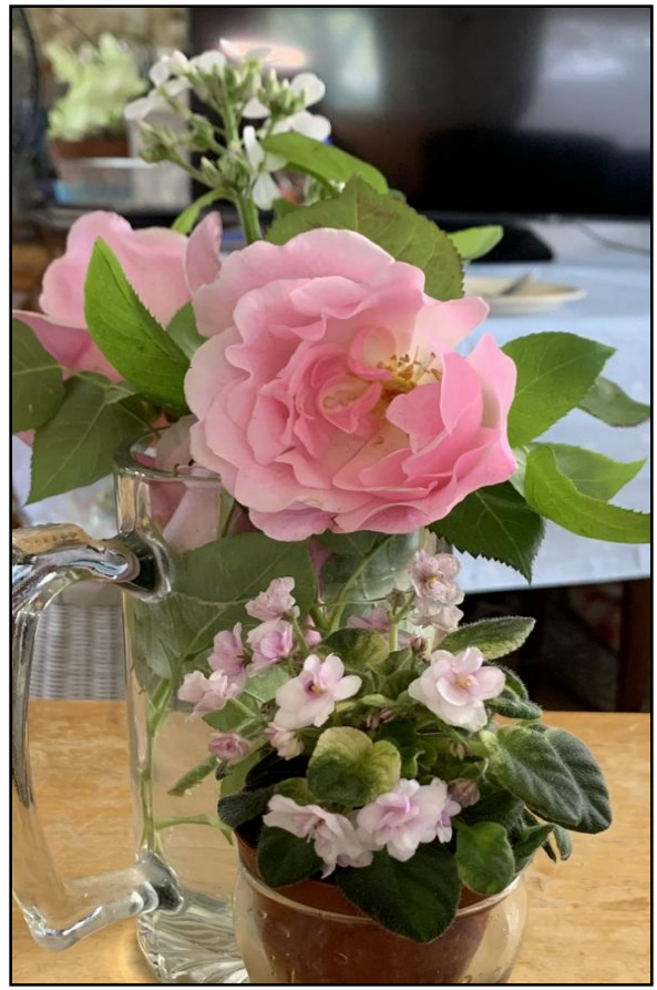
Donna's Saintpaulia 'Jersey Starlight', semi mini trailer