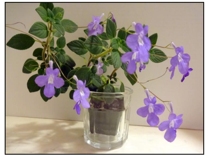
Bill's Streptocarpella hybrid