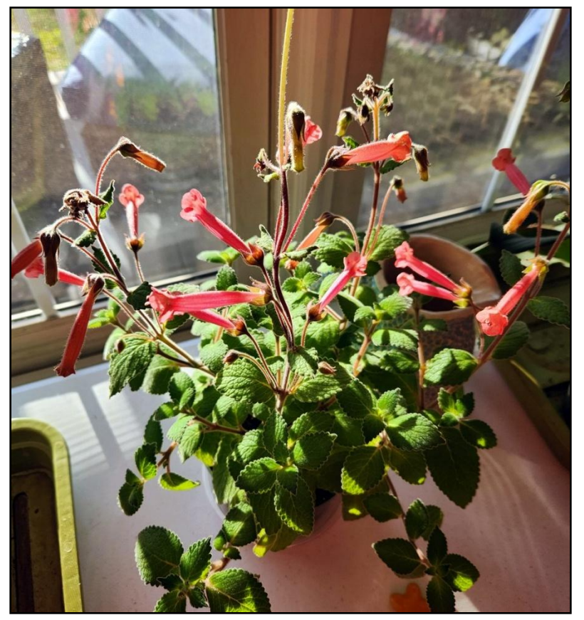
Peggy's Sinningia 'Apricot Bouquet'