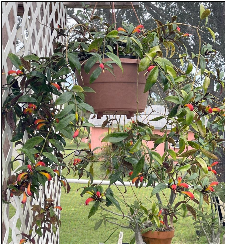
Jim's Aeschynanthus 'Black Pagoda'