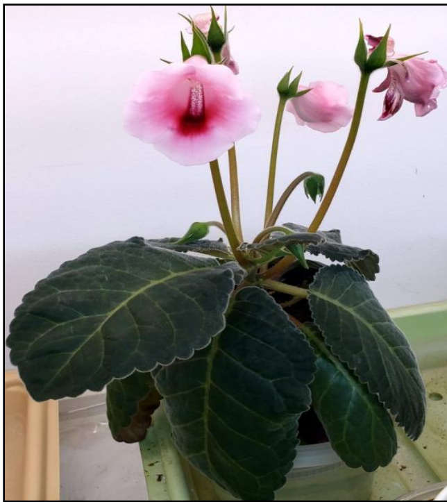
Barb Stewart's Sinningias all grown from Brazil Plants seeds. Sinningia speciosa pink.