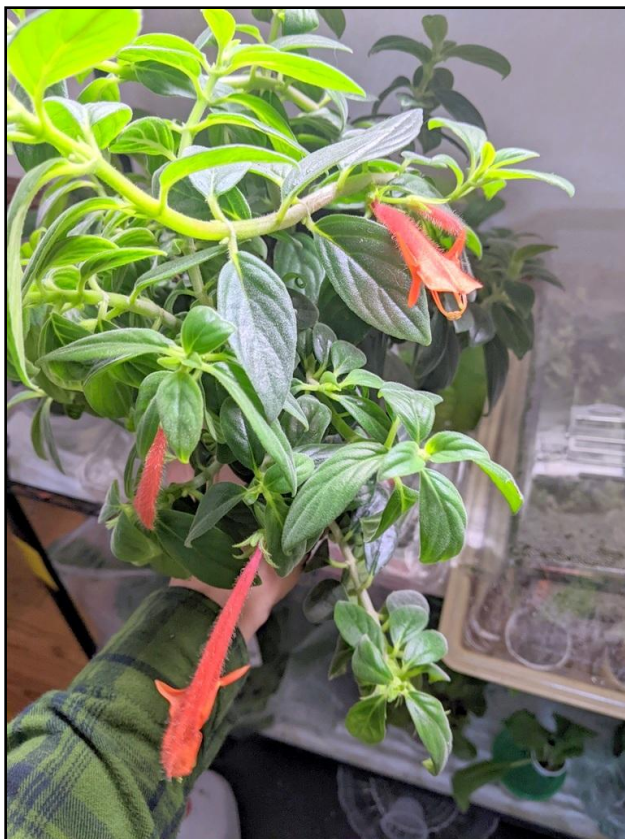
Nadya's Columnea fendlerii