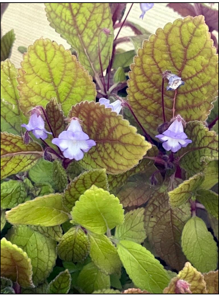
Jim's : Leong Tuck Eucodonia hybrid seedling