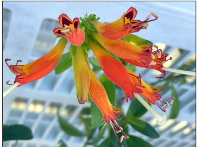
Jim's Aeschynanthus x Splendidus