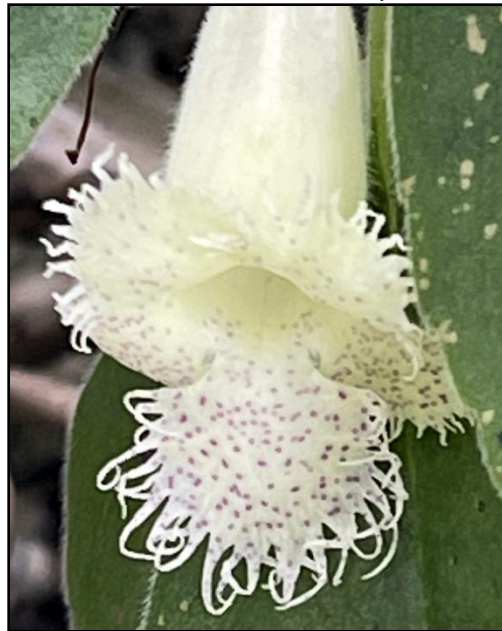
Jim's Alsobia chiapensis