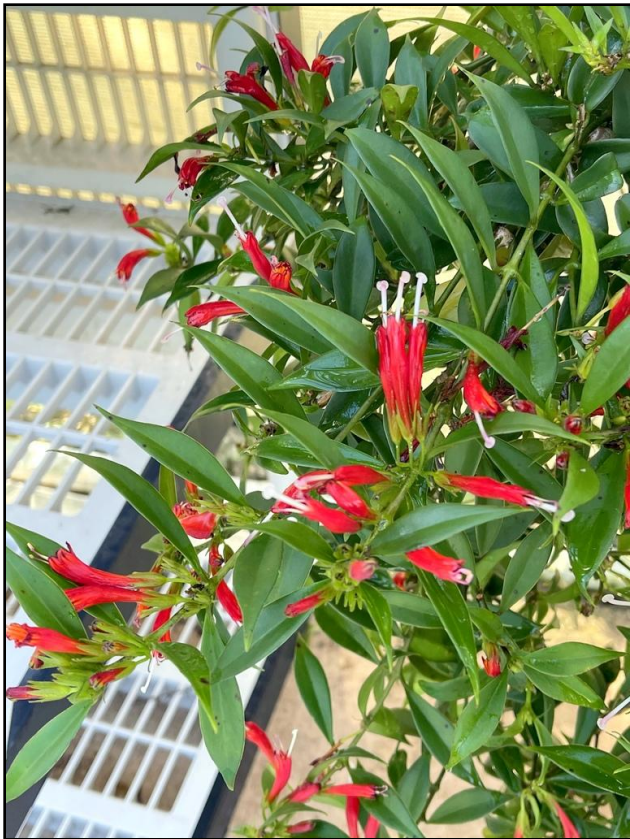
Jim's Aeschynanthus 'Fireworks'