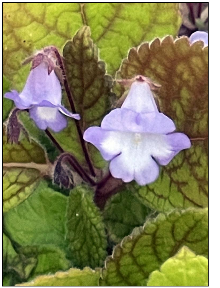
Close up of Jim's Eucodonia blooms