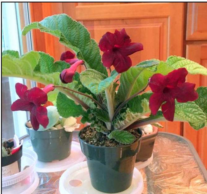
Janet's Streptocarpus 'Vampire's Kiss'