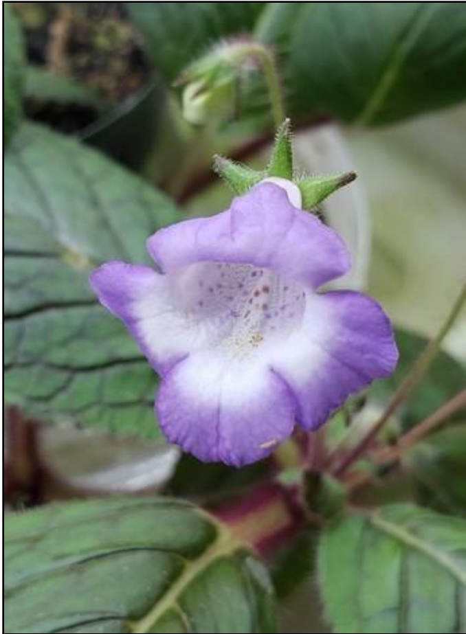
Barb's Eucodonia seedling (L. Tuck mixed hybrid seeds)