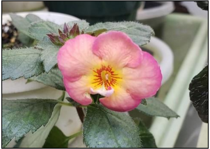
Barb's Achimenes 'Tahiti Sunset'