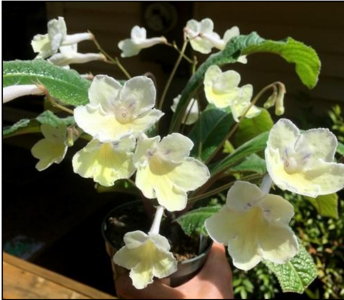
Janet's " Streptocarpus 'Alissa' grown under lights, then in my kitchen window. This plant is getting large and is currently producing a lot of blooms, which are a deeper yellow than the camera captures. I like this hybrid because it often looks very orchid-like due to how the blooms rise up above the leaves." Photo taken outdoors for better lighting.