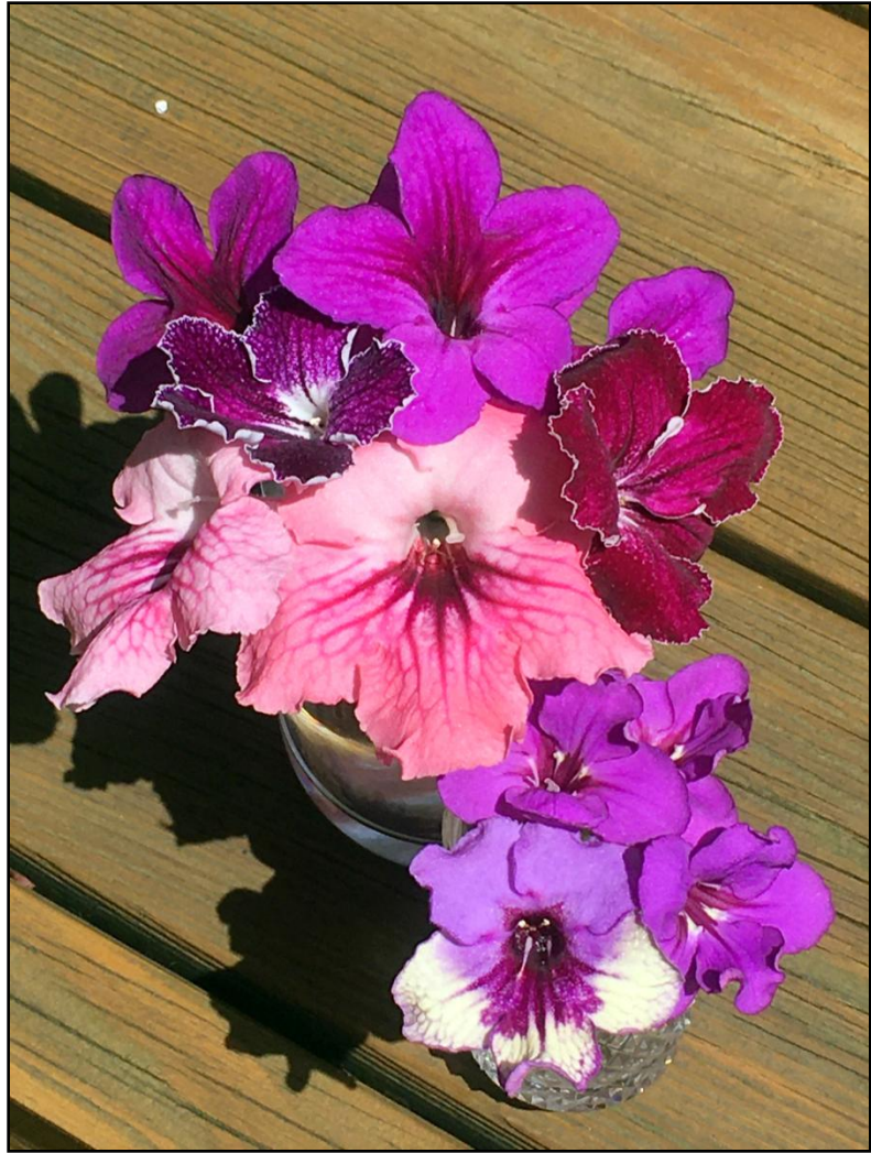
Janet's bouquet of Streptocarpus blooms