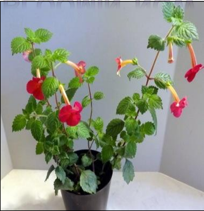
Bill's Achimenes 'Inferno' ( Achimenes glabrata x Smithiantha zebrina )