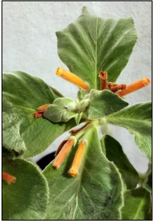
Close up of Max Dekking