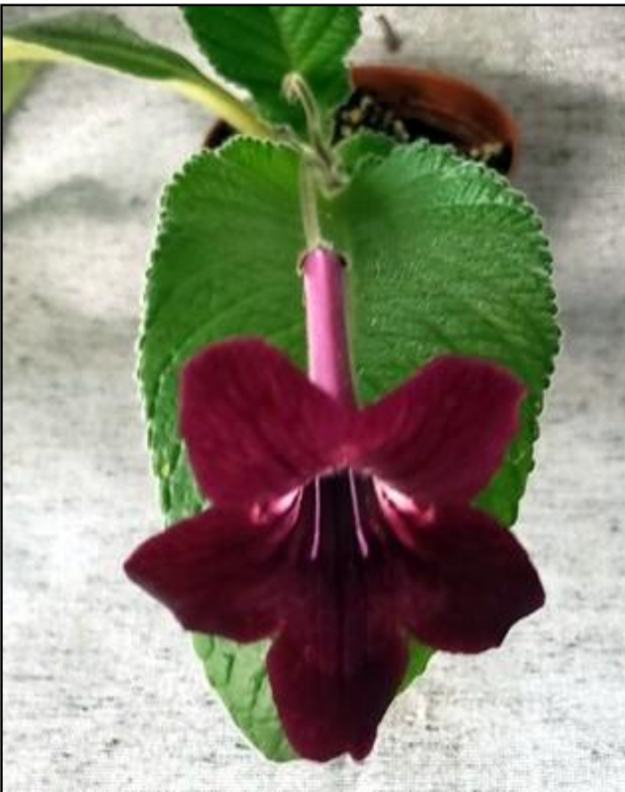
Barb's Streptocarpus seeding