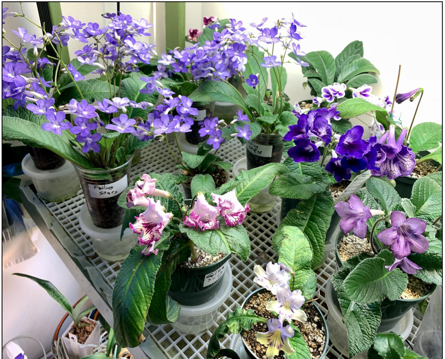
Doug's shelf of prolific blooming Streptocarpus , including S. 'Falling Stars'.

Streptocarpus 'Falling Stars' is a remarkably floriferous hybrid which has brought great credit to its creators, Dibley's Nurseries in north Wales. As many as 25 small, dainty sky-blue flowers with white centers may arise on a single stalk which can cascade over the sides of its pot. A well grown plant can look like a solid mound of pale lavender with a rosette of hairy, oblong leaves.