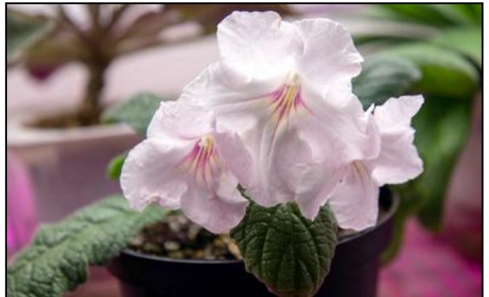
Streptocarpus 'DS-November', bottom right