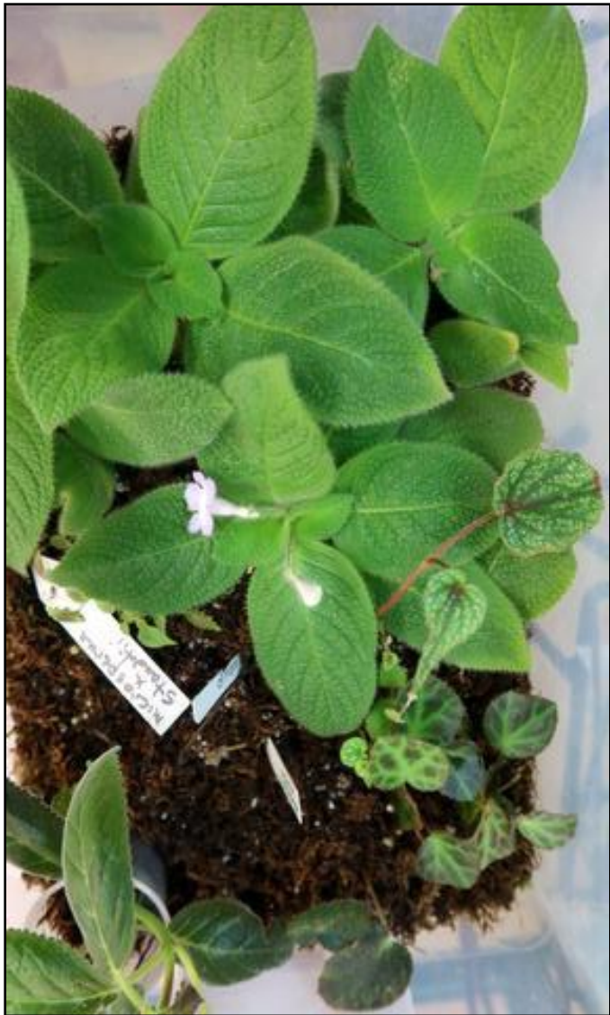
Johanna: " Episcia 'Blue Heaven' rooted cuttings ready for the cutting and plant exchange "