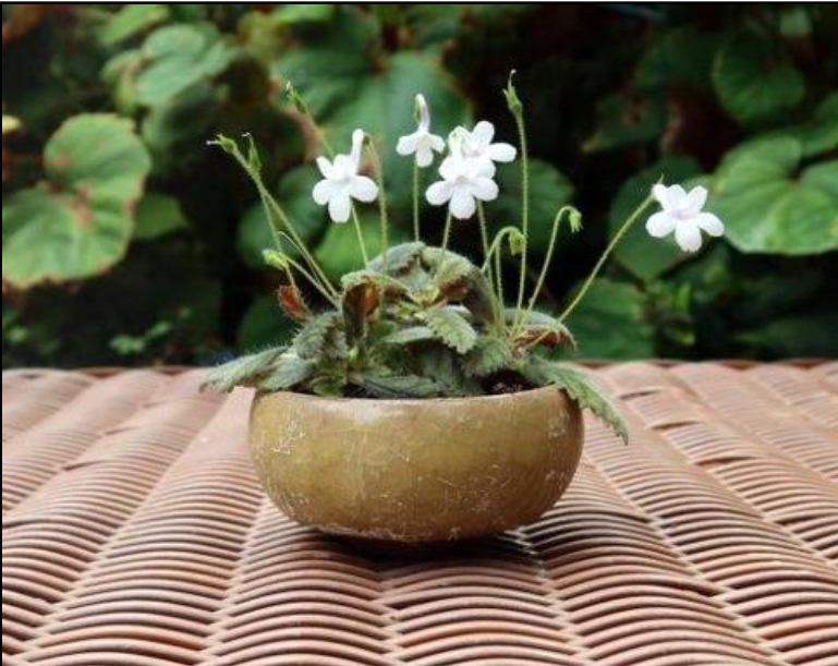
Johanna Zinn's Sinningia musicola . "The blooms are a bit faded from growing in natural light."