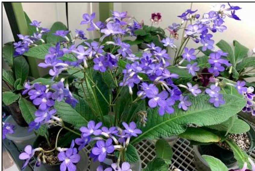
Close ups of Doug's S. 'Falling Stars'

Streptocarpus 'Falling Stars' is a remarkably floriferous hybrid which has brought great credit to its creators, Dibley's Nurseries in north Wales. As many as 25 small, dainty sky-blue flowers with white centers may arise on a single stalk which can cascade over the sides of its pot. A well grown plant can look like a solid mound of pale lavender with a rosette of hairy, oblong leaves.