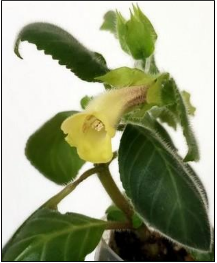
Barb's Sinningia 'Bahai' seedling