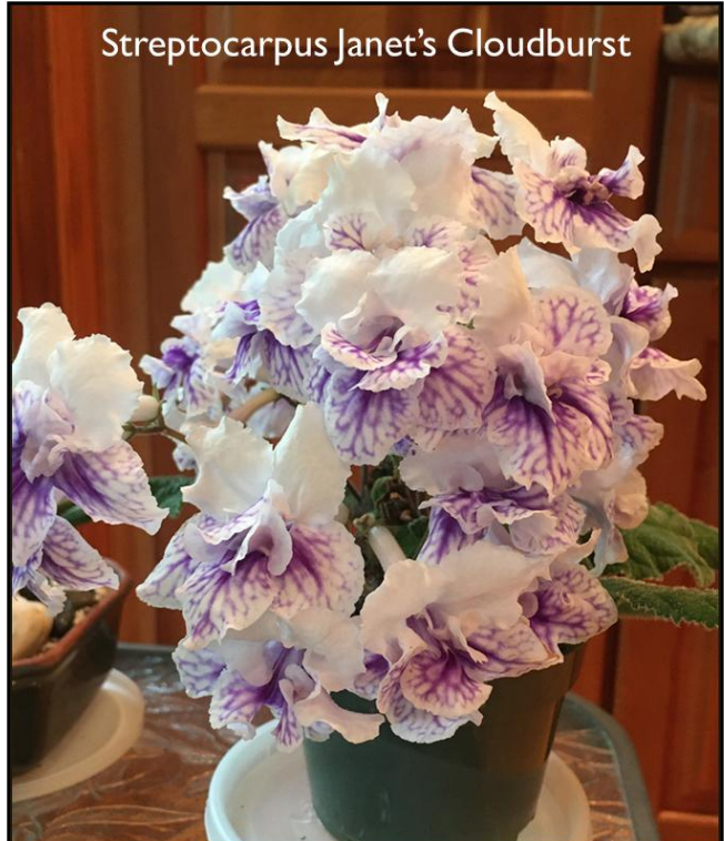
Janet: " Streptocarpus 'Janet's Cloudburst' bursting forth in full bloom. Pretty amazing isn't it? This was just before I cut all the blooms off to revitalize the plant. Many old leaves need to be removed and the entire thing needs to be potted down and allowed to re-grow."