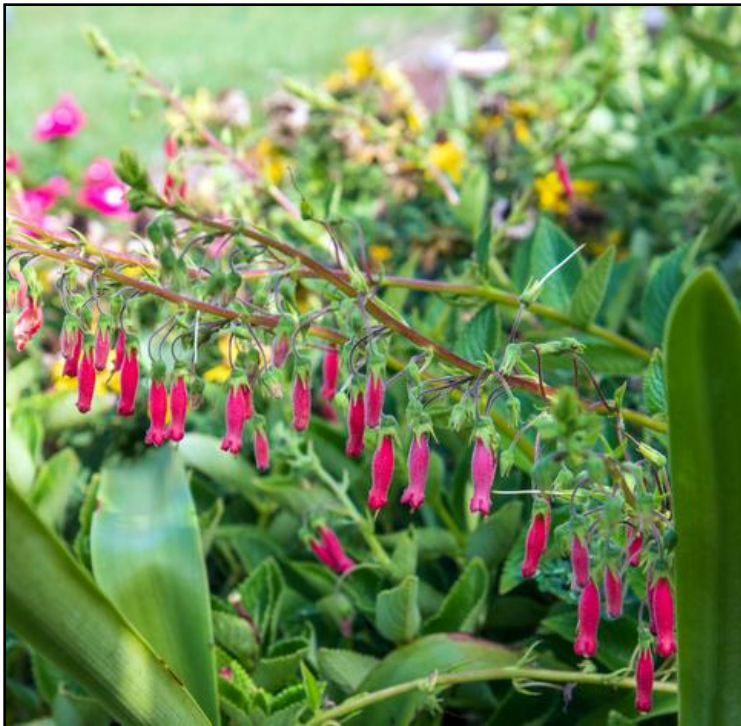
Alcie's plants: Sinningia sellovii close up above