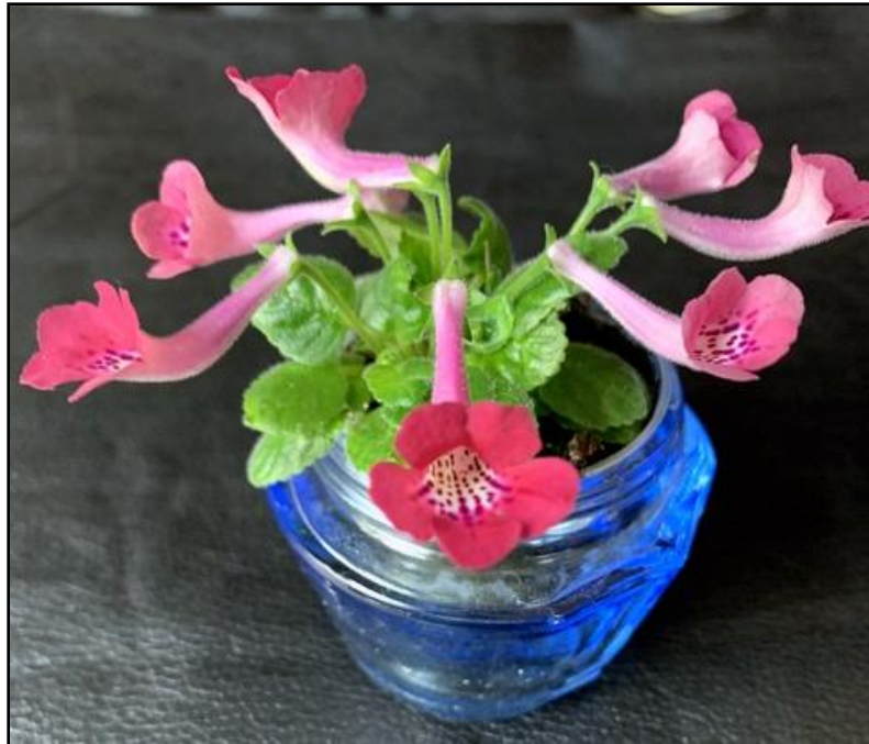
Donna's Sinningia 'SimSim Salaviem' tiny pot in a recycled cosmetic cream container. This little one never stops!! Even the older, faded blooms look colorful!