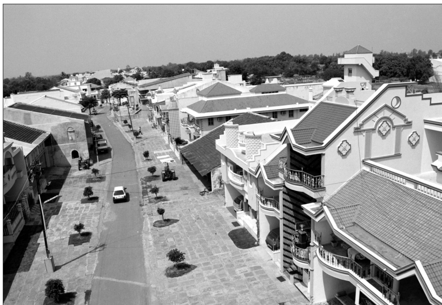
Middle-class neighborhood in Delhi. "No class has been more central to India's fortunes than the middle class and any understanding of the post-liberalization period calls for coming to terms with how this class is being transformed even as it is being preserved." (Courtesy: Jan Breman, from The Poverty Regime in Village India , Oxford University Press, forthcoming 2007)

sector, the business press and multilaterals routinely denounce unions and labor laws for overprotecting workers. Meanwhile, the NMC supports privatization of education despite the fact the large segments of the middle classes depend on public education (state funded higher education has been a significant support of the middle classes) and the fact that primary and secondary school education has lagged behind in quality and access for most of the postindependence period. 48 And at a time when the World Bank recently found that 47 percent of Indian children are underweight, the public food distribution system has been rolled back. 49 The breathless abandon with which the English-language media trumpets India's growth is accompanied by increasing disdain for the role of the state and politics and a high modernist impulse (fed by multilaterals) to insulate necessary social and economic policy in the hands of technocrats (i.e., economists) far from the messy world of politics. This form of antipolitics has had significant implications for the substantive workings of democratic politics. As new actors (from previously subordinated groups such as the lower castes) have entered political society and claimed the unredeemed normative claims of a constitutional democracy (e.g., equality of treatment, basic rights), the middle class has increasingly debased politics and the new lower class/caste politicians as dirty, dishonest, corrupt, criminal, and vulgar.