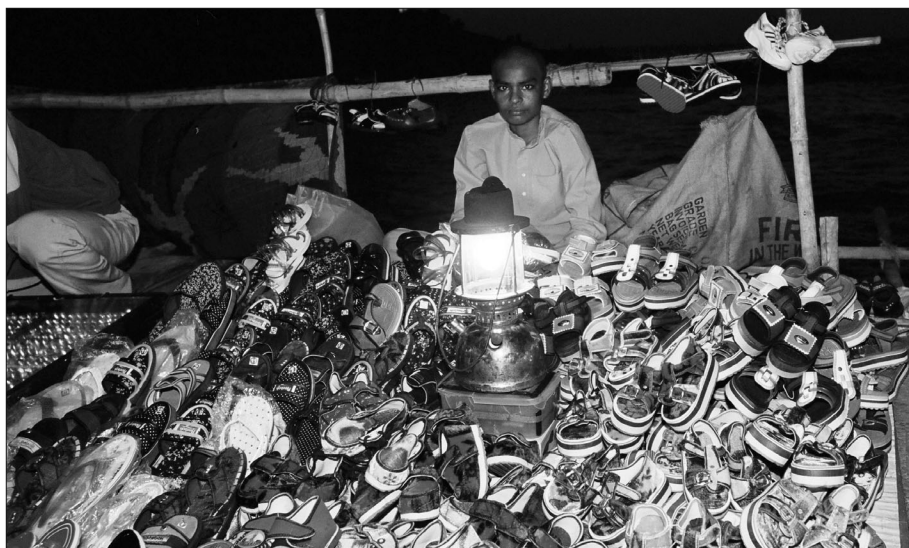
Stall of a merchant near the dam of the Haji Ali mosque, Mumbai. The central role the new middle class plays in the politics of hegemony is marked by "middle class illiberalism" and most notably by a distancing from India's lower classes.

dia's drive to open and modernize its market economy. On the other hand, significant segments of the middle class have played a key role in the rise of Hindu nationalism. The ideological and social basis of Hindutva is far too historically complex to be simply equated with the NMC. Yet the consolidation of Hindutva as a political movement marked both by the rise of the Bharatiya Janata Party (BJP) and the Congress Party's periodic attempts at courting a Hindu nationalist vote 9 cannot be explained without reference to the political reconfiguration of the middle class. From its fairly limited traditional support base in trading castes, the appeal of Hindu nationalism has spread rapidly into the ranks of the broader middle class over the past two decades. We argue that Hindu nationalism has resonated with large sections of the Hindu middle class because its doctrines of nationalism and cultural essentialism provide an ideological frame for NMC self-assertion as well as a political response to newly mobilized lower class constituencies and their varied claims for incorporation. 10