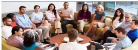
NAMI Family-to-Family National Alliance on Mental Illness

NAMI offers the NAMI Family-to-Family Education Program free of charge to participants, beginning July 11, 2023 . For more information and how to register, please contact NAMI Cabarrus at 704.436.8736 or register online at namicabarrus.org .