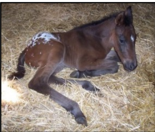
Ima Rockin Secret F2-2711 as a foal. See him in the ICAA Stallion Showcase

To make matters worse, "Honey's" foal "Smart Rockin Rosie" decided to try and jump into a door at the age of 5 months and broke her front leg and was on stall rest for 4 months. Constrained with those medical bills, I was unable to do anything but work and work some more. I was interested in starting to do some showing later that year, but meeting several members of the ApHC who were not very nice neither helpful, so I decided to not go down that road.