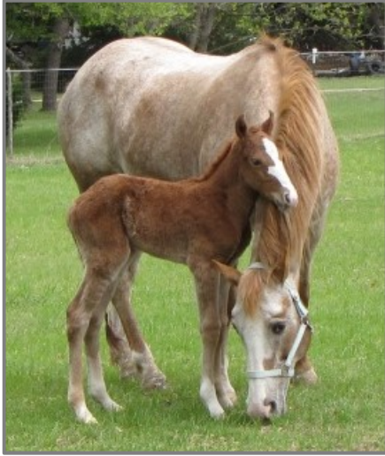
"Honey" and Smart Rockin Rosie