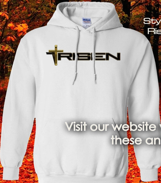
Style 3 Risen