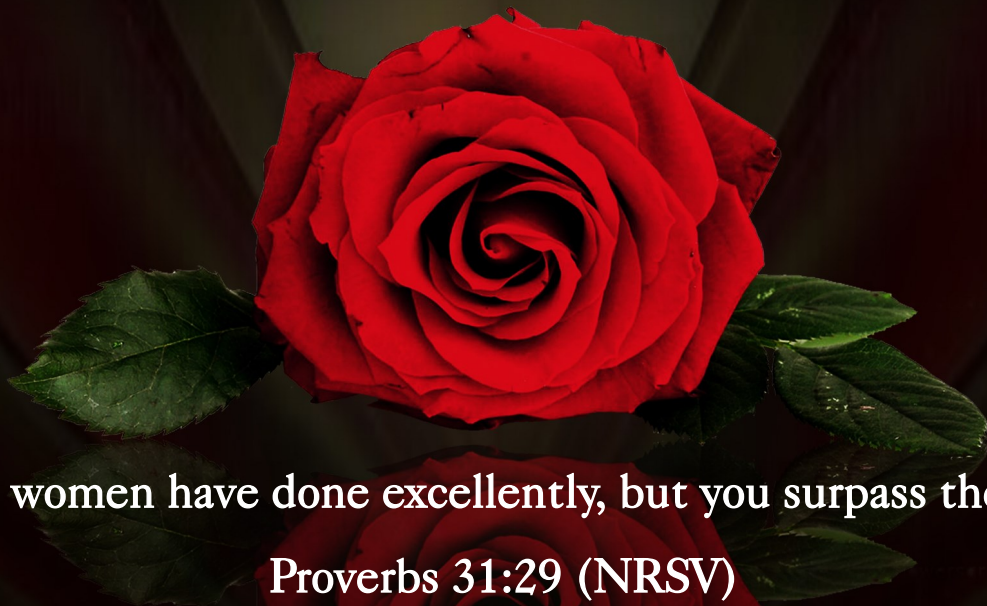
Elder Diane Harvell PA

"Many women have done excellently, but you surpass them all."