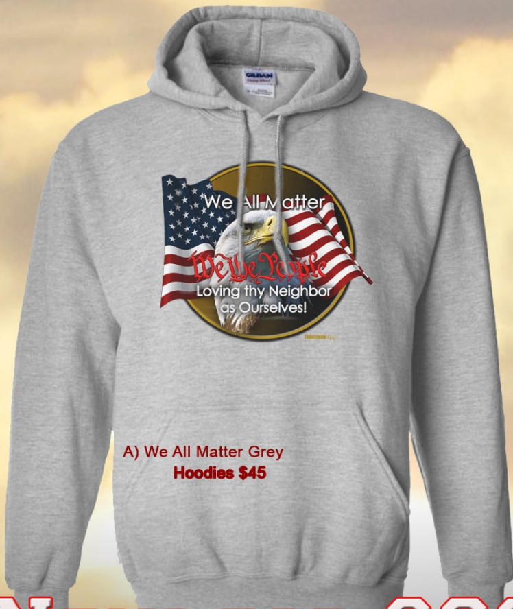
A) We All Matter Grey Hoodies $45

**Words in italics are quotes; words in both italics and bold are words spoken by the Lord and our God as written in the Holy Scriptures.