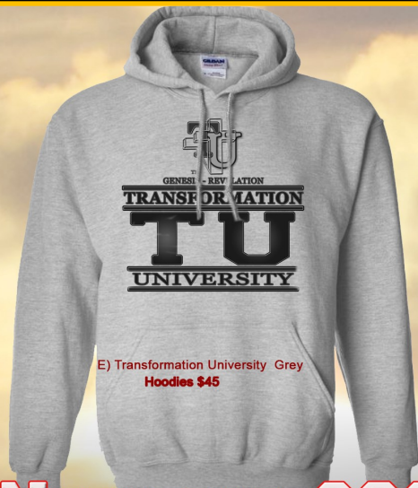
E) Transformation University Grey Hoodies $45