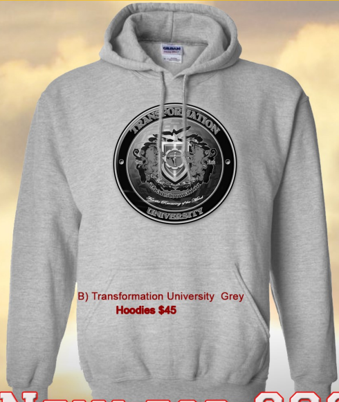
B) Transformation University Grey Hoodies $45