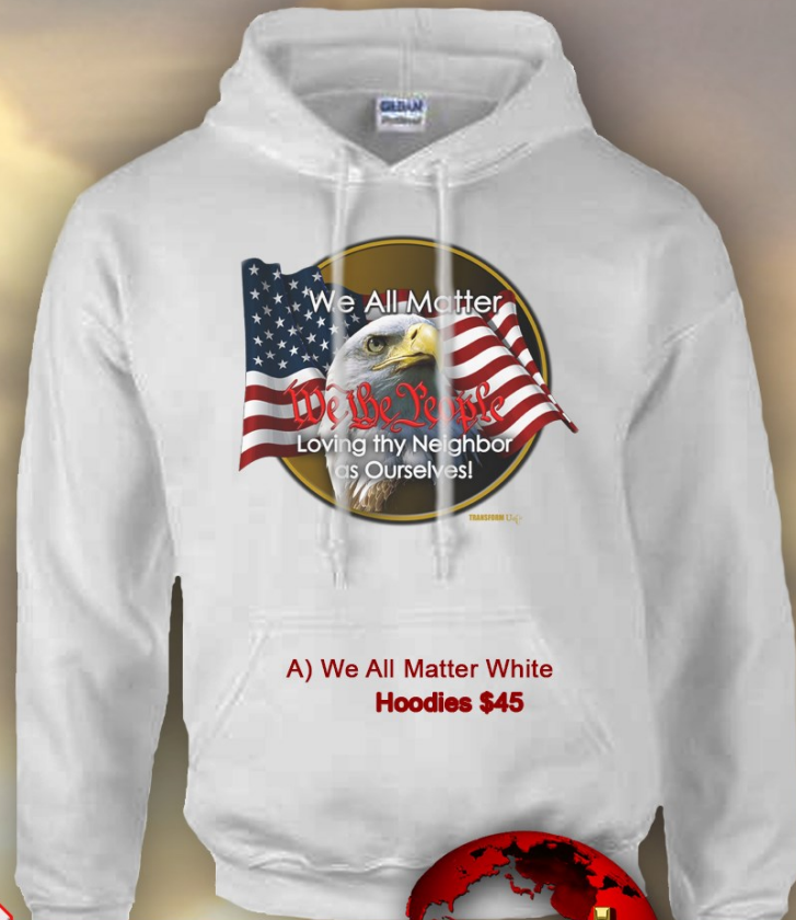
A) We All Matter White Hoodies $45