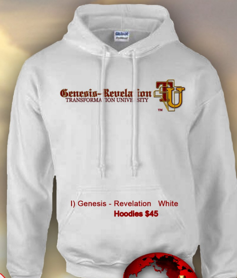
I) Genesis - Revelation White Hoodies $45