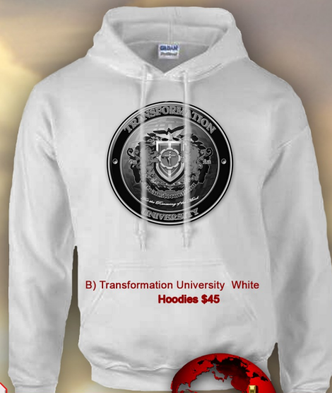
B) Transformation University White Hoodies $45

If you love studying Word of God, learning the principles of God. Than you are a student of Transformation University. This line celebrates being apart of the largest student body in the world!