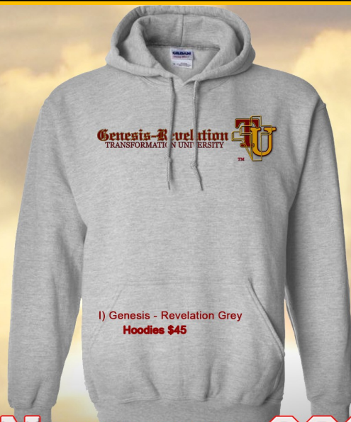
I) Genesis - Revelation Grey Hoodies $45