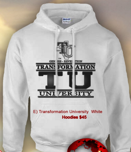
E) Transformation University White Hoodies $45

We invite you to visit our website: thetransformu.com and click on Transform U Wear to see our offerings. For questions or if you would like to speak to someone regarding ordering a garment