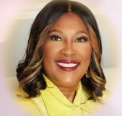
Calvary Community Church Hampton, VA