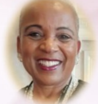
Restoration Christian Church, Newport News, VA

Sponsored by: New Grace Church Empowered Women of God Ministry