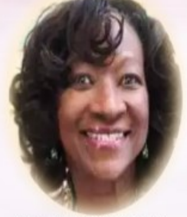
New First Baptist Church-Taylorsville Portsmouth, VA