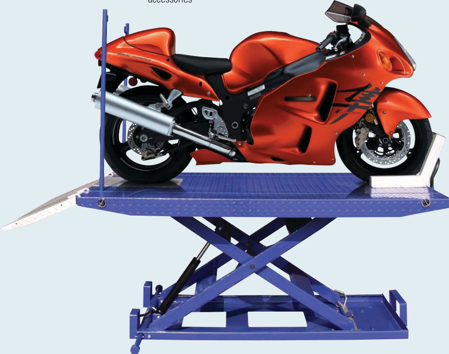
M-1500C-HR Motorcycle lift shown with standard accessories

These lift tables are ideal for making repairs to motorcycles, snowmobiles, ATVs, jet skis, etc. Choose from a range of accessories to customize these tables for your shop.