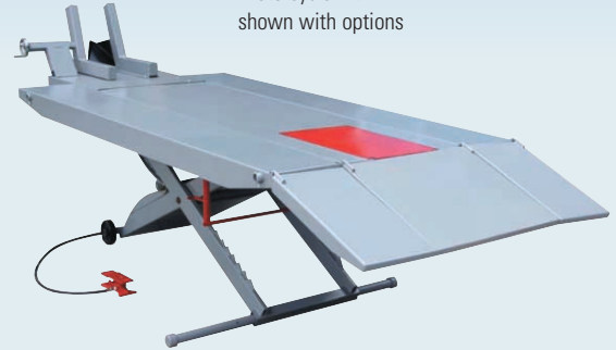
M-1000C Motorcycle lift shown with options