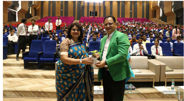
Launch of the exclusive partnership with GL Bajaj Institute of Technology and Management in India

We have designed a Senior Management programme (half-day / 4 hours) focused on changing workplace requirements , and the opportunities and challenges in the higher education sector. A hybrid Faculty Development and certification programme for our strategic