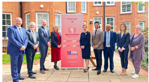
Visit of the Western Sydney University senior leadership delegation to our office in the United Kingdom

ential learning opportunities to prepare learners for sustainable careers in the global digital economy .