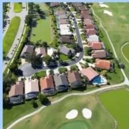
About our community

The Best of Everything is a good way to describe our community. Indian Wells Golf Villas is a gated community consisting of 44 neatly manicured single family homes located in the prestigious Lely Resort.