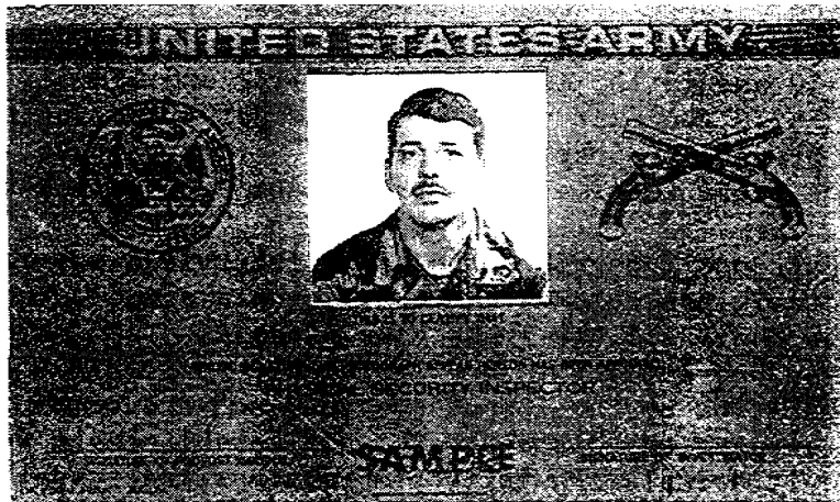
DA Form 4261

(2) Every two years for other mission essential or vulnerable areas or activities as directed by the local commander.