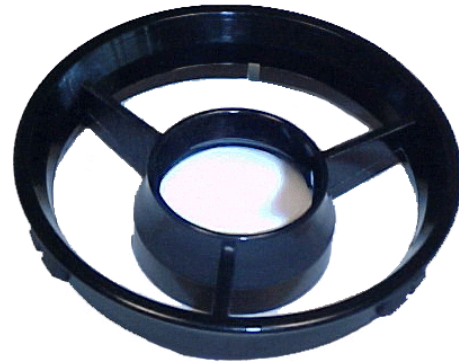
Lens Cap Assembly