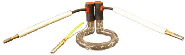
Flash Lamp Assembly

Eligibility: Boeing 737-600/-700/-800/-900/-900ER Series Aircraft